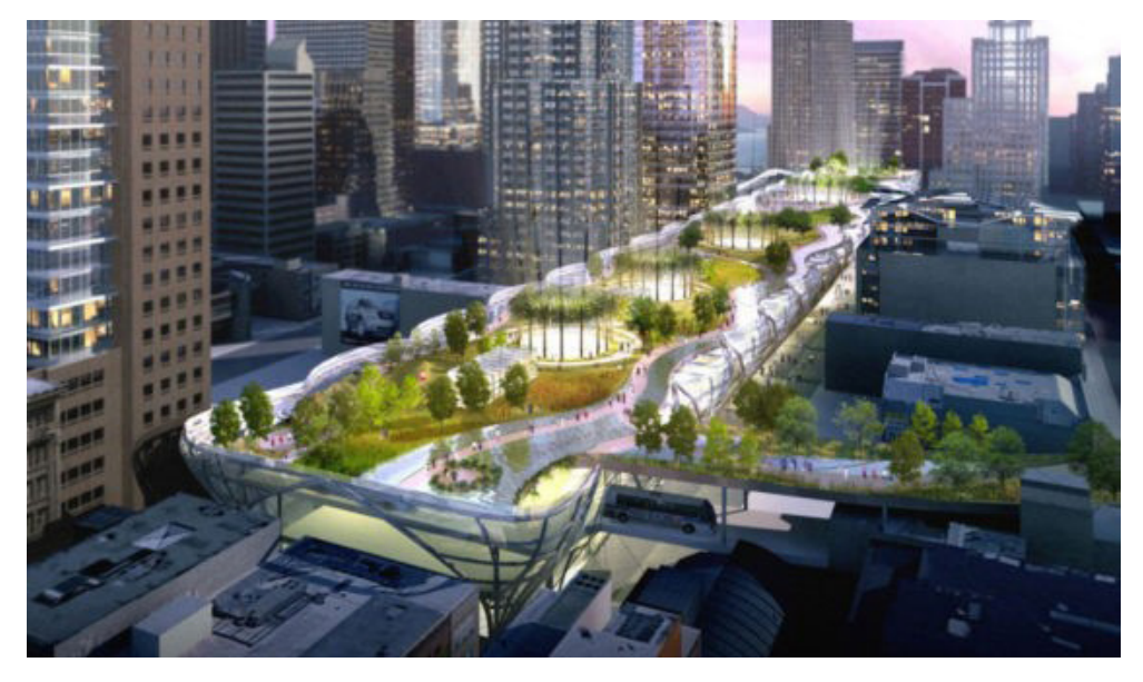
Ill. 2. 'Eco filter'