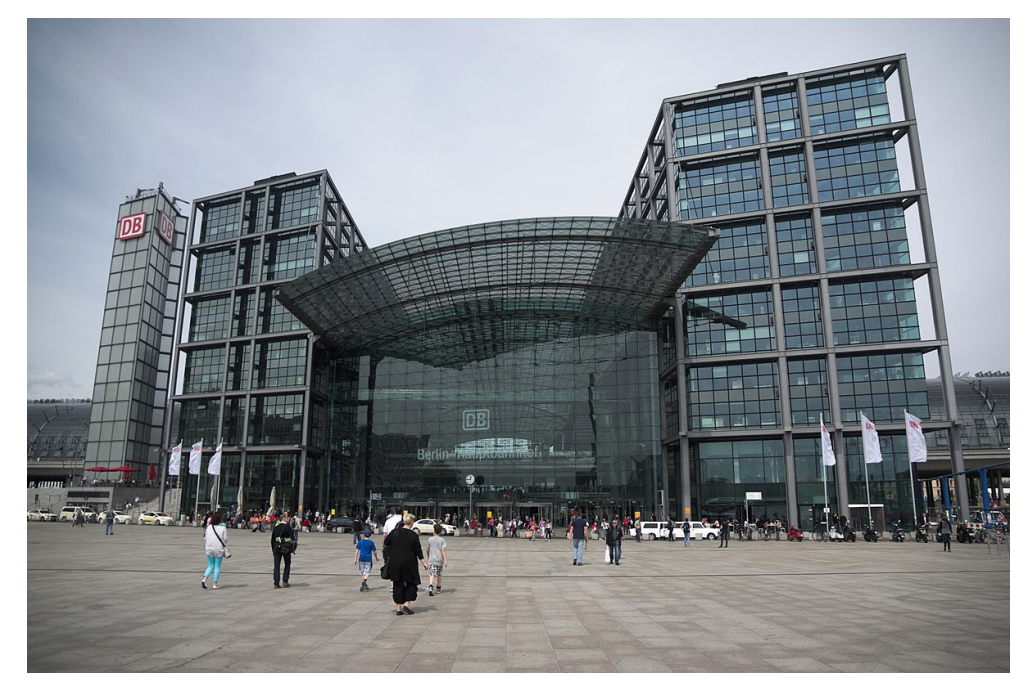
Ill. 1. Central Railway Station in Berlin