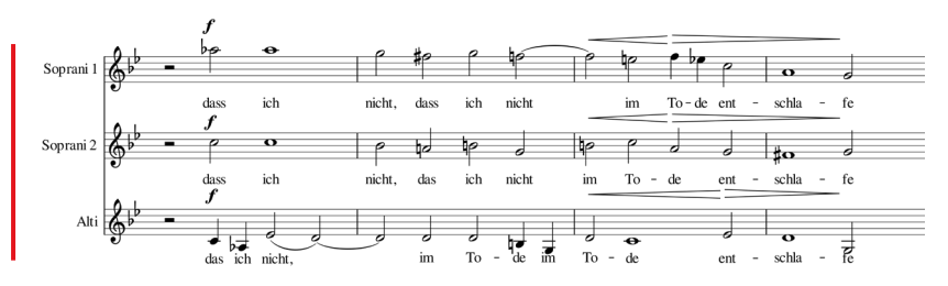
Ex. 7: J. Brahms, Psalm XIII Op. 27, bb. 51–54. Figures: pathopoeia , passus duriusculus , hypobole .

The words telling about "the sleep of death" ("dass ich nicht dem Tode entschlafe") are treated by the composer in a totally different way—their negative meaning is underlined by the use of the figure katabasis in altos, pathopoeia in the first sopranos and passus duriusculus in the second sopranos. Moreover, in the part of alto the lowest sounds of the register of this voice are achieved ( hypobole ; Example 7).