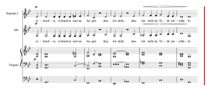
Ex. 8: J. Brahms, Psalm XIII Op. 27, bb. 55–59, the part of second soprano, alto and organ. Figures: anabasis, hypotyposis .

With the repetition of the text from the third verse in the following bars of the work, Brahms uses the analogical techniques: the word "erleuchte" determined the ascending melodic line of the second sopranos, finishing with the cadence in the major key (this time in F major), and the already mentioned "sleep of death" is illustrated by the composer through "waving" shape of the bass line in the part of organ<sup>32</sup> (Example 8).