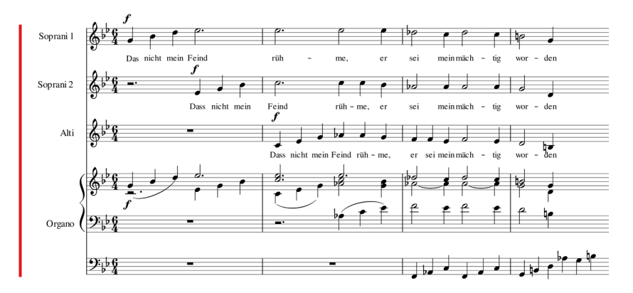
Ex. 9: J. Brahms, Psalm XIII Op. 27, bb. 60-63. Maniera distendente.

Kwartalnik Młodych Muzykologów UJ, No. 39 (4/2018)