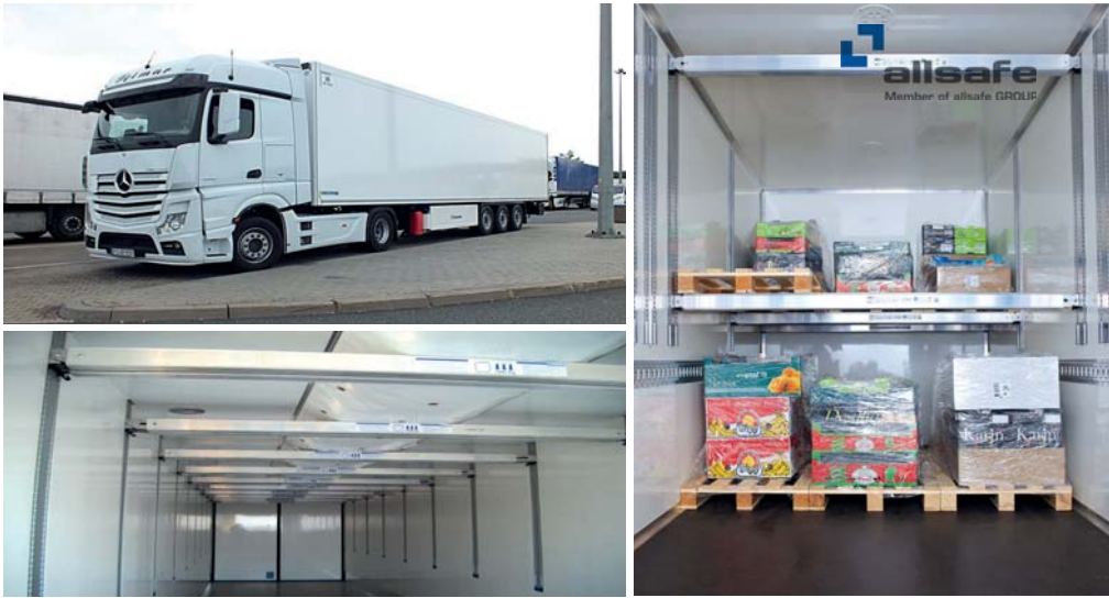
Fig. 2. Mercedes TGX 6x2 480 and Krone Cool Liner cooling semi-trailer with ATD II system