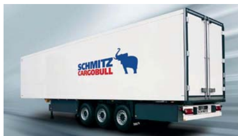
Fig. 1. Volvo FH 4x2 420 and Schmitz Cargobull cooling semi-trailer