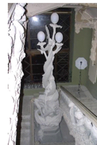
Ill. 6. Comparison of initial appearance of lamps on archive photos and restored lamps (from the funds of "Ukrrestavratsiya" corporation)