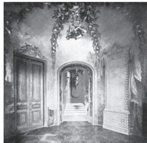
Ill. 2. The shell lamp in the entrance hall of the House with Chimaeras. The archive photo of the early 20th century from the personal archive of J. V. Ivashko

western centres, which at that time belonged administratively to the Austrian-Hungarian Empire. Around 1908–1910, the new style popularity in all the Art Nouveau centres, except for the western ones, began to decrease. In the same way as in the European countries, the development of Secession in Ukraine took place on the background of rapid economic development, the activity of the new social class, the bourgeoisie, and was connected with the implementation of a large number of technical inventions.