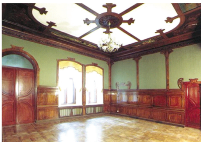
Ill. 5. General view of the 'English office' after the restoration.

restored premises. In total, according to individual drawings, 66 chandeliers and lamp-brackets (15 chandeliers of ten types, 51 lamp-brackets of seven types) were made, besides 95 chandeliers and lamp-brackets (23 chandeliers of seventeen types, 72 lamp-brackets of thirteen types) were manufactured (ill. 6). Consequently, we can state that the lighting system of the building taking into consideration its uniqueness was exclusive, which determined the variety of types of lighting devices used.