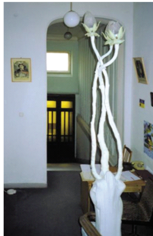
Ill. 1. The lamps of the Kachkovsky Clinic stairwell.

The ‘Dialogue with the East’, which lasted during the process of familiarization of the European artists, architects, collectors with the Eastern art, influenced the formation of European Art Nouveau [12]. A well-known Art Nouveau researcher, D. V. Sarabianov, emphasized that the influence of Japanese art was felt at the beginning of the Secession style formation which led to the influence of the East, that is to say, from “inside the style”, in all its manifestations, undergoing transformation in accordance with the European world perception [7]. There were several prerequisites for the Secession development in Ukraine, and they differed depending on the ad-