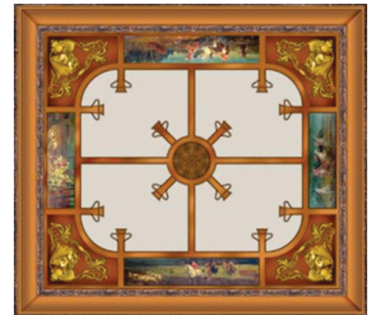
Ill. 4. The glass globe of the ‘English office’ of the former Rodzianka flat. The drawing from the funds of “Ukrrestavratsiya” corporation

sident of Ukraine. Since in the Soviet times, the government polyclinic was located in the house, typical standard Soviet lighting devices were installed everywhere and no original lamp from the time of V. Gorodetsky was preserved. Therefore, during the restoration and recovery work with the new building adaptation, our specialists had to study the enormous number of archival sources and perform the research of the original lighting system to provide the authentic look of the