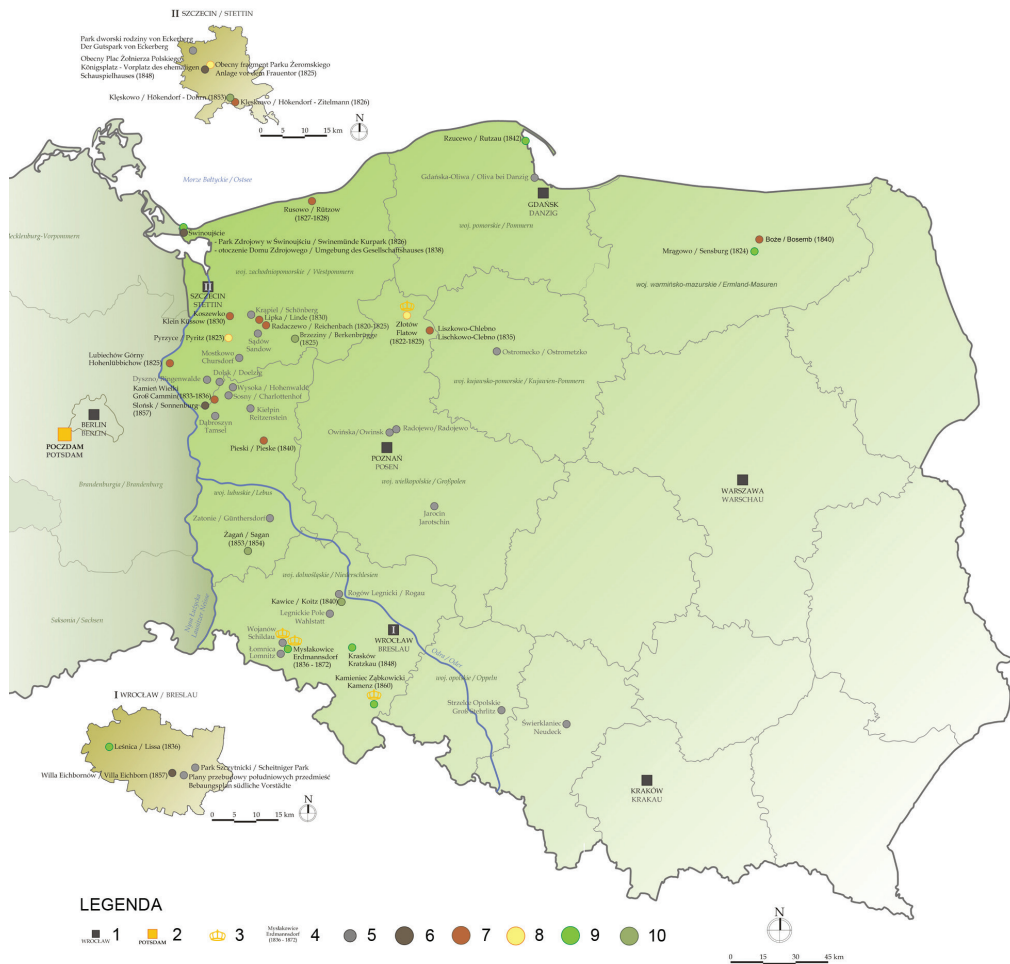
Fig. 1. Park and garden layouts by P.J. Lenné in Poland; Legend: 1 – major cities, 2 – the seat of the Prussian royal family and Lenné’s place of work, 3 – layouts belonging to the royal family, 4 – layouts confirmed by plans, 5 – layouts attributed to Lenné; Condition (6–10): 6 – dilapidated, 7 – neglected/abandoned, 8 – well-maintained, 9 – renewed, 10 – commissioned to Lenné, probably not built; by J. Mazur and J. Jaworek-Jakubská, 2014

cultural landscape in each of these places. The most accurate description of the character of his designs was expressed by Heinrich von Salisch 8 in 1885, who described the park in Krasków: “The traveller who does not know the history of the landscape work will say: how beautiful, how wonderful, once again we can see here: that untouched wildlife is and forever will be the most beautiful” [41, p. 343]. Although Lenné’s parks appeared to be the work of nature herself, they were actually created as a result of laborious and often very expensive projects. The scale of these projects is illustrated by selected cases from Silesia and Pomerania.