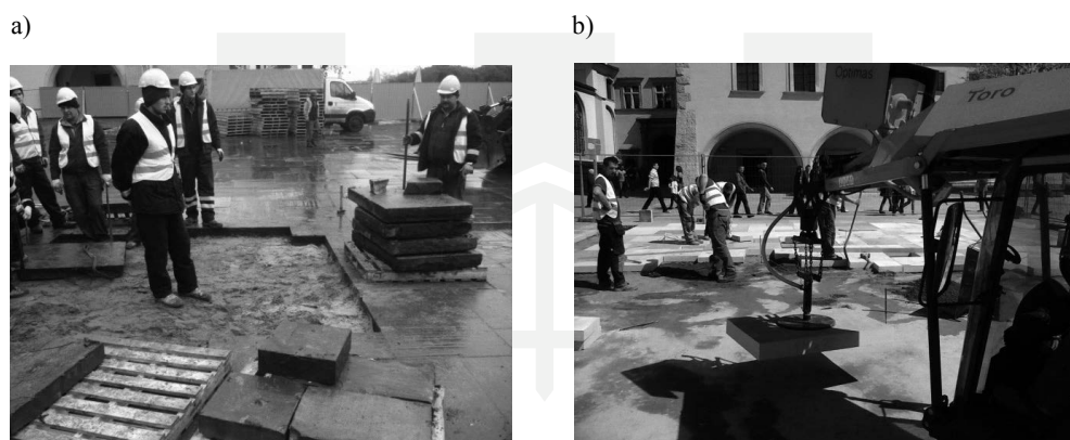
Fig. 4. Methods of dismantling stone slabs: a) Manual b) Mechanical

of their re-installation. This approach (the idea of maximum recovery of material) determined the need for their careful dismantling and moving onto hauling equipment, in order to take them to a place of possible further treatment. Attempting to manually disassemble slabs and their transfer to the designated place quickly proved to be inefficient due to heavy labour intensity, the consequence of which was the low efficiency of this operation. The large area of removed surface stone (over 4,500 sq. m.), the high cost of labour and time regime, demanded an immediate change of the technology and work plan through the use of special machines, whose pneumatic fittings allowed careful removal of stone slabs and efficient transfer onto hauling equipment. The investment in specialised equipment gave contractor tangible benefits in the form of high efficiency and much lower labour costs, and in the long term the equipment proved to be invaluable when laying new pavement (Fig. 4).