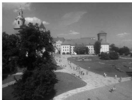
Fig. 1. View of a part of the outer courtyard along with access roads on Wawel Hill: a) during renovations, b) after renovations