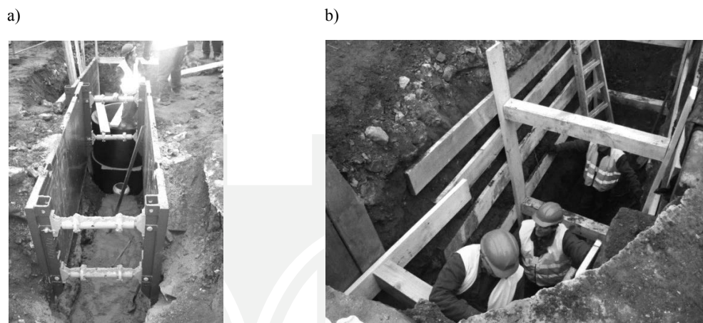
Fig. 2. Method of securing excavation walls: a) for reopened excavations b) for new excavations, with prior archaeological reconnaissance

this method allowed the contractor to maintain a high pace of work at relatively low cost of labour needed for its execution. However, during the course of the work it was found that this shoring technology could be used only in reopened excavations (i.e. on the route of the old sewerage network). In a situations when the route of the new sewerage network did not overlap with the existing one, the archaeological supervision forced the contractor to change the method of securing excavation walls using a (traditional) skeleton sheeting method (Fig. 2).