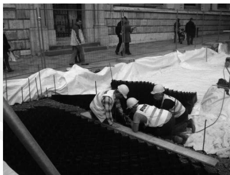
Fig. 3. Methods of strengthening weak soil: a) in the lower left corner the originally designed strengthening using geogrid can be seen, b) The said geocell

After the test on the trial plot, strength tests were carried out again, and this time results reached the designed value. Changing the method of strengthening the subgrade caused an increase in expenditures on labour and equipment as well as the execution time of one sq. m. of such reinforcement took much longer, not including the time needed to train workers for whom this solution was new. This spatial structure had to be laid manually. The method of compacting each layer of the geocell required the prior laying of a 5 cm layer of aggregate, whose task was to secure the top part of the geocell from mechanical damage due to rolling. After compacting and execution of verification tests, the protective layer had to be removed in order to implement another geocell layer. Thus, the level of producibility of the above solution meant that the implementation of such reinforcement was not easy in the existing production conditions.