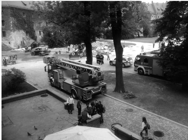
Fig. 5. a) Plan of renovation stages, b) Fire fighter exercises during construction works