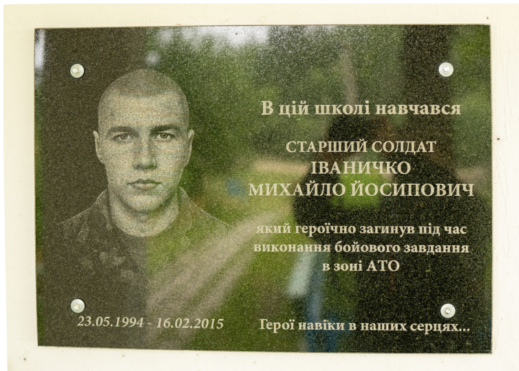
Fot. 24. A plaque in memory of a soldier killed in the ATO zone in the Russian-Ukrainian war, the village of Karpatske (Ukraine)