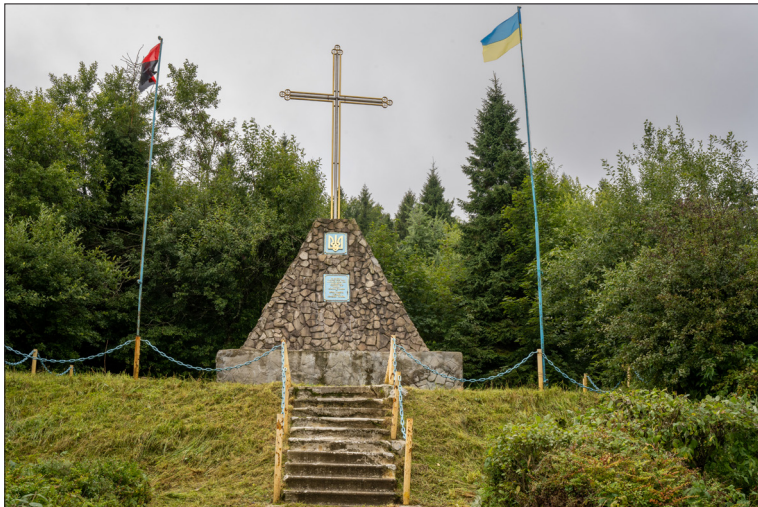
Fot. 2. Commemoration of the first battle of Sich Riflemen at the Uzhok Pass (Ukraine)