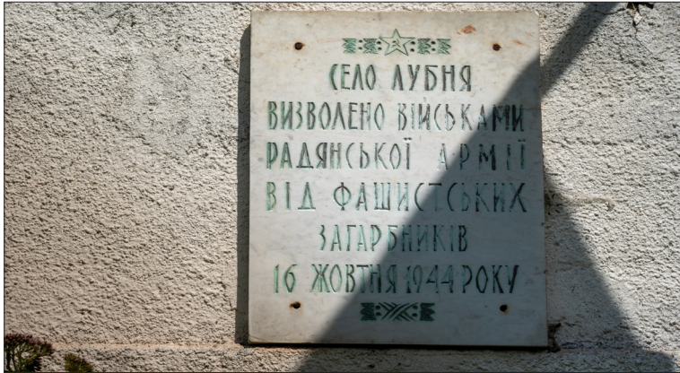
Fot. 11. Memorial plaque related to the liberation of the village of Lubnia (Ukraine)