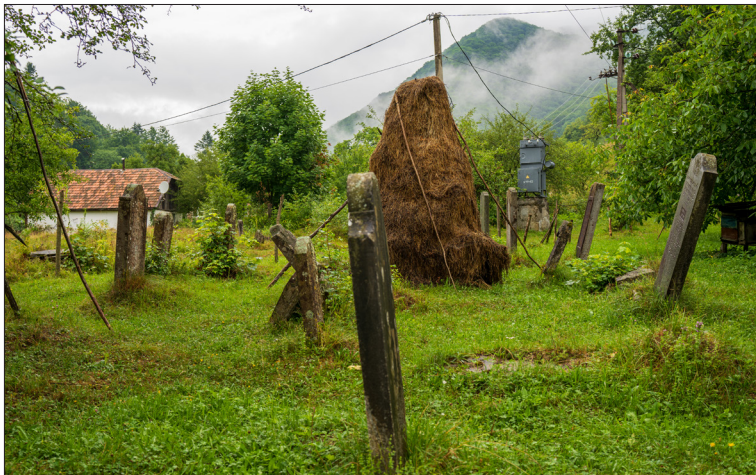
Fot. 8. Jewish cemetery in the valley of the Uzh River, near the village of Luh (Ukraine)