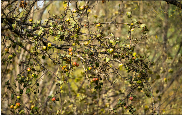
Fot. 19. Old apple trees on the grounds of the non-existent village of Jaworzec (Poland)