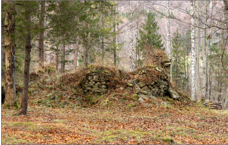
Fot. 17. Ruins of the Greek Catholic Church of St. Demetrius in the non-existent village of Caryńskie (Poland)