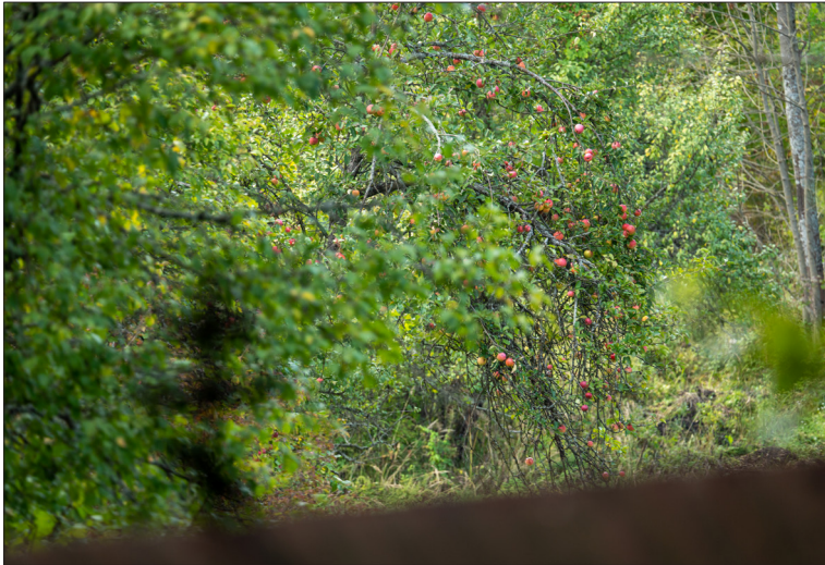
Fot. 22. Old apple trees on the grounds of the non-existent village of Dara (Slovakia)