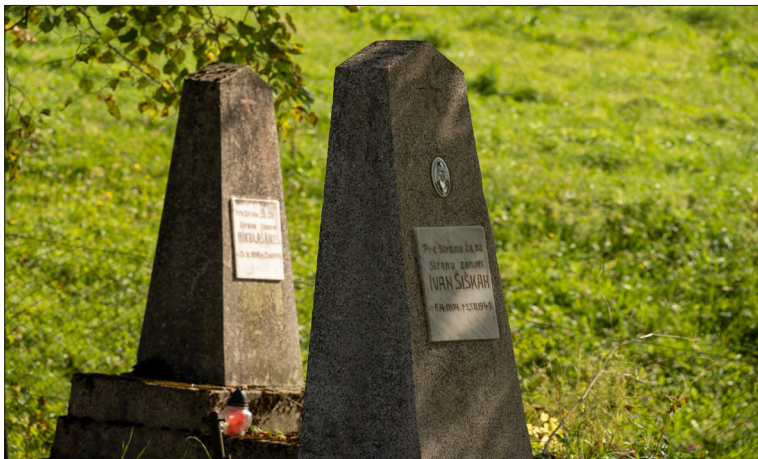
Fot. 14. Gravestones of young communists from the village of Nova Sedlica killed by partisans of the Ukrainian Insurgent Army in 1945 (Slovakia)