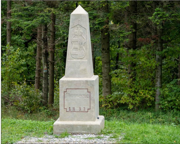
Fot. 1. A post from the border of Galicia and the Kingdom of Hungary on the Radoszycka Pass (Poland-Slovakia)