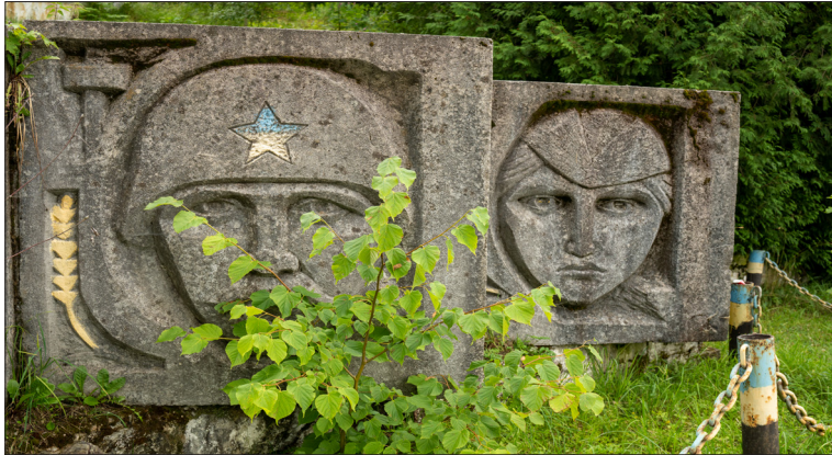
Fot. 13. Fragment of the commemoration from Turka associated with World War II placed in the Soviet era with an “adaptation” to modern times (Ukraine)