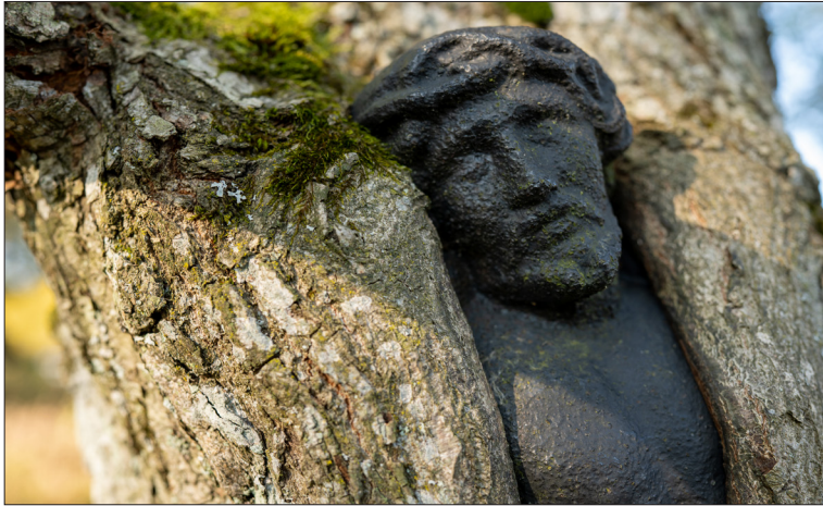
Fot. 21. Cast iron crucifix ingrown in a tree at the cemetery in Łupków (Poland)