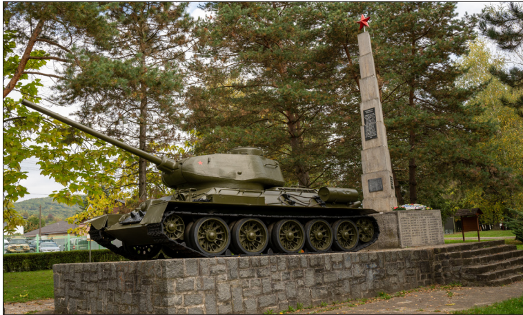
Fot. 15. A monument in memory of Soviet soldiers in the small town of Stakčín (Slovakia)