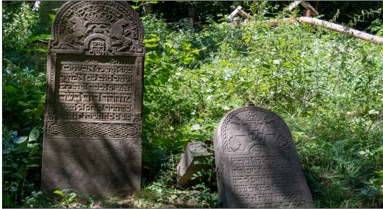
Fot. 9. Jewish cemetery in the village of Topoľa (Slovakia)