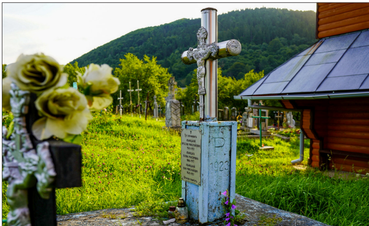
Fot. 6. An old post from the Polish-Czechoslovak border, now a part of a tombstone in the village of Verkhnie Husne (Ukraine)