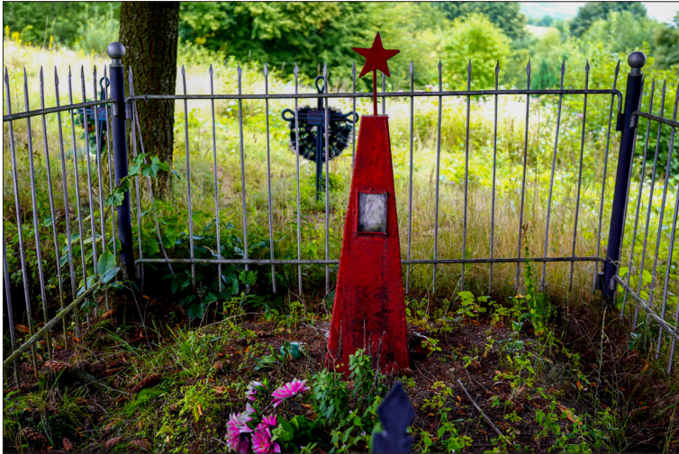
Fot. 23. The gravestone of a soldier – a victim of the war in Afghanistan, the village of Vyshka (Ukraine)