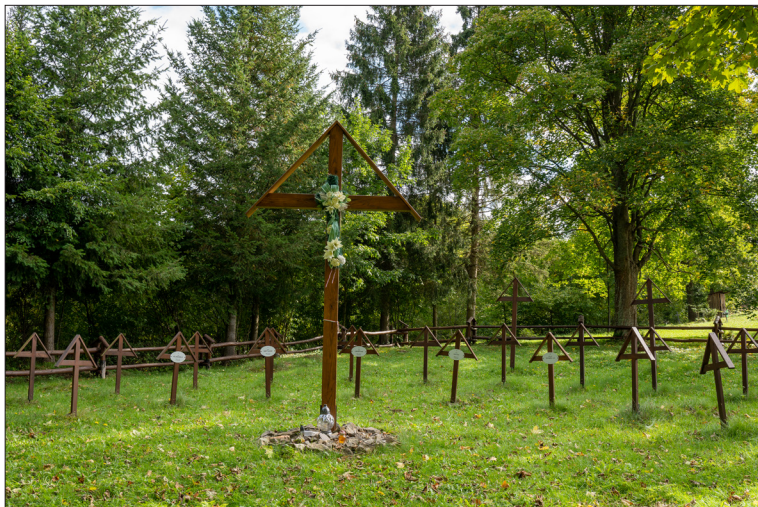
Fot. 4. Cemetery of World War I soldiers in the village of Topol'a (Slovakia)