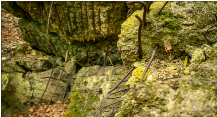
Fot. 10. Remains of fortifications of the Arpad Line in Zhornava (Ukraine)