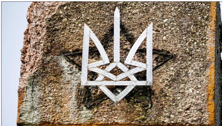
Fot. 12. Fragment of the commemoration from Verhnie Vysotske associated with World War II placed in the Soviet era with an “adaptation” to modern times (Ukraine)