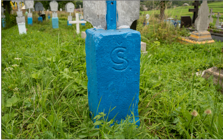
Fot. 7. An old post from the Polish-Czechoslovak border, now a part of a tombstone in the village of Lybokhora (Ukraine)