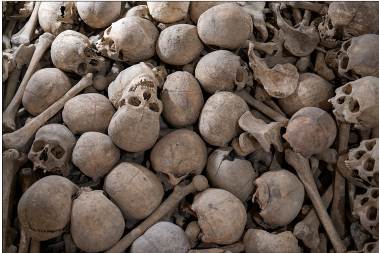
Fot. 3. Ossuary with skulls of World War I soldiers in the village of Osadne (Slovakia)