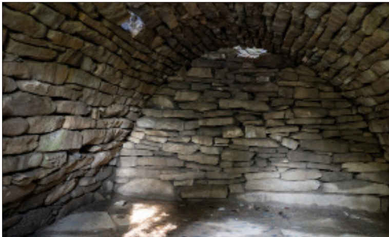
Fot. 18. Fragment of cellar remains in the non-existent village of Jaworzec (Poland)