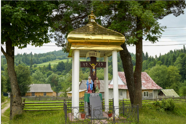
Fot. 5. Cross in memory of the victims of Talerhoff in the village of Karpatske (Ukraine)