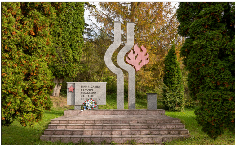
Fot. 16. A monument in memory of Soviet soldiers in the village of Vyšná Jablonka (Slovakia)