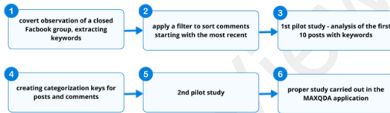
Figure 1. The process of downloading data from a Facebook group

Due to the vast amount of information available within the virtual group, the research team recognized the need to implement a systematic approach to data collection. To effectively manage the process and ensure comprehensive coverage, the team decided to divide the data collection into smaller stages. This approach allowed for focused and structured analysis, facilitating a more in-depth exploration of the research questions. By organizing the data collection process into stages, the researchers could effectively navigate the abundance of information within the virtual group and extract meaningful insights from the collected data.