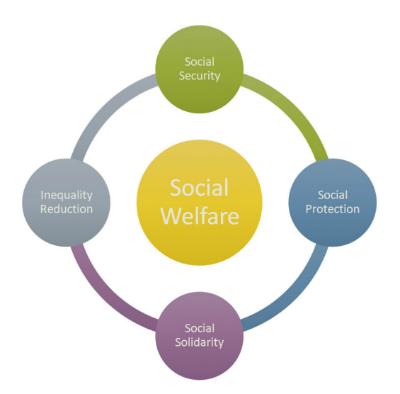
Figure 1: Basic prerequisites of social welfare

The welfare state is the sole provider of social welfare in the event of an emergency and the sole protector of the excluded. But, as has already been mentioned, it should offer much more than the minimum necessary to ensure social welfare. If it is of a residual nature, it does not address the coverage deficits, maintains inequalities, serves individual interests and does not distribute the burdens meritoriously (Titmuss, 1974). On the contrary, social welfare policies should permanently meet needs, address situations of disability, develop capabilities and skills, reduce inequality and liberate the individual from social risks. The focus of social policy is both individual and social, as it is a reproduction policy and is implemented through cash payments and services.