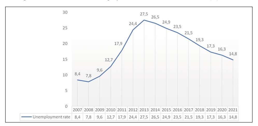
Figure 2: Evolution of the unemployment rate in Greece 2007–2021 (%)

shortcomings in coverage, these measures led to the reduction of unemployment (Figure 2) and in-work poverty (Figure 3) in Greece, even though there is still among the highest in the EU. However, this is a clear indication that social welfare policies could reduce social problems if implemented to address existing inefficiencies and shortcomings. At the same time, new social problems created by new technologies and teleworking, such as unpaid working hours, should be effectively addressed.