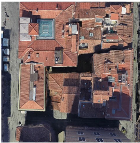
Piazzetta dei Tre Re