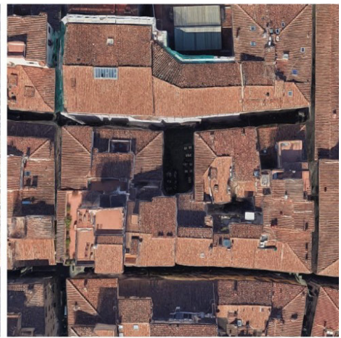
Piazza de' Cerchi