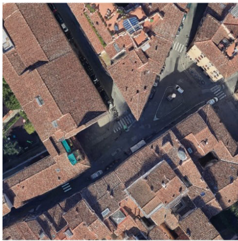
Piazza San Felice