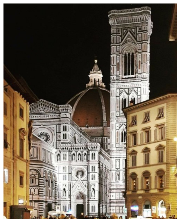
Ill. 3. Night view of the Piazza del Duomo: the monumental heritage as a theatrical scene of social life

short-term rental intermediary platform – the phenomenon has grown exponentially and spread throughout the city, beyond the historic centre, dramatically expanding the urban accommodation capacity. According to the Inside Airbnb website, in February 2023, there were 10,727 accommodations on Airbnb available in Florence, of which 8,052 were located in the historic centre. According to Celata and Romano's (2020) study, within the city's 2.3 km 2 area, 77% of the real-estate stock was allocated to short-term rentals in 2022. Consequently, the negative impact on the local community has increased. In addition to not having been guided by a tourism industry Management Plan until recently, the city has been subjected to a process in which its historical heritage sites are being sold to giants of the international economy, generally to become new tourist destinations. According to a survey and mapping carried out in 2020 by the architect Antonio Fiorentino as part of the activities