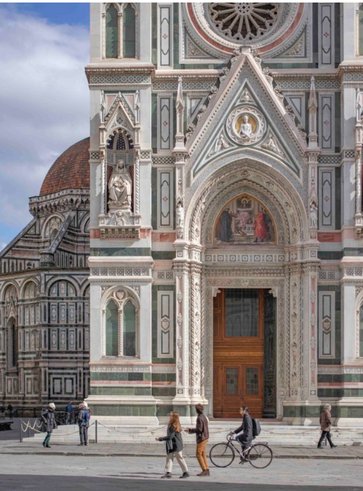
Ills. 4-7. The monumental areas of the Duomo Square and the Uffizi Square in the days right before the complete closure due to the pandemic.

As we have Historic European cities have developed with great attention to public space, including streets, squares and gardens, in response to specific communities' needs related to representation, social gathering