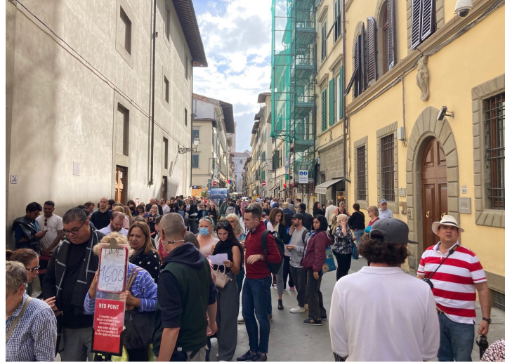
Ill. 2. The congestion in via Ricasoli mainly due to the crowd queuing to enter in the Galleria dell'Accademia (Photograph by Del Bianco, C. September 2022)

Following the pandemic, many residents moved to other urban or peri-urban areas, increasing the availability of real estate in Florence's historic centre for short-term rental. In Italy, the latter is still poorly regulated (Celata et al., 2020). Since the arrival of Airbnb in 2011 – the most influential