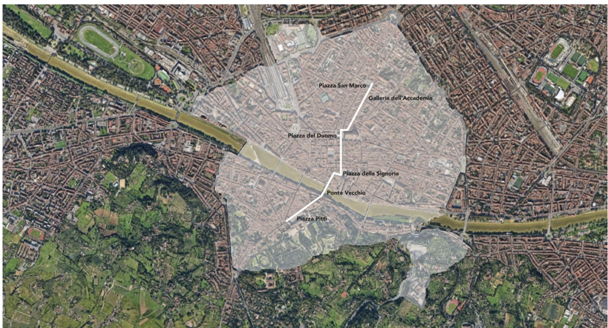
III. 1. Florence UNESCO World Heritage Site perimeter and main tourist axis.

The tourist is a figure that has changed considerably over the last few decades in terms of age, economic availability, ability to access information, and sharing of the travel experience. However, some things remain