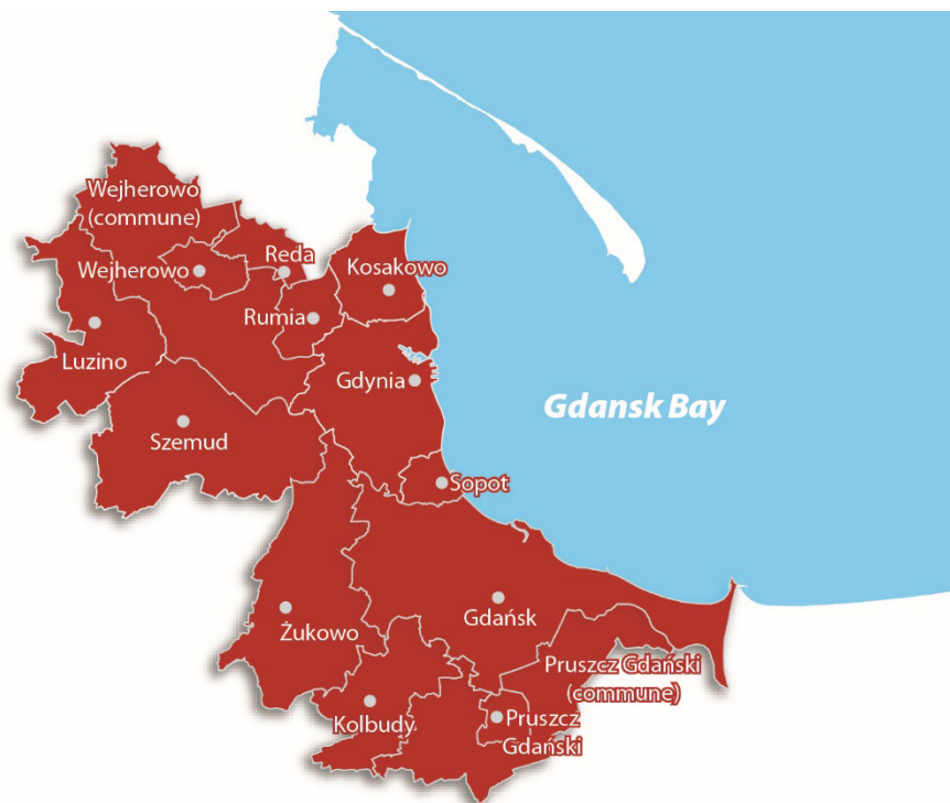
Fig. 1. Tri-City Metropolis.

Questions 1-4 relate to the research already carried out presented in the literature review. Their purpose is to confirm the conclusions of research carried out in other cities. Answers to questions 5-8 complete