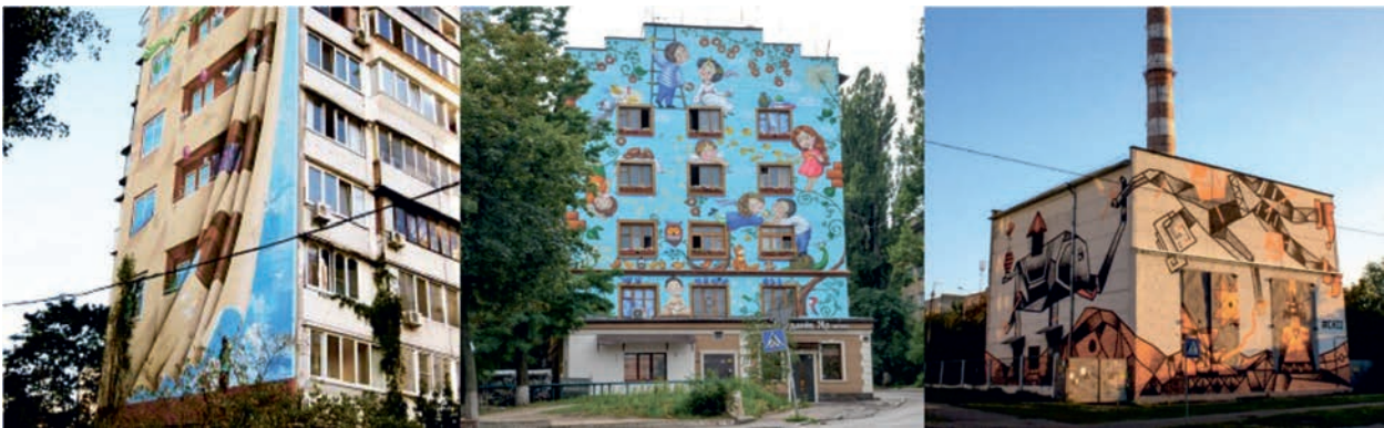
II. 9. Examples of solutions for buildings of different functional purposes: a – residential, https://my-obolon.kiev.ua/dostoprimechatelnosti/rekordnoe-po-razmeram-graffiti-na-fasade-doma.html b – public, https://lookmytrips.com/572a0d1aff936737a90738ab/mural-zdes-zhivet-liubov-ff9367 c – industrial, https://zefit.in.ua/murali-svyatoshinskogo-rajonu-kiyiv/ (access: 12.11.2021)