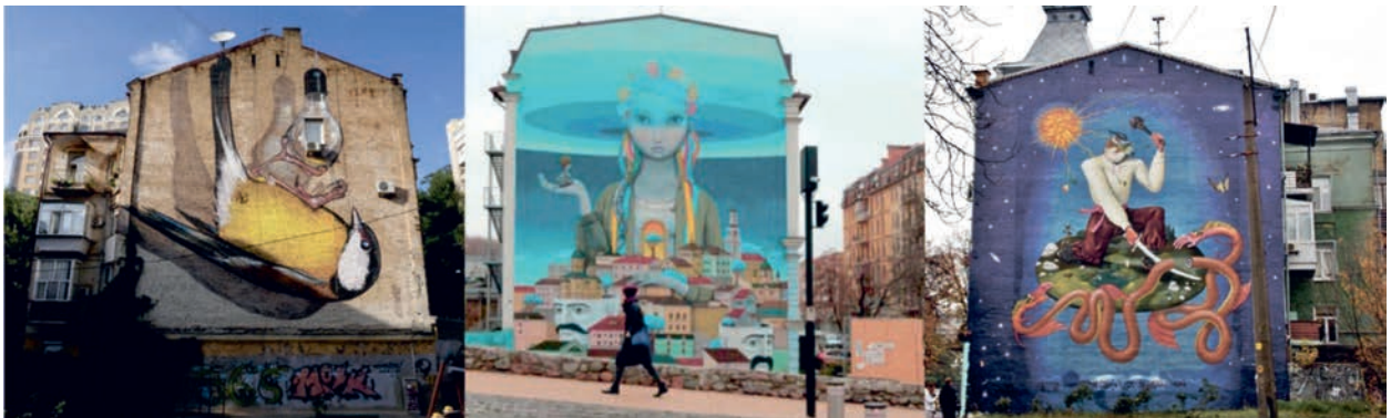
II. 2. Murals that are located in a historical environment: a – animalistic, https://chudokiev.com/interesnyie-mesta/muraly/mural-svoboda/ , b – fairy-tale-patriotic images, https://www.bbc.com/ukrainian/ukraine_in_russian/2015/12/151216_ru_s_mural_kyiv ; c – mythological creatures, http://www.hroniky.com/news/view/5645-naiaskravishi-muraly-kyieva-foto (access: 12.11.2021)