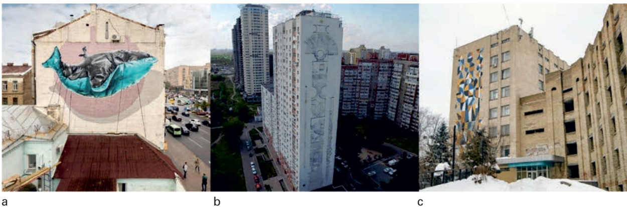
Il. 5. Murals that are subordinate to the environment: a – https://kievlast.com.ua/news/v-kieve-poyavilsya-mural-s-ischezayushhim-kashalotom-foto b – https://bykvu.com/ua/bukvy/30741-v-kieve-na-troeshchine-poyavilsya-odin-iz-samykh-vysokikh-muralov-v-mire/ c – https://www.44.ua/news/817743/na-fasade-kievskogo-doma-francuzskij-muralist-sozdal-lovkogo-celo (access: 12.11.2021)