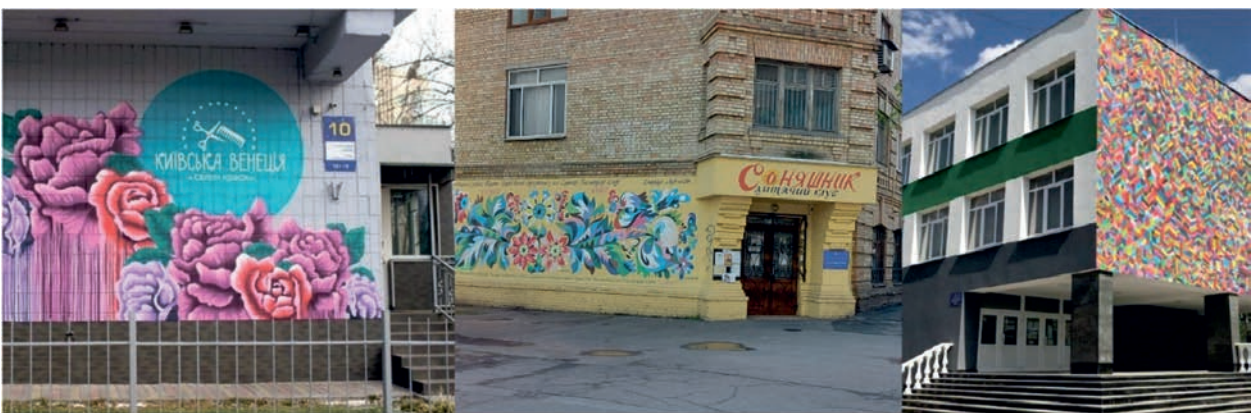
a b c

II. 11. Murals that do not take into account the architectonics of the buildings: a – https://kpi.ua/ru/ckm-mural b – https://zefit.in.ua/murali-pecherskogo-rajonu-kiyiv/ c – https://whattoseeinukraine.blogspot.com/2020/06/blog-post_28.html (access: 12.11.2021)