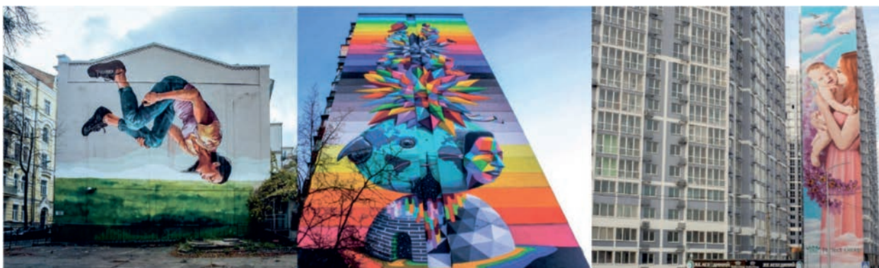
a b c