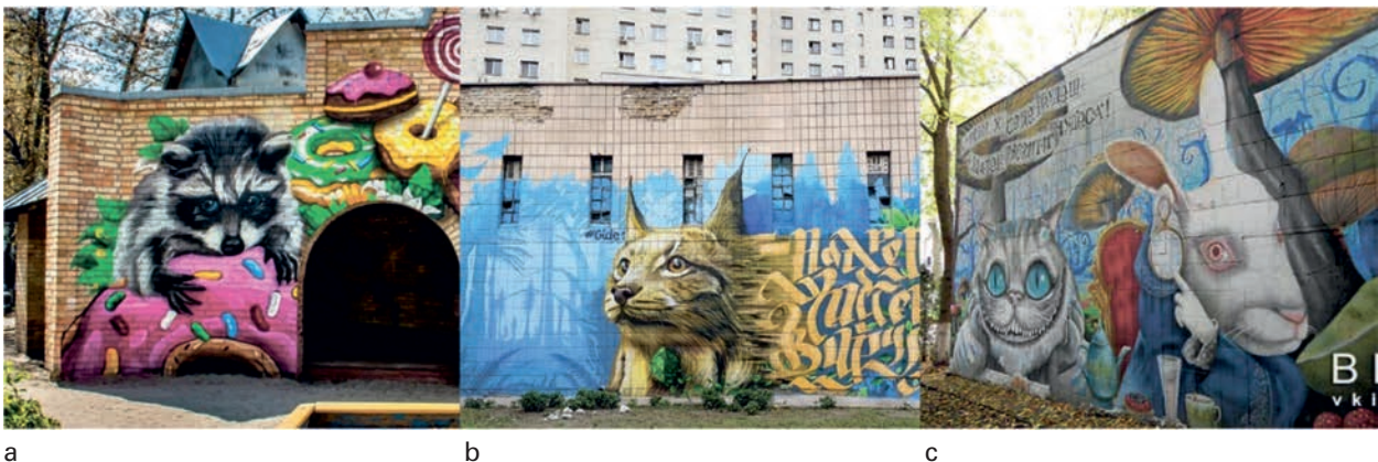
Il. 4. Murals that are located in a non-historical environment (in enclosed spaces of residential yards and playgrounds): a – https://nashkiev.ua/novosti/enot-i-ponchiki-na-oboloni-poyavilsya-ochen-millyi-strit-art-foto.html b – https://vechirniy.kyiv.ua/news/26839/ c – https://vkieve.net/street-art/mural-alisa-v-strane-chudes (access: 12.11.2021)

In both modern and historical buildings, you can find and distinguish interesting ensemble solutions – a combination of several vertical planes of buildings into one integral composition or several thematic images that are subject to the rhythm of architectural construction. The phenomenon of painting or so-called supergraphics of residential complexes in Kyiv appeared in 1983 in the residential area of Troieschyna to diversify the typical prefabricated construction. But such innovations were very difficult to perceive by Soviet architectural authorities, which hindered the further development of this area (Il. 7a)