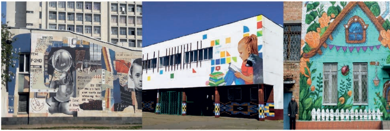
a b c Il. 13. Murals that do not take into account building's entrance group: a – https://kpi.ua/ru/1723-1 b – https://desn.kyivcity.gov.ua/gallery/2316.html c – https://m.day.kyiv.ua/uk/news/260319-u-kyievi-zyavyvsya-pershyy-mural-z-dopovnenoyu-realnistyu-foto (access: 12.11.2021)