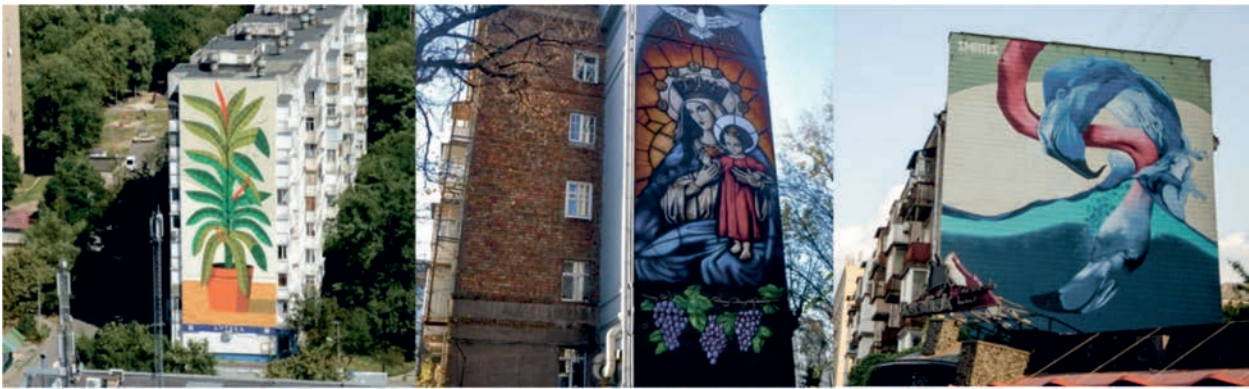
II. 8. Examples of individual solutions: a – https://www.bbc.com/ukrainian/multimedia/2016/10/161007_new_murals_kyiv_gallery_ag b – https://zefit.in.ua/murali-svyatoshinskogo-rajonu-kiyiv/ c – https://zefit.in.ua/murali-pecherskogo-rajonu-kiyiv/ (access: 12.11.2021)