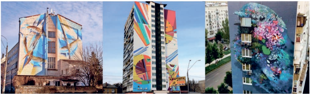
a b c

II. 10. Murals that take into account the architectonics of the building: a – https://zefit.in.ua/murali-shevchenkivskogo-rajonu-kiyiv/ b – https://zefit.in.ua/murali-svyatoshinskogo-rajonu-kiyiv/ c – https://dayting.com.ua/ru/muralyi-na-pecherske-v-gorode-kiev (access: 12.11.2021)