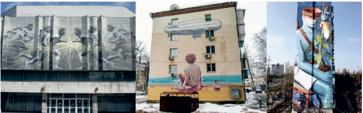
a b c

II. 10. Murals that take into account the architectonics of the building: a – https://zefit.in.ua/murali-shevchenkivskogo-rajonu-kiyiv/ b – https://zefit.in.ua/murali-svyatoshinskogo-rajonu-kiyiv/ c – https://dayting.com.ua/ru/muralyi-na-pecherske-v-gorode-kiev (access: 12.11.2021)