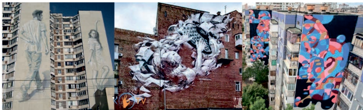
c d e