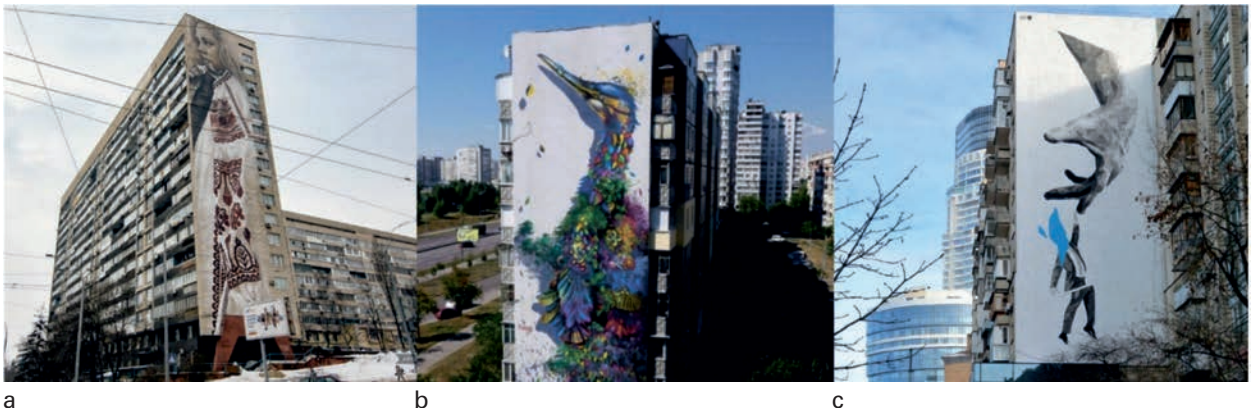
II. 3. Murals that are located in a non-historical environment: a – https://dayting.com.ua/ru/muralyi-na-pecherske-v-gorode-kiev/ ; b – https://kiev.zagranitsa.com/article/4022/15-samykh-krasivykh-muralov-kieva-kotorye-stoit-razyskat ; c – https://zeft.in.ua/murali-pecherskogo-rajonu-kiyiv (access: 12.11.2021)

The walls of old houses in the historic environment are decorated not only with portraits. Sometimes fairy-tale-patriotic compositions and animalistic images saturated with mythological creatures look spectacular and attractive (II. 2). It is worth noting that a significant amount of work in the historic center of the city was performed with maximum preservation of the authenticity of the surfaces of buildings.