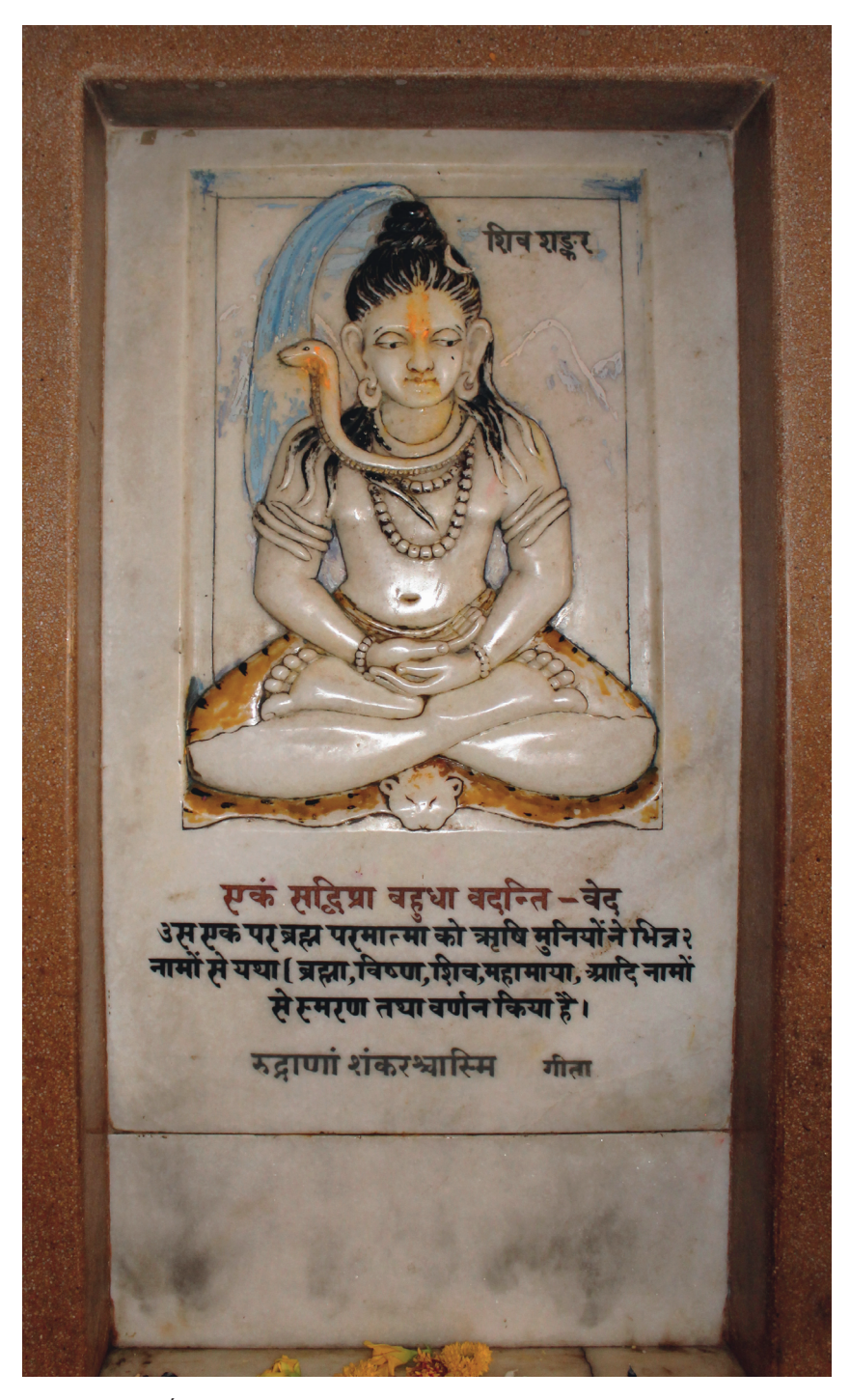
Fig. 2. The image of Śiva, Ram Mandir, Akola