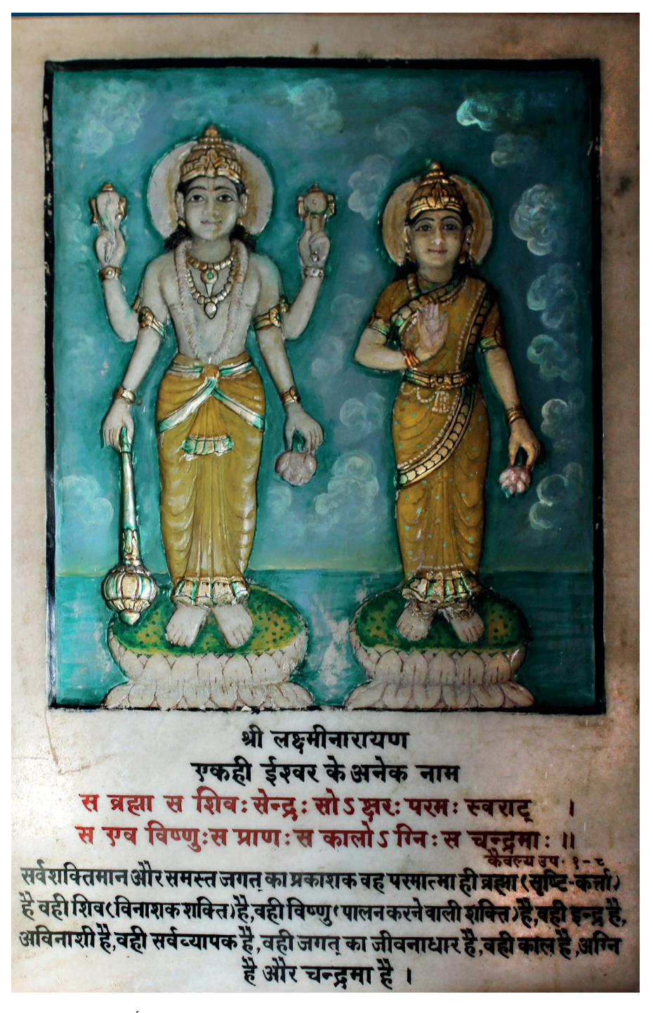
Fig. 5. The image of Śrī Lakṣmī and Nārāyaṇa, Sri Lakshmi Narayan Mandir, Bhopal