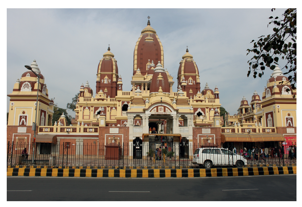
Fig. 1. Sri Lakshmi Narayan Mandir, New Delhi

single, once-established iconographic program,<sup>8</sup> and neither do they form a coherent series of scenes, characters, or stories alongside each other. The main sanctuary mostly contains an image of a deity to whom the temple is dedicated. There may be also subsidiary shrines with other sculptures. Panels are located on the walls of main halls, in ambulatories, vestibules, and side passages, or even outside.<sup>9</sup>