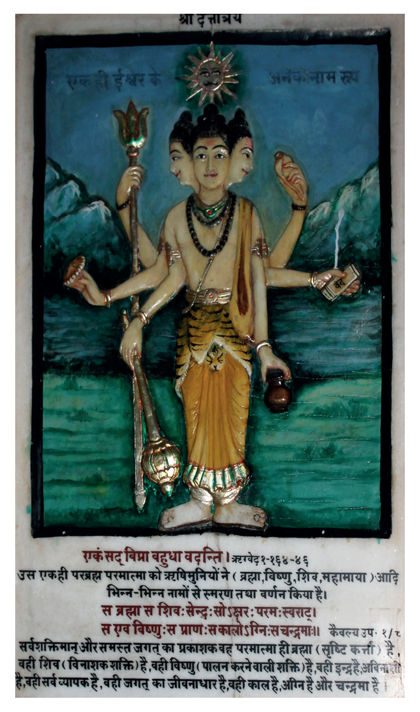
Fig. 4. The image of Dattātreya, Sri Lakshmi Narayan Mandir, Bhopal