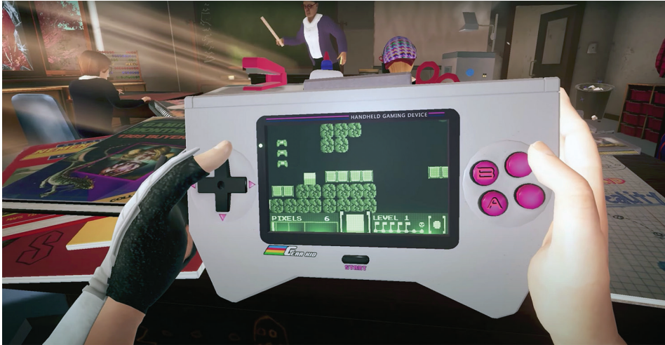
Fig. 4. Pixel Ripped 1989 48

this reason, I classify it as “official”, even though it comes from a small independent developer. The title, digital cover and the trailers do not leave any doubts as to that the game is filled with “concentrated nostalgia”. 47