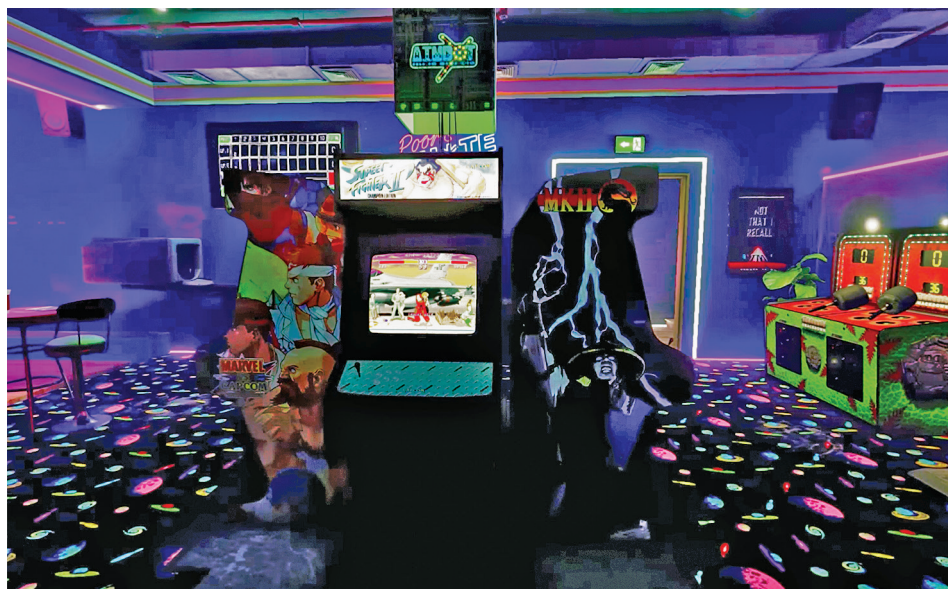
Fig. 5. New Retro Arcade: Neon 49