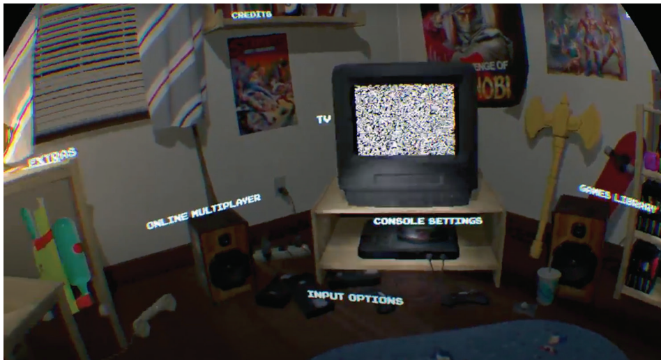
Fig. 2. Sega's Mega Drive & Genesis Classics Collection in VR 40

2018 Sega enhanced this collection with VR support. The application focuses mostly on the simulation of the original mode of exhibition of MegaDrive games as the only thing that the VR support adds is the recreation of a fully rendered 3D representation of the player's room. The room is not explorable but allows the player to turn their head, lean and duck. What is interesting from our point of view is that the way the interior is designed mimics a stereotypical American room of a Sega fan from the early 1990s. The space is full of recognizable objects of the past – It is a stereotypical kid's room consisting of a desk, a bed, a shelf with a vinyl player and a hi-fi set. Some VHS tapes are laying on the floor. The room is mostly decorated with generic objects, such as a landscape, some non-descript Sci-Fi postcards, and Sega merchandise: Sonic comic books, Sonic carpet, and a few MegaDrive posters. This is an expected result of the official status of the emulator suite as the company did not have an incentive to recreate objects associated with any other existing brands.