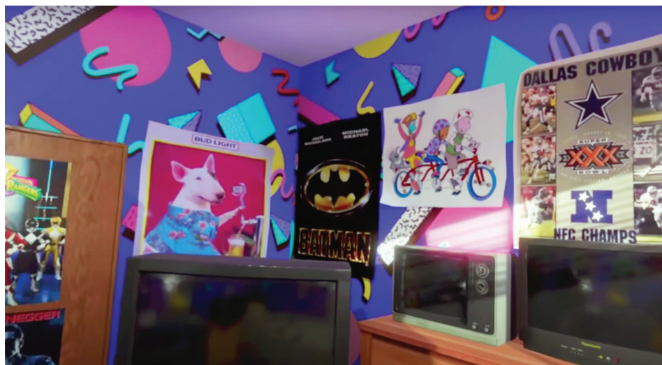
Fig. 6. EmuVR 50