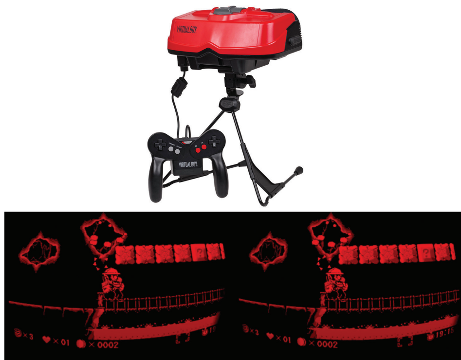
Fig. 1. Top: Virtual Boy 36 . Bottom: Virtual Boy game played in VBjin 37

Virtual Boy was a curious experiment released by Nintendo in 1995 and discontinued shortly thereafter in 1996. Even though it was marketed as a form of virtual reality, it can be classified as such only in a very broad sense of the term. In reality, it was simply a stereoscopic 3D console that was accessed by the players via a stationary headset that the users had to look into. Since the Virtual Boy did not employ any form of head or eye tracking, it was reminiscent of early virtual reality attempts such as Sensorama or kaiserpanoramas. The device's case blocked the external visual stimuli, creating a focused feeling of being alone with the game. This makes the mode of exhibition of Virtual Boy games quite special as there was no prototypical place or environment that was associated with them. They were played in a black void, so it was, in fact, the absence of the environment that was characteristic of the experience.