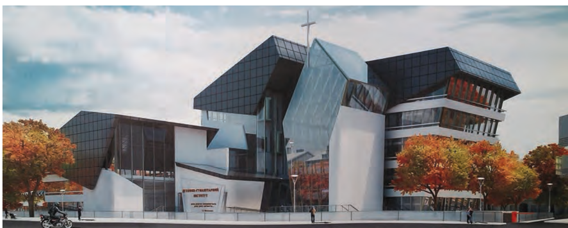
III. 5. Project of the Institute of socially-humanitarian sciences building at Lviv Polytechnic National University, designed by an architect R. Stotsko by the order of the management, 2017.