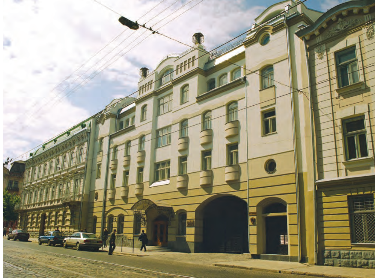
Ill. 14. The main facade of Lviv State University of Internal Affairs. Architect Yu. Dzhygil, built in 2001.