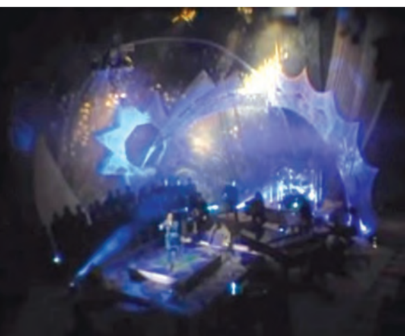
III. 2. Landscape-folk theatre in the museum skansen “Shevchenkivkyi Hay” in Lviv. Built in 1989, architect V. Proskuryakov.