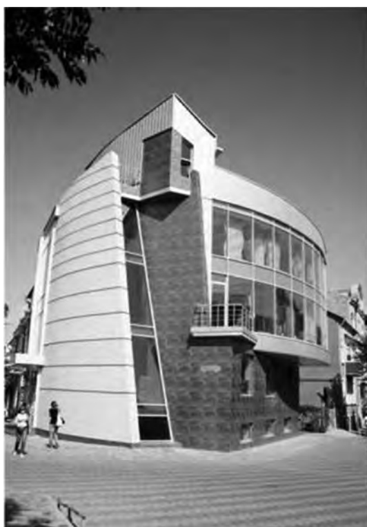
III. 6. Shopping centre "Dytiachyi Svit" (Children's World) in Sadova street in the city of Chernivtsi. Architect O. Kordunyan 2009.