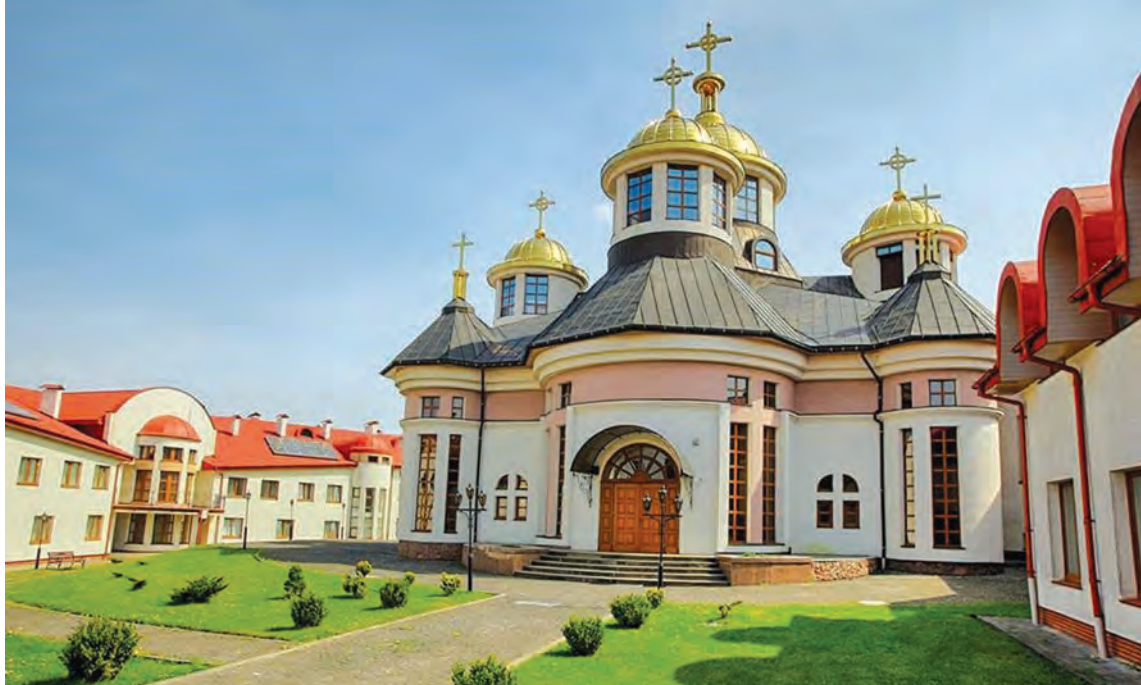
III. 4. The project of architecture of religious-educational institutions in Ukraine. Architect R. Stotsko. The complex of Lviv Theological seminary, 2008.