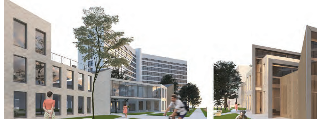
III. 10. The project of student's polyclinic-club "Zdorovya" ("Health") on the campus of Lviv Polytechnic National University. Architect O. Krasyl'nikov.

proposed before 2016 medical-prophylactic centres into new architectural types – polyclinic-club (III. 10, 11.), and the health club. Basing the research on the experience of designing the environment of university medical-recreational centres, in particular on Cannon Design, HMC Architects, Shepley Bulfinch, Ratcliff Architects, Duda Paine Architects in the USA and their own scientific research, the researching design of the health centres has also been started at the department of architectural environment design. They serve as healthcare complexes for students and have inter-university direction. Such projects have the peculiarity of being similar to global tendencies,