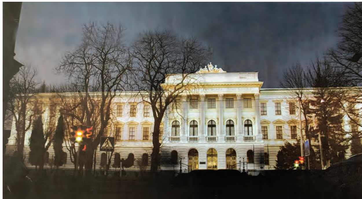
Ill. 15. Lighting of the main building of Lviv Polytechnic National University, architect M. Yatsiv, 2015.

Architectural needs of a young country on the current stage can be satisfied by architectural and research departments and, in particular, Lviv architecture school, as they are based on the leading research methods and conduct the researching design in a wide typological range. The activity of Yu.