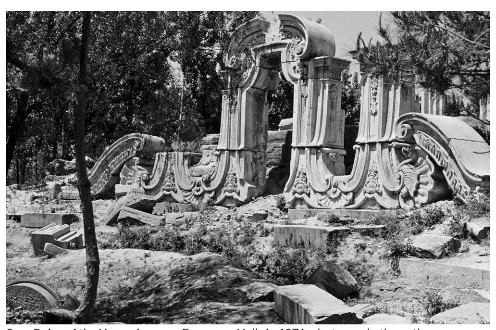
2. Ruins of the Yuanmingyuan European Halls in 1976