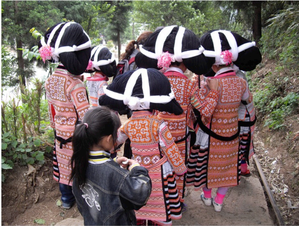
Fig. 5. Local girls modelling the clothing and headdress of the Longhorn Miao in Suoga Ecomuseum.