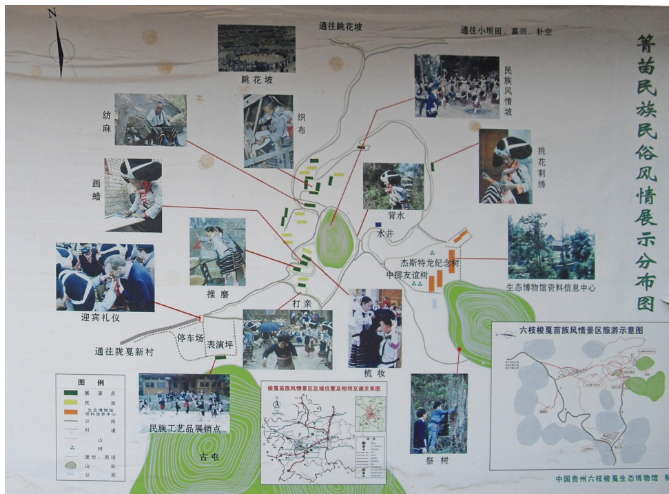
Fig. 4. Visitor map of Suoga Ecomuseum.