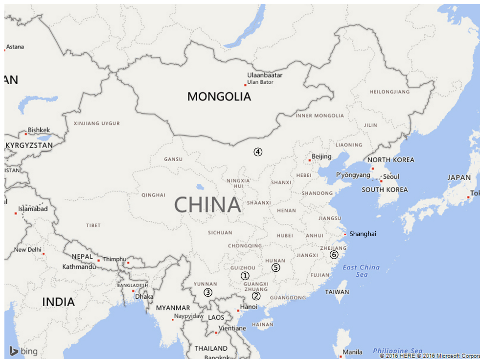
Fig. 1. Map of regions with established ecomuseums: