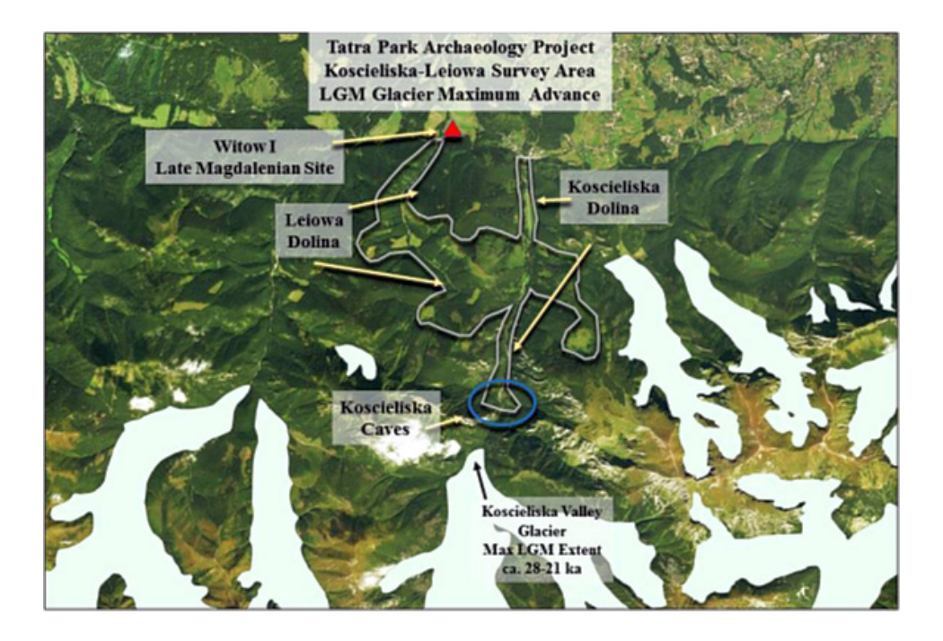
Fig. 2. GIS map of modeled Late Glacial Maximum Tatra Park valley glacier positions. Projected in ArcGIS™ 10.3 using from on-line GIS (source data layers from Zasadni, Kłapyta 2014)

past human population in lower elevation areas, some within 11 km of the park's northern boundary, made extensive use of caves for more than sixty millennia (cf., Szymaszek 2016), it is virtually impossible to assume that Tatra Park caves remained unused by prehistoric and historic people in the past. The present absence of knowledge about those past occupations is considered by the authors to more logically be due to the absence of past archaeological investigations which could detect them.