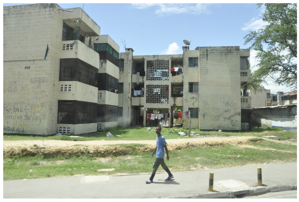
Fig. 7. Blocks of flats in the suburbs of Mombasa