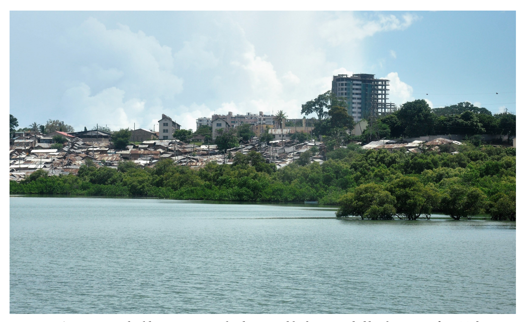
Fig. 6. Downtown buildings on Mwita Island: a tower block surrounded by slums, view from Tudor Creek.

while in others, such as Kenya, Ethiopia and Uganda, the rural population will still be in the majority. The urbanisation of Kenya has been progressing since colonial times, and currently centres around three regions: around the capital city of Nairobi in the western part of the country, along the railway line that connects Kenya with Uganda, and in the coastal zone, with Mombasa, Malindi and Lamu being the most populous [11, p. 8].