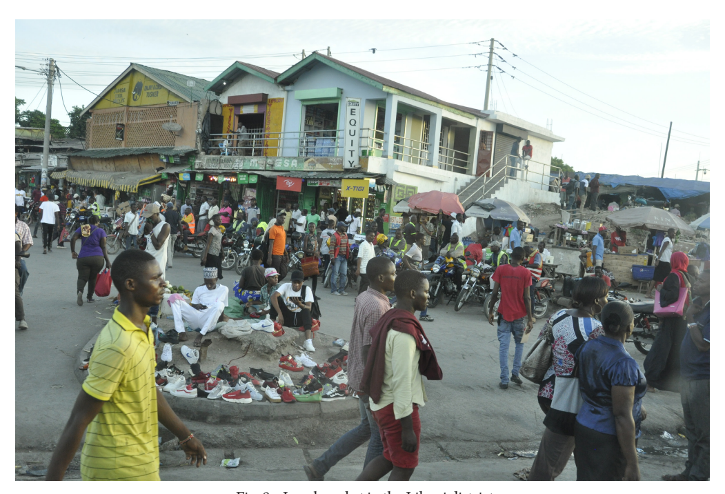
Fig. 8. Local market in the Likoni district