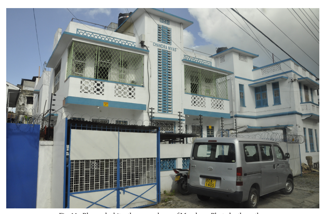
Fig. 11. Blue and white: the new colours of Mombasa.

Ecological thinking is already noticeable at the airport: you are not allowed to bring plastic bags into Kenya, so once you arrive products are packed either in newspaper or biodegradable bags. In 2018, the downtown dumpsite was closed down, and is now being reclaimed: soil is being brought in and vegetation planted. It is planned to turn it into a public park; however,