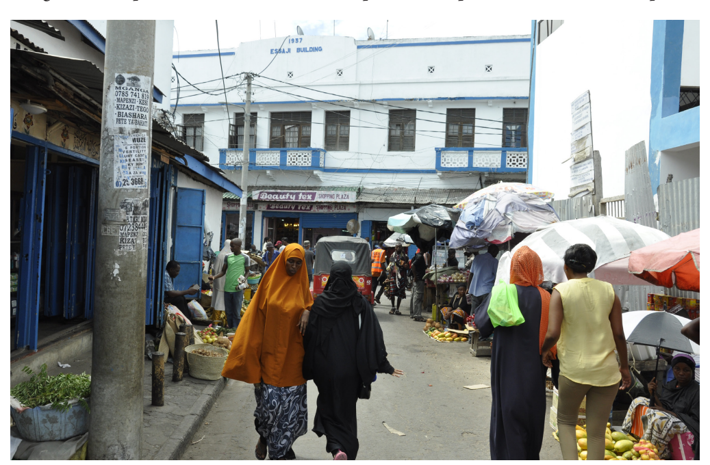
Fig. 10. Mombasa: a downtown street near the main city market

In their attempts to improve the aesthetics of Mombasa, the city authorities see two basic obstacles, the first being the non-regulated activity of local estate development companies, which erect tall office and residential buildings in the downtown part of the city. The architecture of such structures is based on global models, and as such they disrupt the atmosphere of the city and distort the traditional three-storey building scale. Secondly, the authorities acknowledge the squalid wharf area, whose potential is underutilised. The waterfront causeways, viewing areas, and public-access water is available only at certain points. Other reports mention the issue of bad management and the omnipresent corruption, and highlight those phenomena as significant impediments to the sustainable spatial development of Mombasa [11, p. 51].