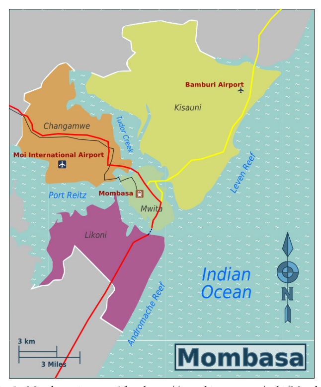
Fig. 5. Mombasa city map.

Although the downtown part of Mombasa is situated on an island, its contemporary section is not so densely built-up, the streets are wide, and there are several parks and green enclaves. However, the character is far from typical for an island, and one could say that the city is ugly and chaotic, turning its back on the sea. Both bays of the downtown island of Mwita are in fact industrialised and contaminated harbours, which is why there are no palm promenades or white sandy beaches, so typical of East African coasts. Still, the island's location proved valuable for the central part of Mombasa, as it naturally cuts off the circle of slums that penetrate the majority of African cities. Those in Mombasa, except for several downtown enclaves, do not begin until the southern side of the Reitz harbour bay, where the ferries connect the city centre with the suburbs scattered over the mainland.