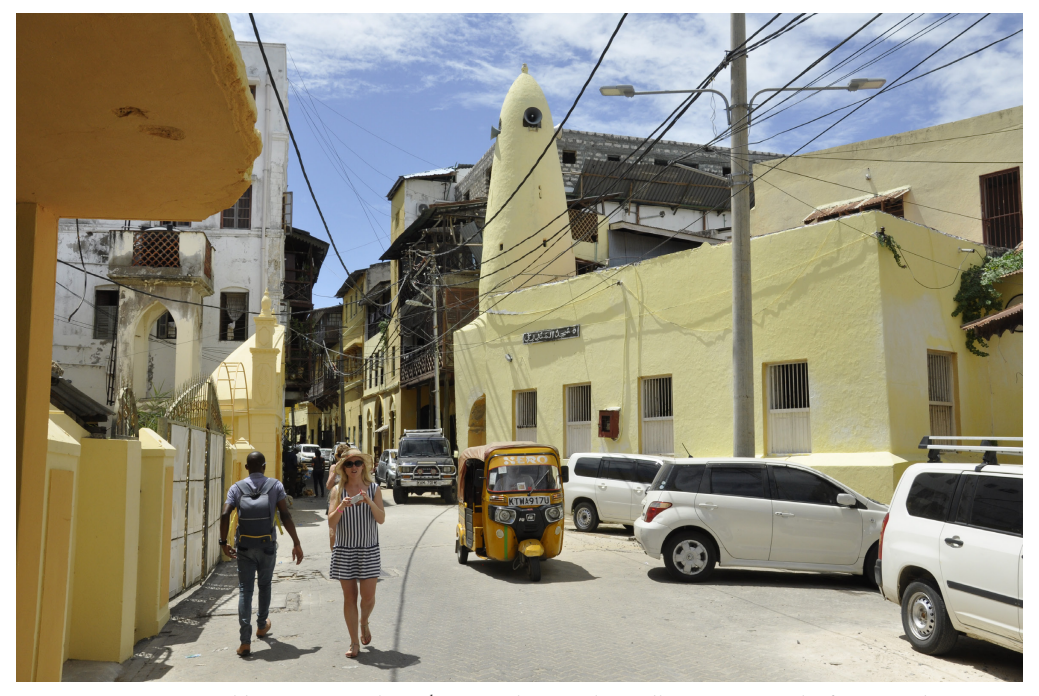
Fig. 3. An Old Town street, the 16^{th} century historical Mandhry Mosque in the foreground.

of house in the region, known as an Indian shopfront house – a two- or three-storey masonry building with a balcony and a shop on the ground floor. Erected side by side, such houses formed whole street frontages. Many of them have characteristic four-wing folding doors, known as Gujarati doors, which make it possible to open the establishment wide to the street. The compact rows of these houses brought a certain order to the mazes of narrow streets and dead ends of traditional African cities. They mostly form shopping streets in the old port districts, and are the rock of the local economy and a tremendously popular attraction for tourists [8, pp. 69–70].