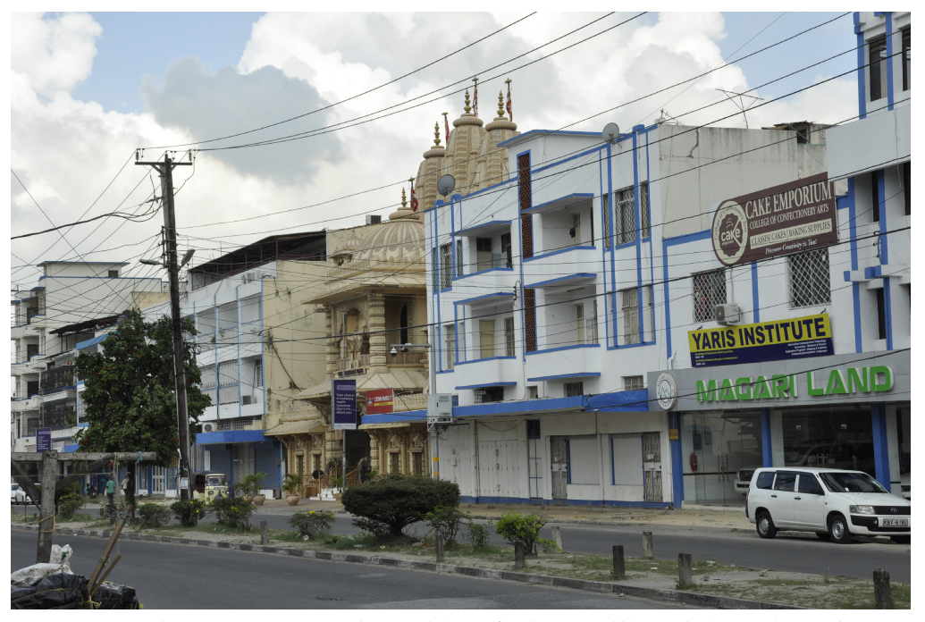
Fig. 4. A downtown street in Mombasa, with house façades painted blue and white, with a Hindu temple between them.

from the heat and rain but also allowed them to relax and enjoy social interactions. Another, later import to Mombasa consists of devastated and dirty blocks of flats, scattered along the main access roads into the downtown area.