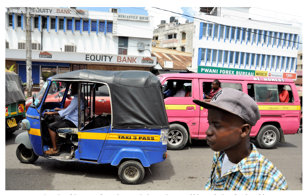
Fig. 1. The colourful streets of Mombasa, with the newly painted blue and white façades of downtown buildings in the background.

In my previous article, I described two well-known coastal cities: Miami Beach in the USA and Tel Aviv in Israel [4]. The manipulation of their original colours turned them from grey, dirty and squalid cities into global tourist attractions and fashionable style icons: pastel Miami Beach became the capital of American Art Deco, and white Tel Aviv a symbol of modernist architecture, as if straight from Bauhaus. With its downtown buildings painted blue and white, Mombasa, an African port city on the Indian Ocean, is now following in their footsteps.