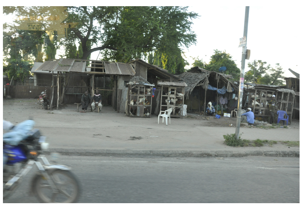
Fig. 9. Slums along the access roads into Mombasa - Likoni district

African cities could be the drivers of civilisation and economic progress, but they are a hotbed of social inequalities and an epicentre of urban poverty. Still, they offer more opportunities and chances than traditional agricultural areas, which is why they continue to attract people who hope for a better life.