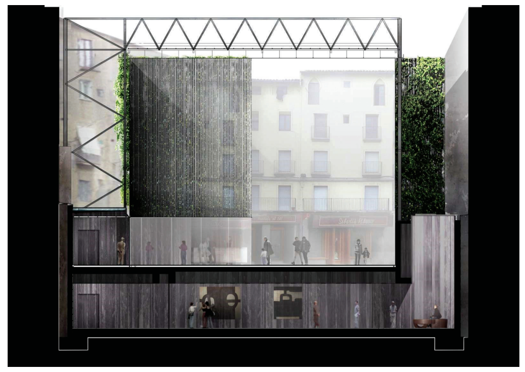
Fig. 6. Teatro La Lira, Ripoll, Spain, 2011, RCR Arquitectes (competition drawing)