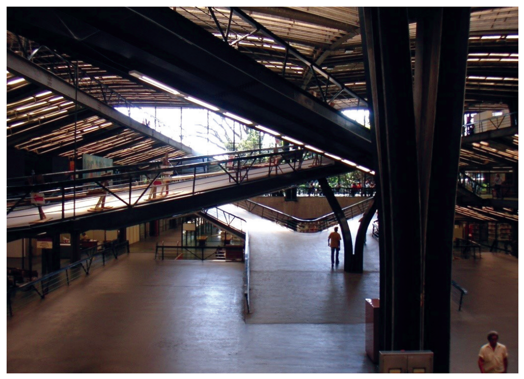
Fig. 4. Centro Cultural de São Paulo (CCSP), Eurico Prado Lopes and Luiz Benedito de Castro Telles, 1976