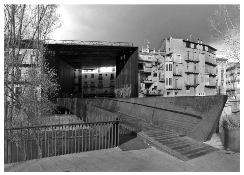
Fig. 5. Teatro La Lira, Ripoll, Spain, 2011, RCR Arquitectes