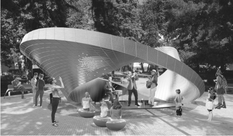
Fig.3. Example of a meme in the public urban space 'The Tape of Infinite Cognition' – author's project proposal