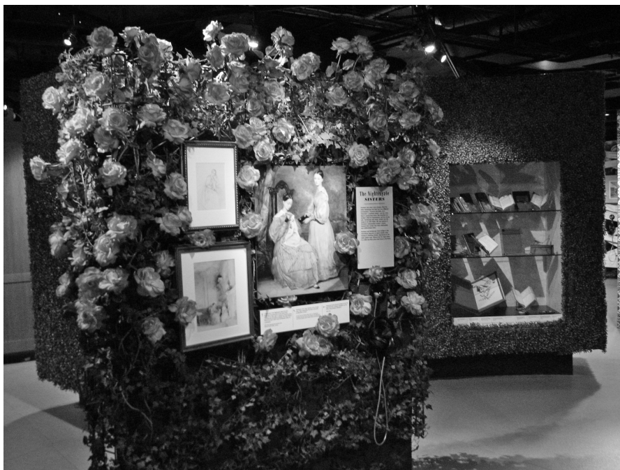
Fot. 4. A fragment of the exhibition The Golden Cage , Florence Nightingale Museum