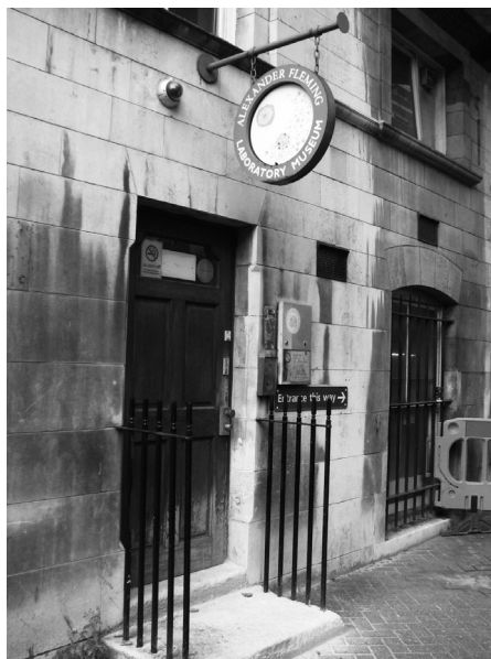
Fot. 1 The Alexander Fleming Laboratory Museum in St. Mary's Hospital

The Museum offers a journey back in time to the days when there were no antibiotics to fight often lethal bacteria and then follow in the footsteps of Alexander Fleming on his road to the discovery that was to revolutionize medicine and affect the lives of every one of us. Alexander Fleming Laboratory Museum shows that the discovery of penicillin was perhaps one of the most significant events of the twentieth century and why it continues to play a vital part in the ever continuing fight against bacteria and disease.