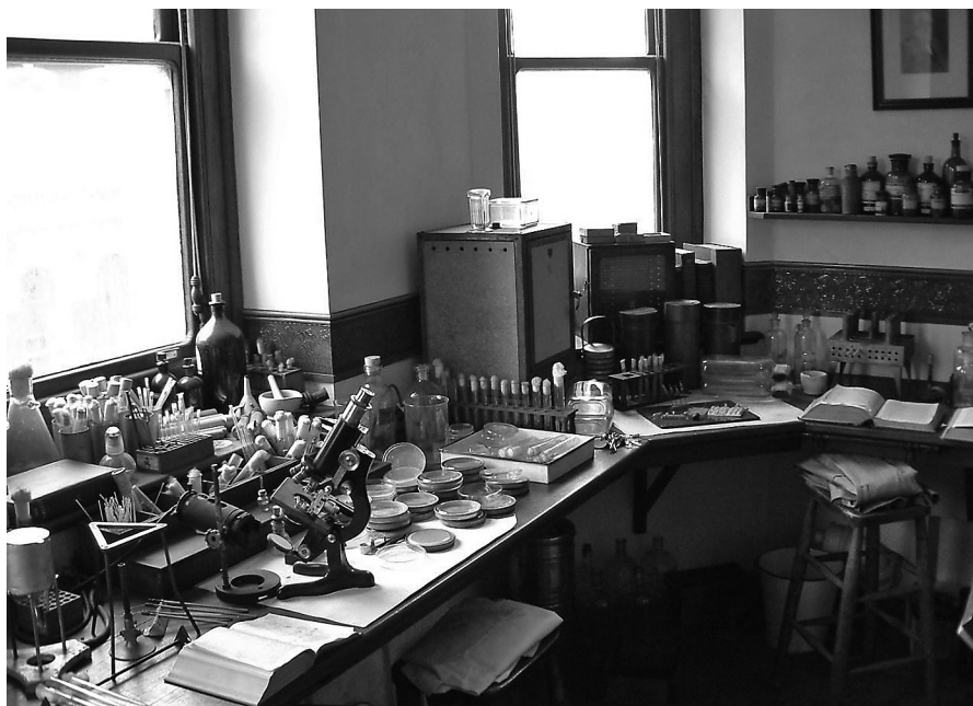
Fot. 2. The Alexander Fleming Laboratory Museum