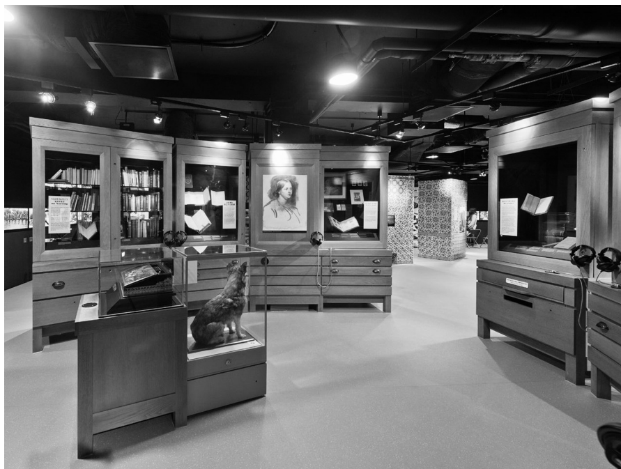
Fot. 6. Part of the exhibition Returning from War , Florence Nightingale Museum