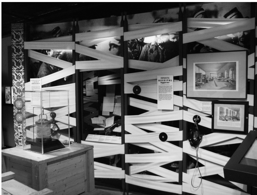
Fot. 5. A fragment of the exhibition The Calling , Florence Nightingale Museum