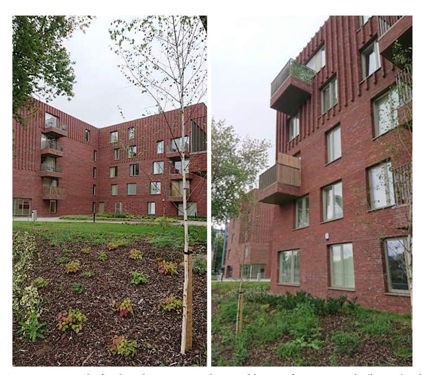
Fig. 25. Contemporary multi-family architecture in Hulme. Visible care of maintaining the 'human' scale. Brick used in the facades as a finishing material characteristic for the district