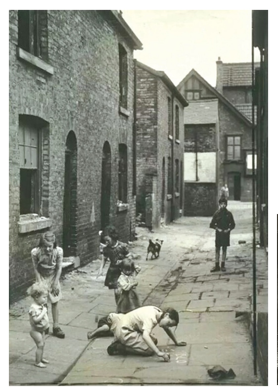
Fig. 3. A street in Hulme, early 20^{th} century