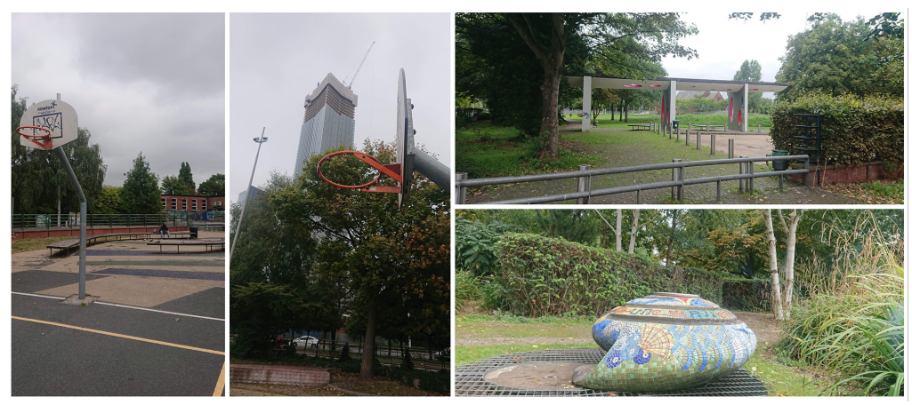
Fig. 26. Hulme Park – recreational green area in the district. Despite a certain degree of degradation and neglect, the care for interesting street furniture elements is well visible

The comparison of two action plans in Hulme demonstrates an advantage of a comprehensive approach to the regeneration plan developed, of the ability to overcome discipline-related limits, offering potential explanations for essential problems, which for a long time have been nagging experts and bureaucrats perceiving them only fragmentarily.