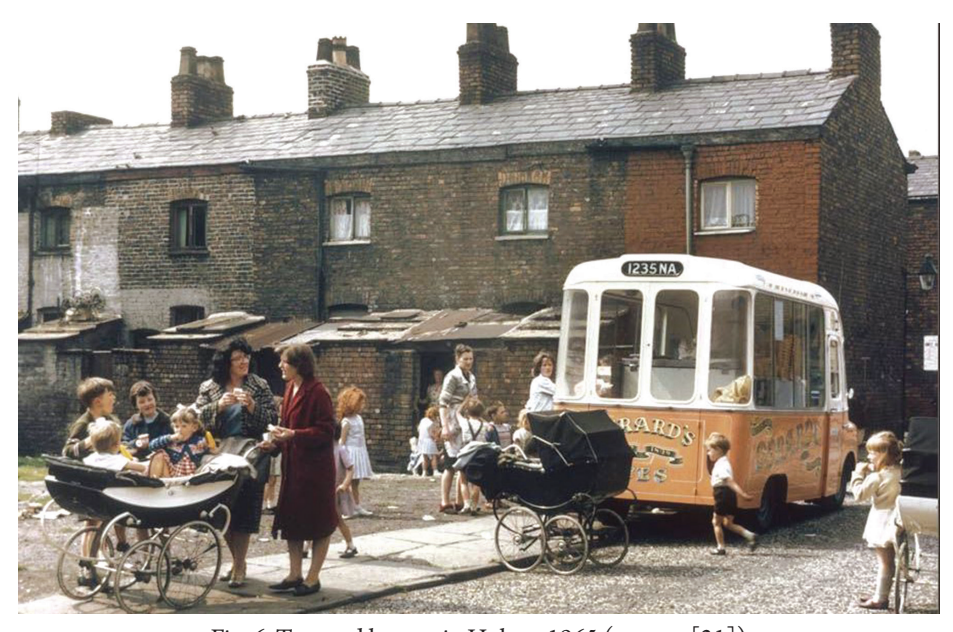
Fig. 6. Terraced houses in Hulme, 1965