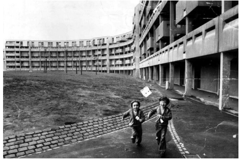
Fig. 9. Hulme, the space between the buildings of Crescent Blocks (source [24])