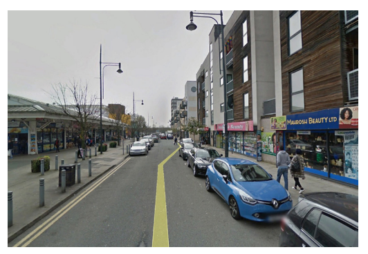
Fig. 16. High Street – a part of the southern commercial part of Hulme