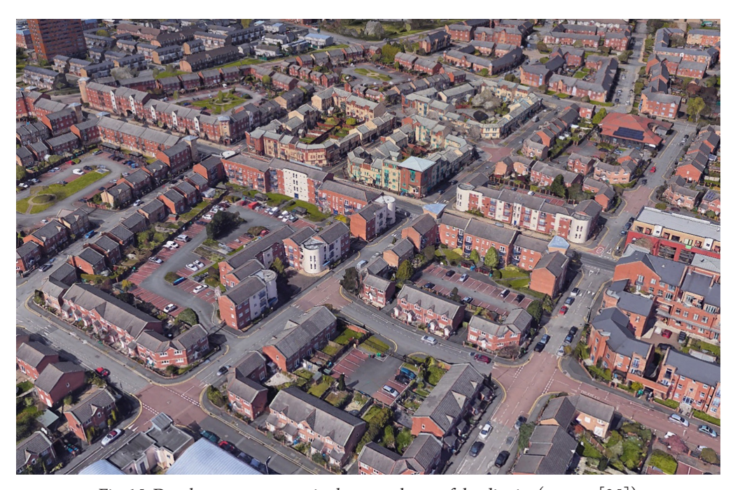
Fig. 15. Development quarters in the central part of the district (source: [25])