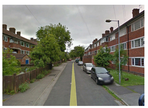
Fig. 17. Hulme, Hunmaby Ave – an urban interior of the street between residential development quarters (source: [25])