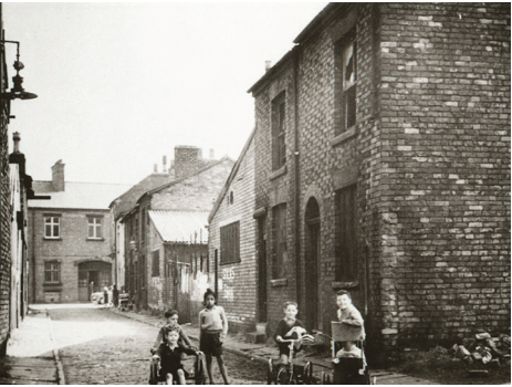
Fig. 5. A street in Hulme 1956 (source: [20])