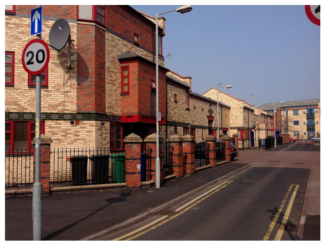
Fig. 18. Contemporary residential architecture in Hulme (source: [27])

Over the last 10 years several architecturally interesting investments were implemented in the district. The most significant of them is Birley Fields Campus Manchester Metropolitan University. The main building of the campus, Brooks Building, was erected at Bonsall Street. The university edifice is one of the most advanced facilities of the type in the United Kingdom. The entire complex comprises also student dormitories, the Energy Centre, and a multi-level car park.