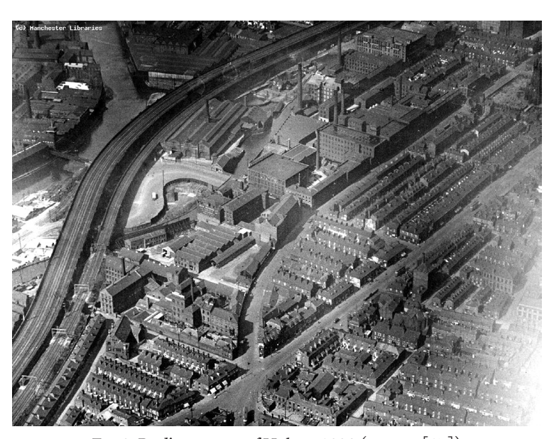
Fig. 2. Bird's eye view of Hulme, 1930