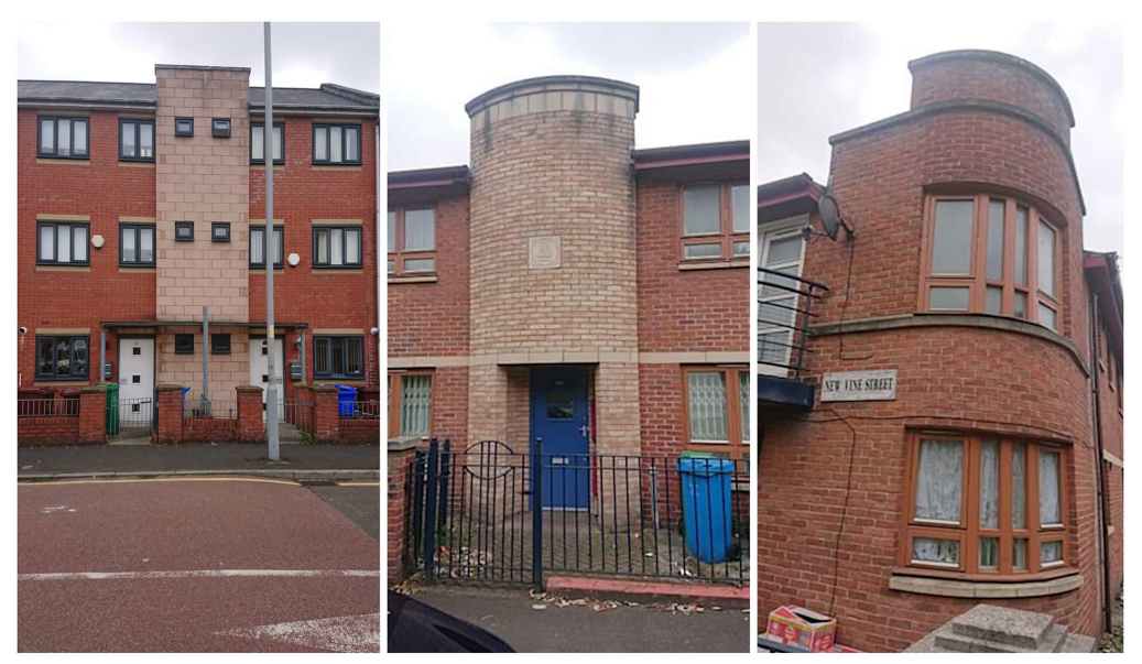
Fig. 24. Example of designing facades of residential buildings. Visible individual features of buildings emphasising the composition of the urban interior: emphasis of the entrance zone, the corner, a detail in the form of a relief