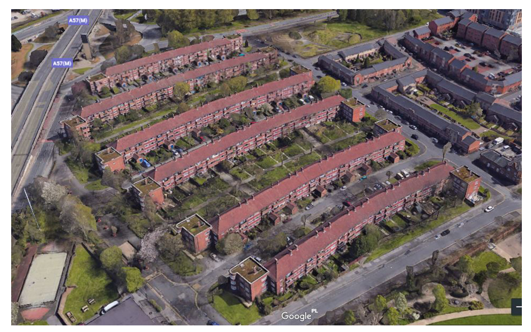
Fig. 14. Residential development quarter in the north-western part of the district (source: [25])