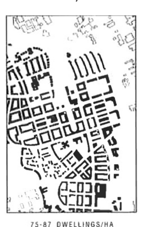
Fig. 11. Stages of the urban transformation of Hulme. To the left – development from the 19^{th}/20^{th} century, in the centre - development from the 1960s, to the right – the quarter development proposed in the 1990s. (source: [10, p. 16])