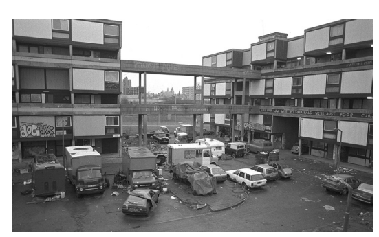
Fig. 8. Architecture of Hulme – project of multilevel, gallery passages between the buildings (source: [23])