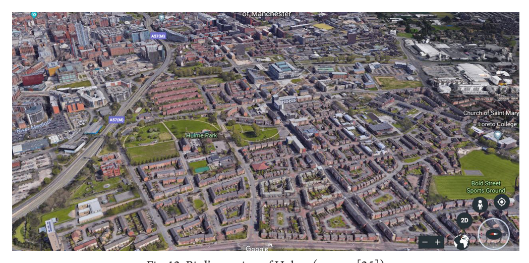
Fig. 12. Bird's eye view of Hulme (source: [25])