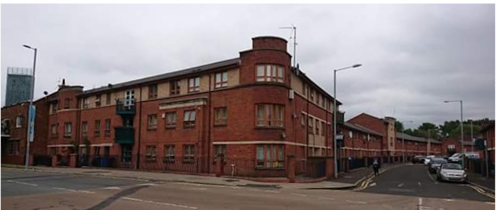
Fig. 23. Urban interior of a residential street of a part of Hulme and a view of a backyard inside the quarter. Visible regional, characteristic for Manchester character of development, the 'human' scale of development, and proportions of the street interior

The Manchester Evening News characterises this district in the following way: "it is a residential district, popular among students, young professionals, and families. It is a place with a flourishing artistic scene and creative people. The newly erected theatre centre Z Arts at Stretford Road, the renovation of the old hippodrome, and the extension of the Community Garden Centre – all this charges us with positive energy" [14].