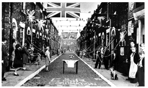
Fig. 4. Celebrations in honour of the coronation of Queen Elisabeth in a street in Hulme, 1953 (source: [19])