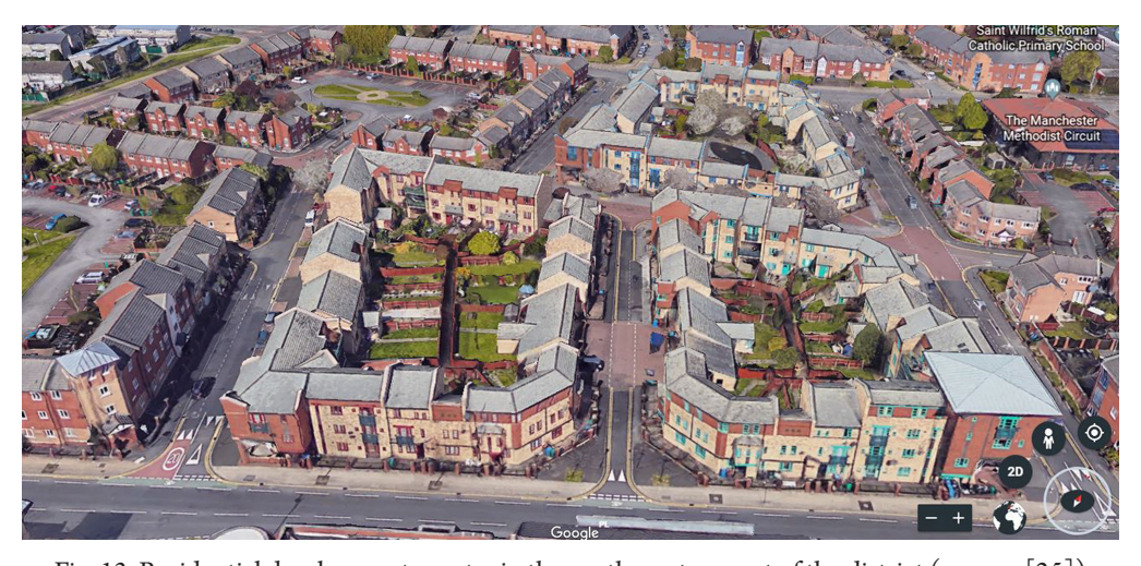
Fig. 13. Residential development quarter in the north-western part of the district

Although the level of poverty improved when compared with other areas of Manchester, it is still high against the background of the rest of the country. The reports from 2002 and 2006 mention also the issue of the still high level of crime in Hulme, especially a big number of petty thefts and car thefts.