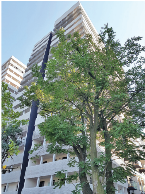
Fig. 5. ATAL Towers – Part II – residential towers, view from the pedestrian promenade