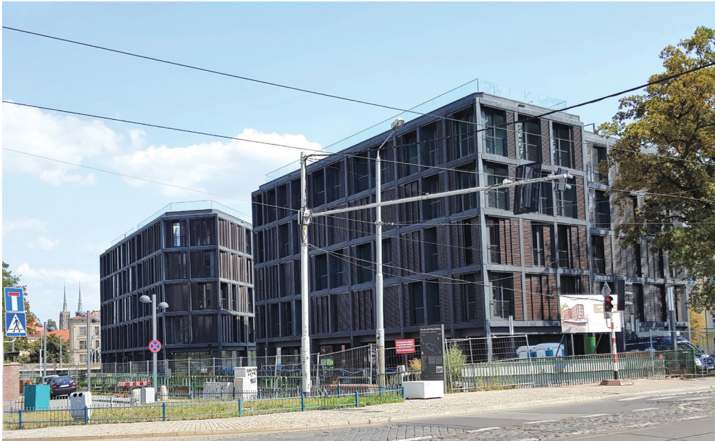
Fig. 8. Marina III – view from Księcia Józefa Street

An earlier project in the immediate vicinity of Marina III is the cameral, three-storey building with a gabled roof and distinct, two-storey oriels – the Marina I. It is a building that can also be presented as a successful project on a good scale, which also constitutes a contemporary interpretation of tradition. The building, with a residential function, offers services on the ground floor – restaurants, a coffee shop and a gallery. The public function, in combination with an accessible public space – the restaurant garden, with a jetty for yachts nearby – creates a good atmosphere of the place [3].