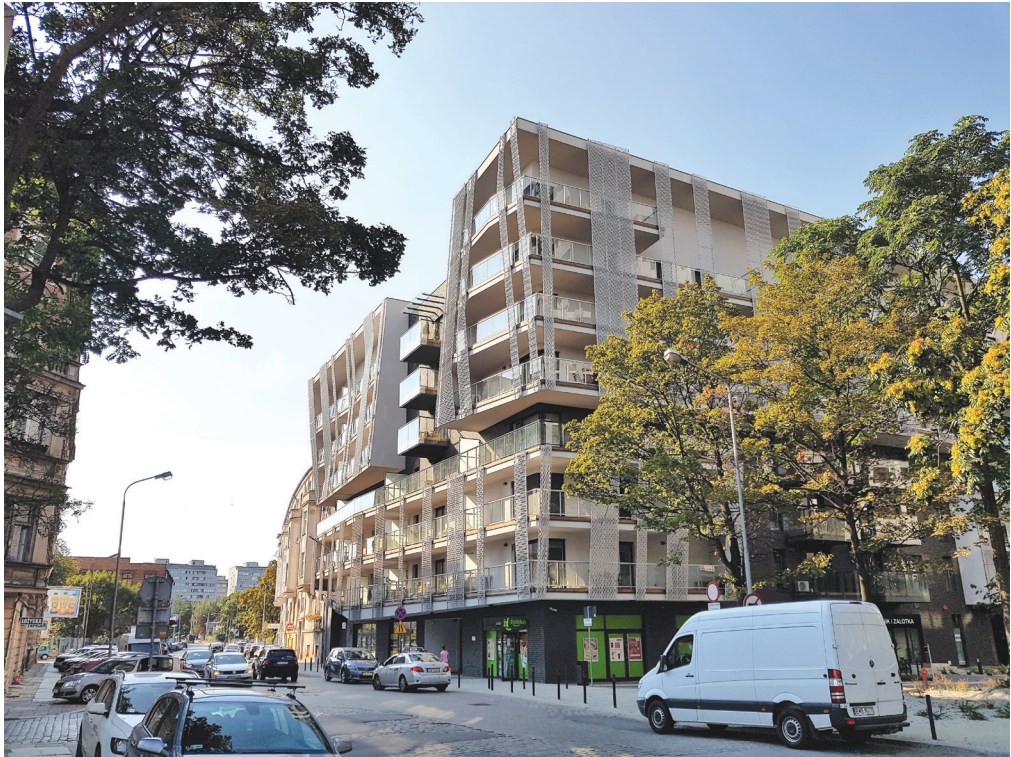
Fig. 1. ATAL Towers – Part I – eight-storey buildings, view towards the west from Generała Sikorskiego Street

the exit point from the Generała Sikorskiego Bridge – does not, however, introduce any new values into the cultural landscape.