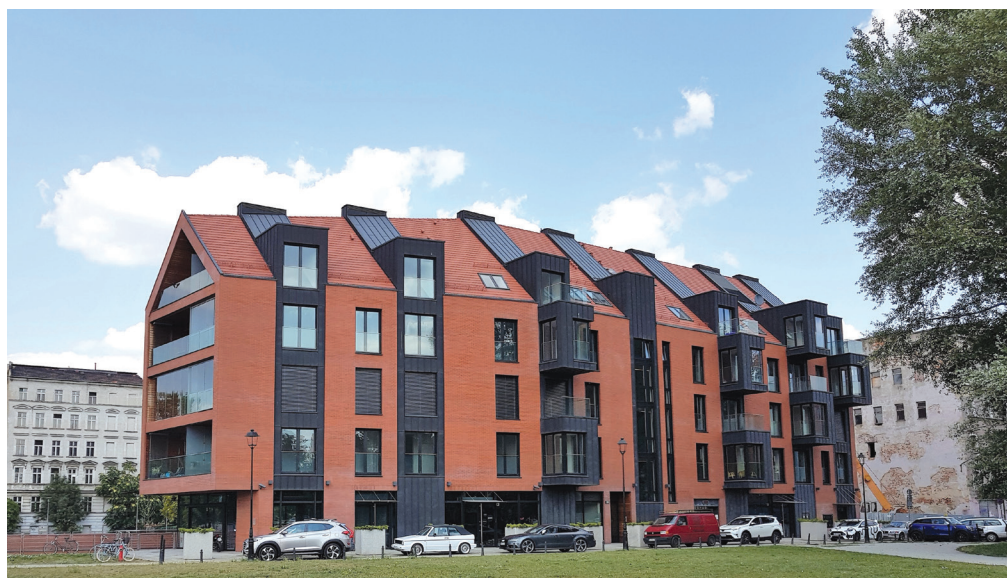
Fig. 7. Rezydencja Piasek – view from the south