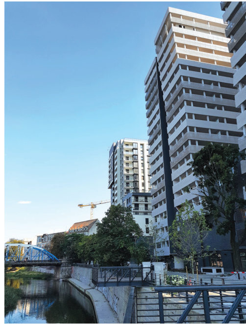
Fig. 6. Pedestrian promenade above the Oder River – ATAL Towers, with the Odra Tower in the background, at Podwale/Generała Sikorskiego streets, as well as Sikorskiego Bridge