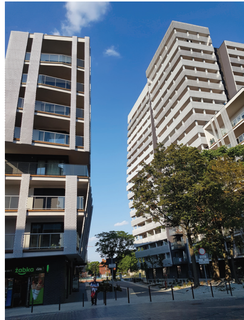
Fig. 3. ATAL Towers – pedestrian zone at Sokolnicza street between Parts I and II of ATAL Towers, view from Generała Sikorskiego Street