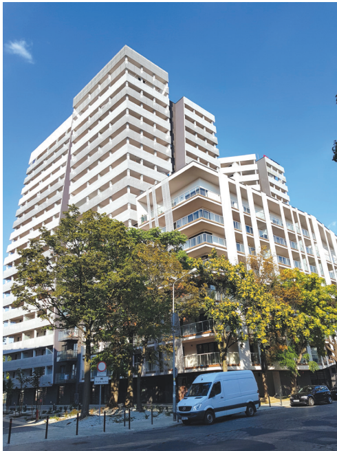
Fig. 2. ATAL Towers – Part II – eighteen-storey towers with a lower, eight-storey base, view towards the east from Generała Sikorskiego Street

From the side of the river a pedestrian promenade was created – attractively arranged, conducive to rest and recreation, with both low-lying and tall greenery, street furniture and