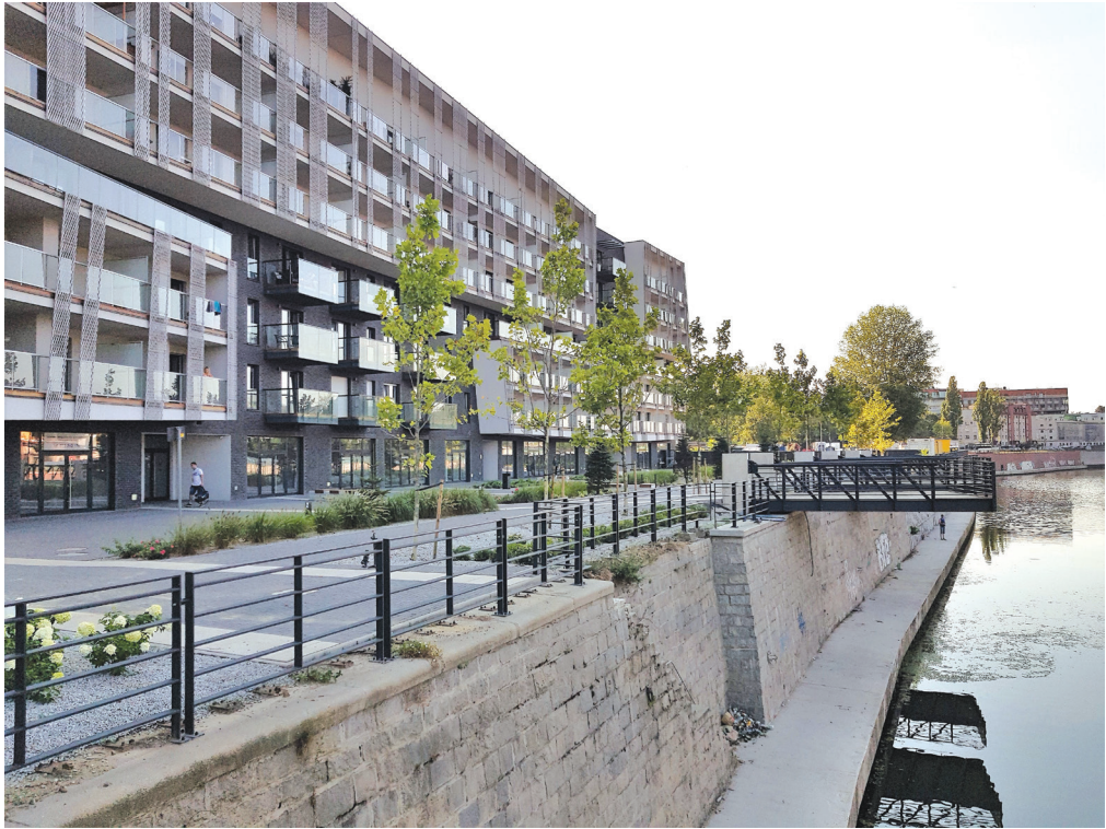
Fig. 4. ATAL Towers – Part I – view of the frontage of Oder River’s riverfront with a pedestrian promenade above the river

five terraces over the Oder River supported by cantilevers. This project enriches the entire layout, introducing a contemporary, attractive atmosphere of architectural forms. The ATAL Towers complex meets the conditions outlined in the local detailed plan in terms of the principles of shaping space and the size of the buildings – by creatively adapting them (Fig. 1–6).