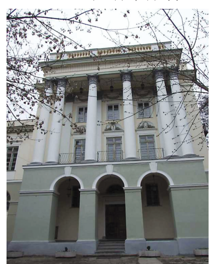
III. 1. Polish folk theater in Lviv a) facade; a) the plan; b) cut [23]

History of Polish theatre in Volhynia was researched by Ja. Komorowski, S. Kucherepa, A. Bar, in Kamianets-Podilsky by S. Komorowski, in Zhytomyr by S. Komorowski [15-17;1]. Zhytomyr Regional Philharmonic, founded in 1938, is one of interesting theatre buildings which would favour spreading of Polish theatric art (pic. 2). Philharmonic building is situated at 26, Pushkinska str. in a city of Zhytomyr, built in 1858, designed by the project of a famous architect I. Shtrom was originally a theatre building. Style - neo-baroque. Initiator of its construction and first director was a Polish writer-humanist, publisher, historian, philosopher Jozef Ignacy Kraszewski (1812-1887). In 1966 a new building was con-