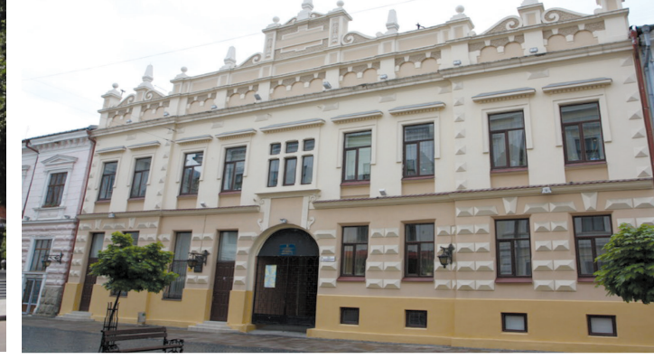
III. 2. Zhytomyr Regional Philharmonic named after S. Richter [16]