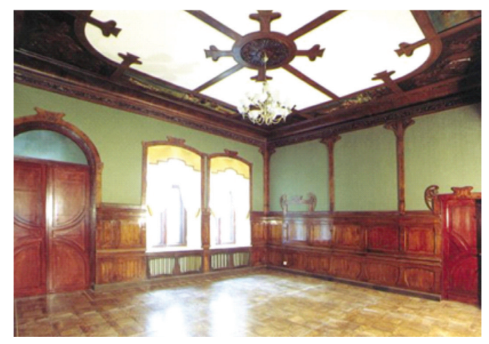
III. 5. General view of the 'English office' after the restoration.

restored premises. In total, according to individual drawings, 66 chandeliers and lamp-brackets (15 chandeliers of ten types, 51 lamp-brackets of seven types) were made, besides 95 chandeliers and lamp-brackets (23 chandeliers of seventeen types, 72 lamp-brackets of thirteen types) were manufactured (ill. 6). Consequently, we can state that the lighting system of the building taking into consideration its uniqueness was exclusive, which determined the variety of types of lighting devices used.