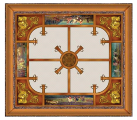
III. 4. The glass globe of the 'English office' of the former Rodzianka flat. The drawing from the funds of "Ukrrestavratsiya" corporation

sident of Ukraine. Since in the Soviet times, the government polyclinic was located in the house, typical standard Soviet lighting devices were installed everywhere and no original lamp from the time of V. Gorodetsky was preserved. Therefore, during the restoration and recovery work with the new building adaptation, our specialists had to study the enormous number of archival sources and perform the research of the original lighting system to provide the authentic look of the