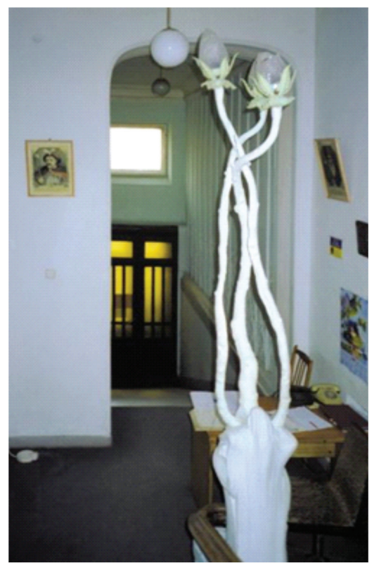
III. 1. The lamps of the Kachkovsky Clinic stairwell. The photo by J. Ivashko, 1998

The 'Dialogue with the East', which lasted during the process of familiarization of the European artists, architects, collectors with the Eastern art, influenced the formation of European Art Nouveau [12]. A well–known Art Nouveau researcher, D. V. Sarabianov, emphasized that the influence of Japanese art was felt at the beginning of the Secession style formation which led to the influence of the East, that is to say, from "inside the style", in all its manifestations, undergoing transformation in accordance with the European world perception [7]. There were several prerequisites for the Secession development in Ukraine, and they differed depending on the ad-