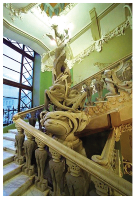
III. 3. The lamp with fishes in the House with Chimaeras.

The issue of the correlation of the required lighting and the object authenticity is especially important for the objects of restoration, many of which were illuminated in accordance with that time requirements. We should consider solving the issues of lighting on the example of the famous "House with Chimaeras", modified to be used as the residence of the Pre-