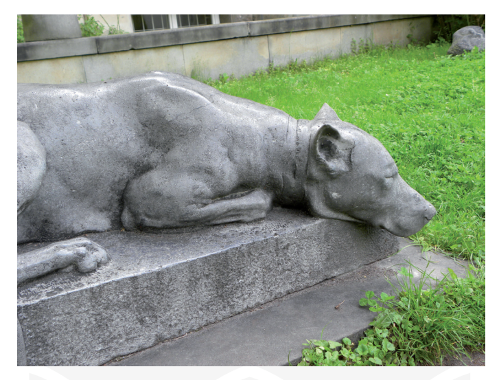
Ill. 10. In the 19th century were popularity of images of animals in art. The marble sculpture of Eduardo Leon Perrault's 'Dog' 1887 belongs to a realistic sculpture of French