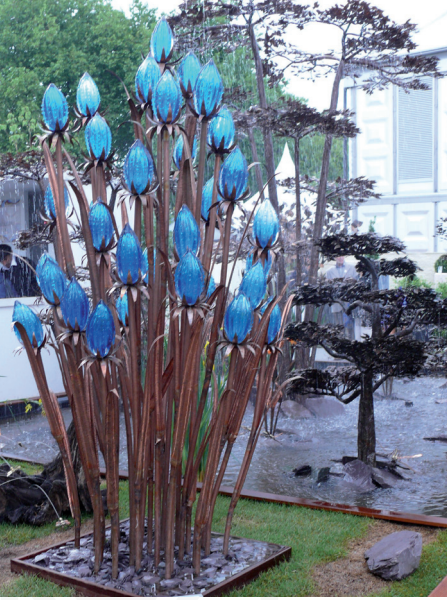
Ill. 11, 12. Installations of metalwork and glass – London exhibition of gardening. Chelsea Flower Show

These sculptures, set on water and forming, for example, a flock of flying birds or jumping dolphins tend to be a huge attraction at horticultural exhibitions or temporary exhibitions in the botanical gardens around the world. The irrigation and manuring of such sculptures is hidden, for example, in the case of dolphins, in the columns of water springing up the fountains – this is located underneath each animal. Such objects leave lasting impressions on visitors.