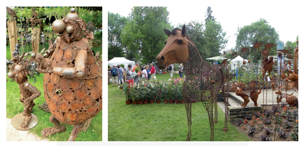
Ill. 3, 4. Garden sculptures in home gardens made of corten steel (a type of low alloy steel, the surface of which automatically turns to a protective coating which resembles rust upon exposure to the air and rain) at a horticultural fair in Zweibrucken, Germany