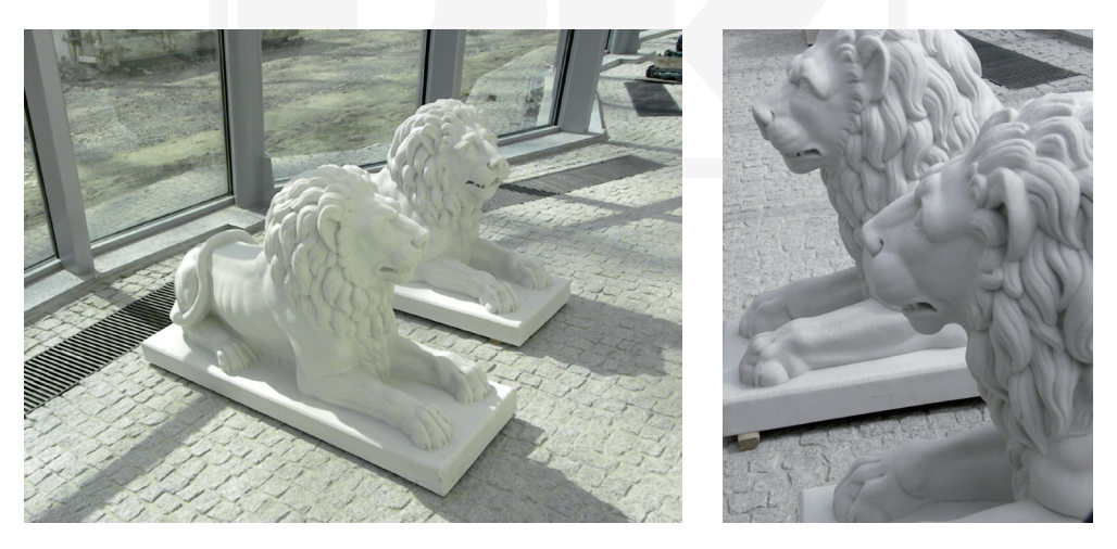
Ill. 1, 2. Lightweight and durable copies of sculptures of lions (the originals were made of stone) prepared for installation during the park restoration at the Wilanow Palace Museum (photo M. Dudkiewicz, 2011)

In the parks and gardens that are subject to revaluation, sculptures create the unique atmosphere and restore history. Today, there are opportunities to use modern materials without affecting the colour of the place [9]. A good solution is to use modern materials such as lightweight special concrete mortars on a frame with wire mesh and fibreglass for making copies of sculptures (Ill. 1, 2).