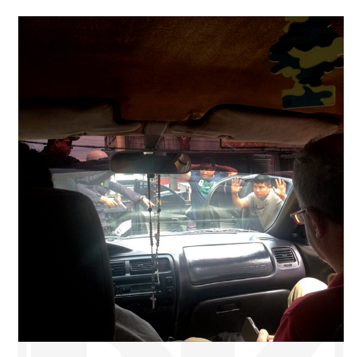
Ill. 4. San Salvador (El Salvador). Violence in the historic centre

The distribution of work and wealth has become increasingly complicated and is the main cause of the exponential growth of social exclusion and poverty levels – that still affect practically all the states of Latin America, where the proportion of the population that is in poverty or even of indigence increases with the same proportion of the spread of crime.