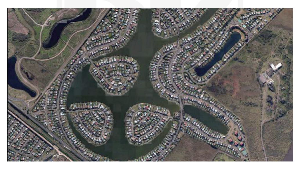
Ill. 2b. Western suburbs of Buenos Aires Metropolitan Area. Barrio privado 'Santa Barbara', Partido del Tigre, Buenos Aires (aereal view, source: Google Maps)