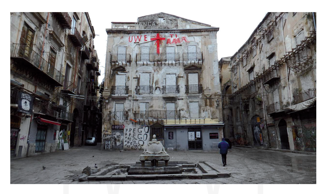
Ill. 5. Palermo (Italy), historic centre

themselves in the historical center, degraded, due to the lower cost of living. New inhabitants which, however, do not recognize themselves in the place which they live and which not cure as their own, up to turn it into a scenario for possible tensions between different national groups.