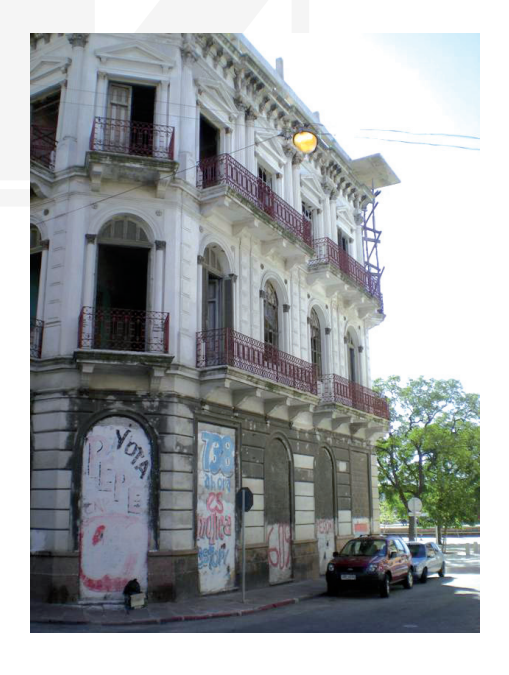
Ill. 6. Montevideo (Uruguay), historic centre