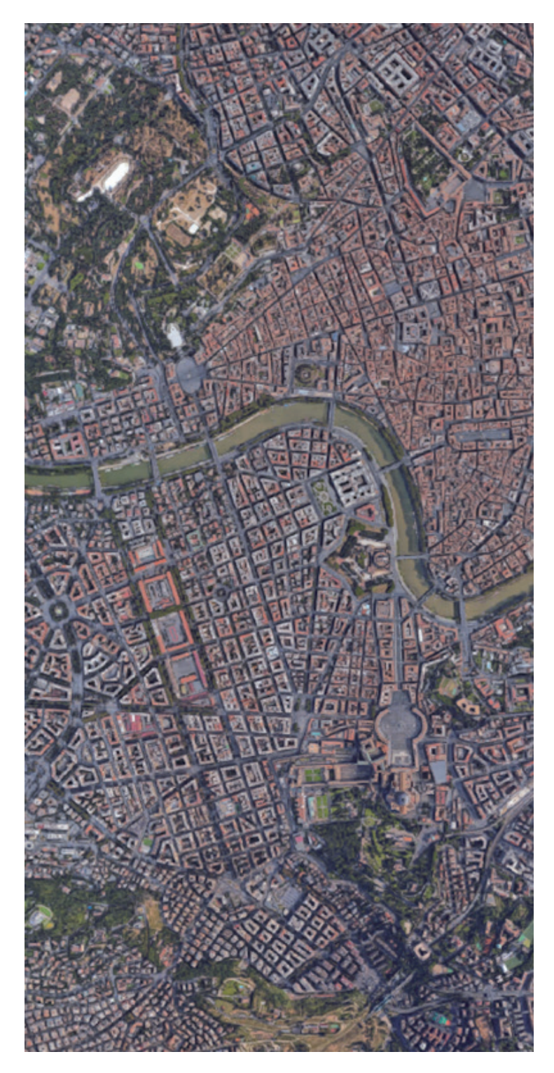
III. 1. Rome city center from satellite (source: Google Maps)