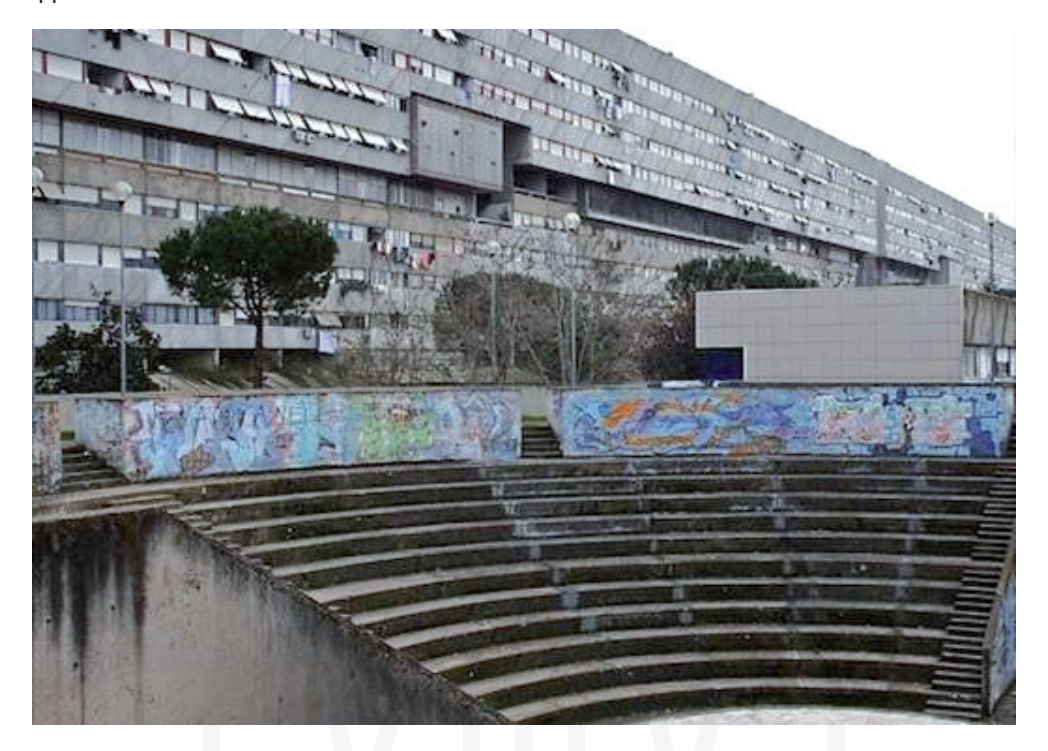
Ill. 7. Rome (Italy), 'Corviale' social housing complex (1970)

On the other hand, social housing neighbourhoods (usually located in – popular – suburbs and created as arrogant 'architectural experiments') are characterised by: low quality constructions; frequent scarcity of public services; difficulty of access to and shortage of public transport.