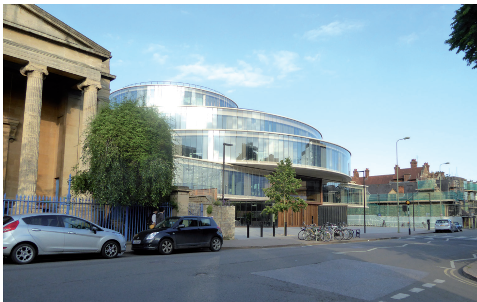
III. 1. The Blavatnik School of Government, University of Oxford