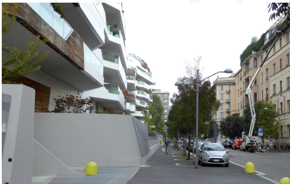
III. 2. Residenze Hadid and Libeskind, Milan