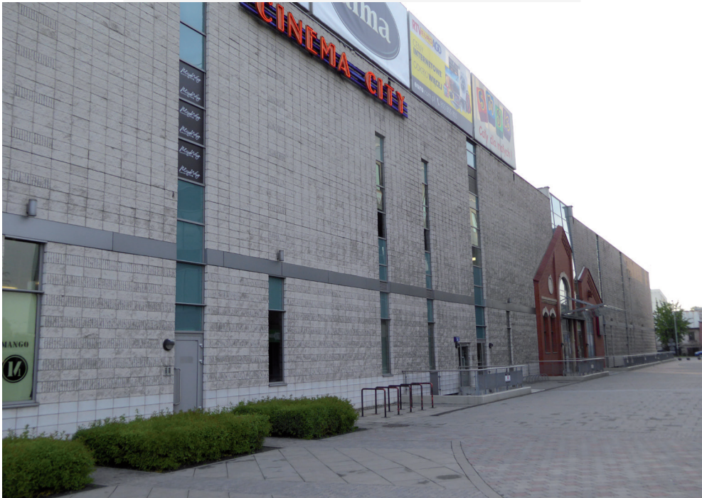
Ill. 3. An external wall of Galeria Kazimierz, Krakow

In addition to the prevalence of gated communities the insertion of shopping malls on central and peripheral sites is a common form of development. These have the effect of moving retail uses away from streets and reducing their diversity and mix of uses. Another result is the presentation of blank walls and inactive edges to the streets as in Krakow's Galeria Kazimierz (Ill. 3). A UK example of the privatisation of public space was the sale of the centre of Milton Keynes by the New Town Development Corporation. The result is that the internal pedestrian routes crossing it now close at 8.00pm and even earlier at weekends thus obliging the public to make long detours around the 700 metres long building.