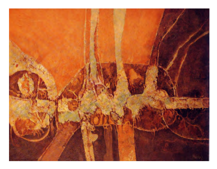
Figure 6: Dumetorum (1980, mixed techniques on canvas, 64 \times 80 cm, private collection, Tenerife)

However, maintenance of the same technique gives a similar roughness and texture to the painting's surface. This indicates the unity of matter and the common origin of all elements. The background of the painting – that is, the inanimate world – is determined by the origin of the animal. This is confirmed by the composition of the form of the animal with the colours of the background – metaphorically, taking material from inanimate nature. In other words, evolution produces complex organisms, but it uses the same matter and elements that build the inanimate world "in the background". This statement is enriched and confirmed by the words of Manrique, who writes: