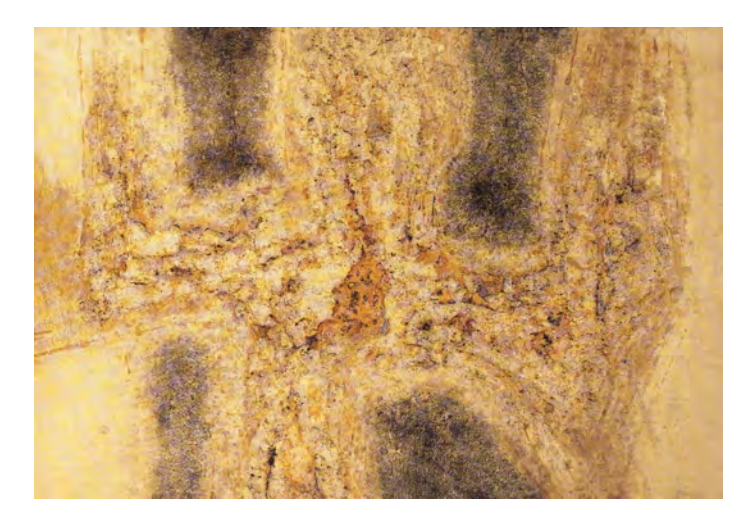
Figure 1: Pintura no. 34 (1959, mixed techniques on canvas, 81 \times 116 cm, Collection of the César Manrique Foundation)

Manrique is sincere in touch with objective, this sincere has nothing to do with confessio , i.e. personal confession, but which expresses itself in openness to the truth, which can be expressed and realised in works of art. Thus, in his interpretations Aguilera also invokes the symbolism of light, which expresses the sincerity and truthfulness of the content, regardless of whether it flows from the artist or from nature or whether its source is some kind of religiosity. This light is clarity and non-secretiveness, aletheia . The invocation of music also made by Aguilera is a reference to a state of silence and meditation into which the artist enters, striving to hear the inner music of the world. This, then, is Pythagorean harmony, whence it is only a step away from misterium . These trends can be observed in the work of Manrique from his early years; in 1959, when he was forty years old, he created the Pintura cycles of numbered paintings. One may cite here Pintura no. 34 (Fig. 1) and Pintura no. 28 (Fig. 2).