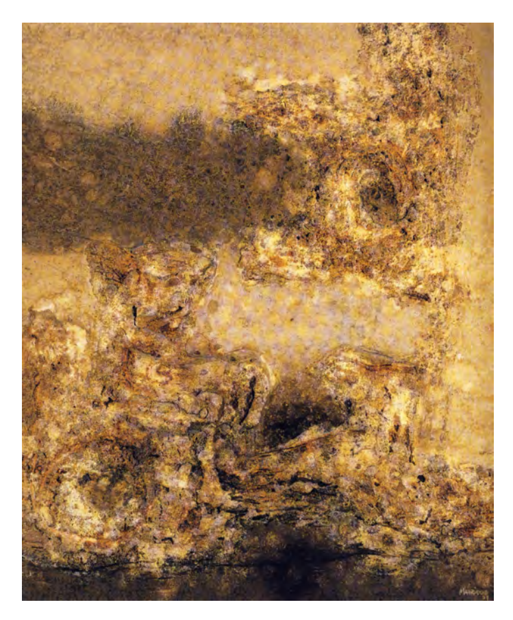
Figure 2: Pintura no 28 (1959, mixed techniques on canvas, 95 × 82 cm, private collection, Madrid)

The general trend in Manrique's oeuvre falls somewhere between optimism stemming from the idea of art and the great objectives defining it, and the consciousness of the finite nature of human life, which brings a note of nostalgia and tragedy to this concept. An example might be the work Torso posible (Fig. 3), in which a figure, splayed as if crucified, is depicted within a horizontal composition. It is transected from above with a bright vertical strip, which merely suggests widely extended male arms. The vertical strip may symbolise the spinal column or part of the cross. In this work, as in many other paintings by Manrique, his method of applying paint merits special attention. The artist repeatedly experimented with this technique (particularly recognisable in his works in cycles, beginning in the fifties); the density of the thickly applied paint actually resembles petrified or still-molten lava, or, at times, the structure of volcanic or fossilised rock. The weight of the paint