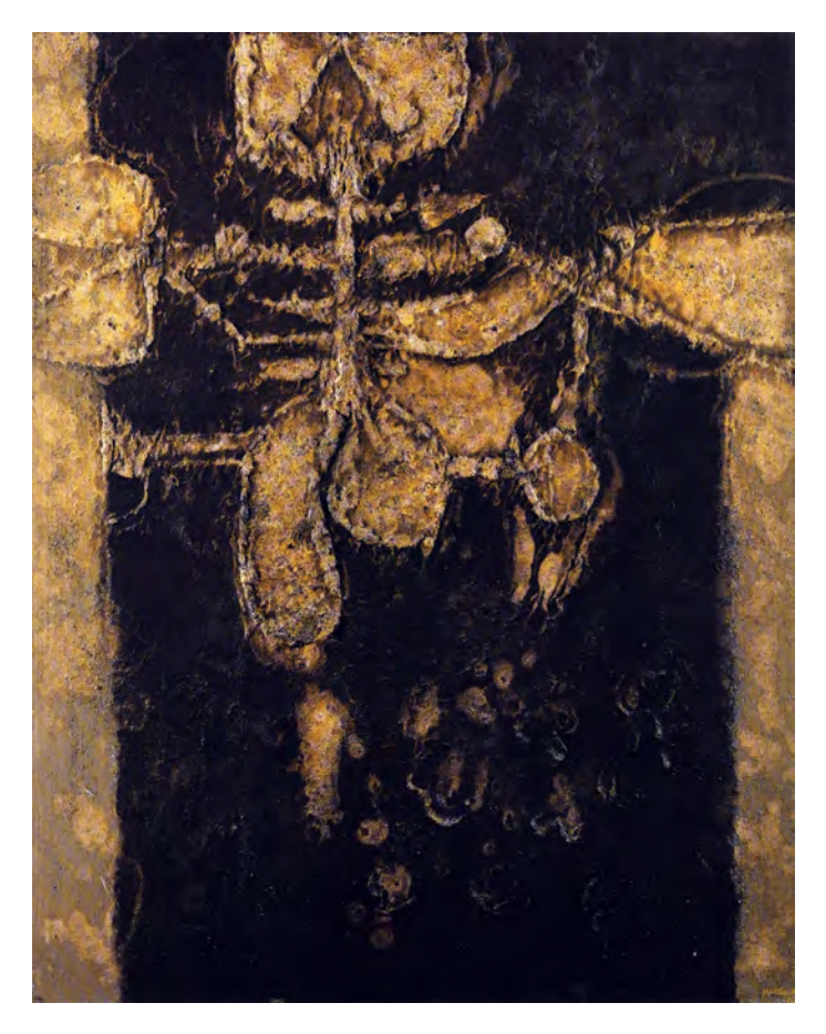
Figure 4: Solo en arena negra (1976, mixed techniques on canvas, 200 × 165 cm, private collection, Huesca)

In Manrique's work, limitations arising from consciousness of the finite nature of life are transformed into strength, since they enable a call for haste. It seems that Manrique reiterates his plea for a conscious, intense and sensual life; he writes in one of his notes "[T]he awareness of the miracle of life and its brevity have made me see clearly that we are impoverished by the tragic sentiment of our existence".<sup>9</sup> Although explicit tragedy can be seen in Manrique's work, it does not assume the character of, for example, typical twentieth-century European existentialism. The extremely powerful fusion with nature that represents and reproduces the very order of things enables him to distance himself from individual experience of the twists and turns