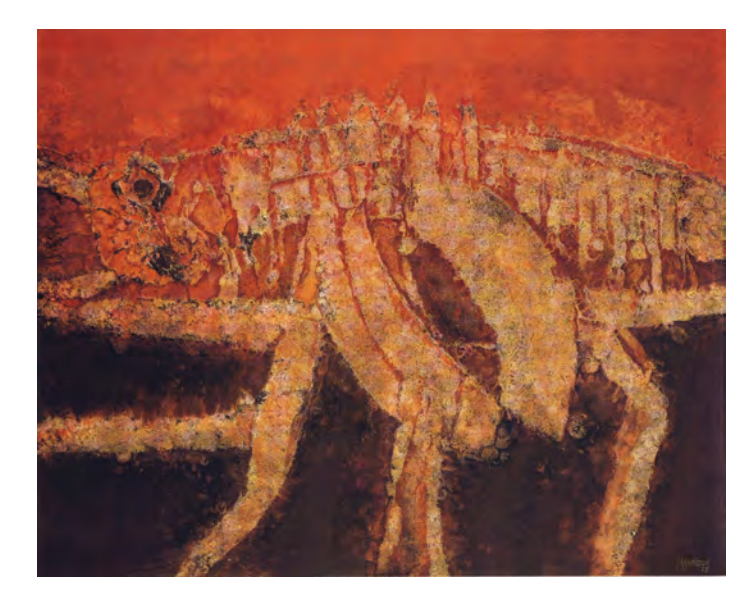
Figure 5: Gabarro (1979, mixed techniques on canvas, 98 \times 130 cm, private collection, Las Palmas de Gran Canaria)

evoked by this work is also illustrated Manrique's words: "On my canvases, I am always interested in abstraction as a process of recreation of the soil we tread, its texture, its strength, its somber chromatism. I then lose myself in the revelation of life embedded in the earth, its decomposition, and its death, concluding the earthly cycle".<sup>19</sup>