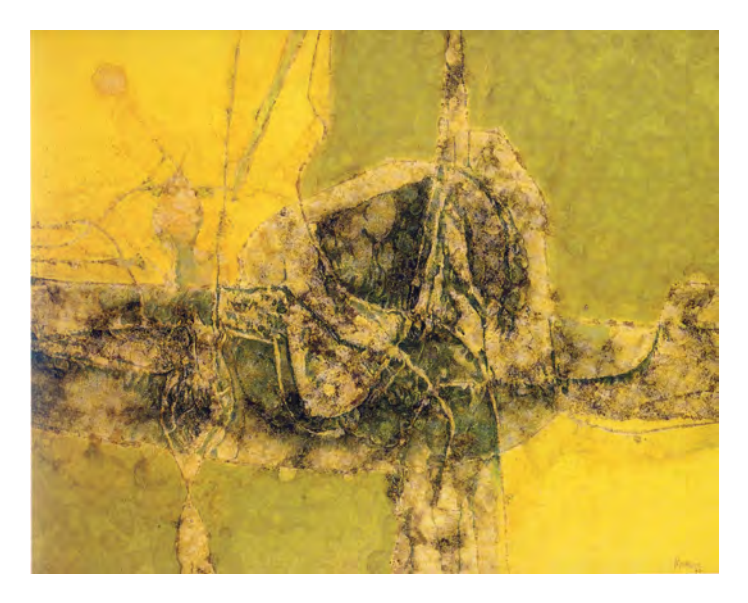
Figure 7: Mojado (1980, mixed techniques on canvas, 100 × 81 cm, Colección Testimoni, Obra Social de la Caixa de Pensiones)

It is possible to draw harmony from the world, harmony which can become a source of joy and peace. The aesthetic contemplation of works in which the artist managed to penetrate the spirit of nature, to somehow disrupt the rhythm of the world, provokes aesthetic delight and can serve as an object of philosophical satisfaction. Philosophy is meant to be a source of joy, joy that gives us an awareness of who we are. To a great extent precisely such a philosophy and such art are necessary as "a cure for the soul". The desires, needs and destiny of man are combined here in the act of creation, and acceptance of them ought to be a source of joy and happiness. Manrique writes, "I want to extract harmony from the earth to unify it with my feeling of art".<sup>21</sup>