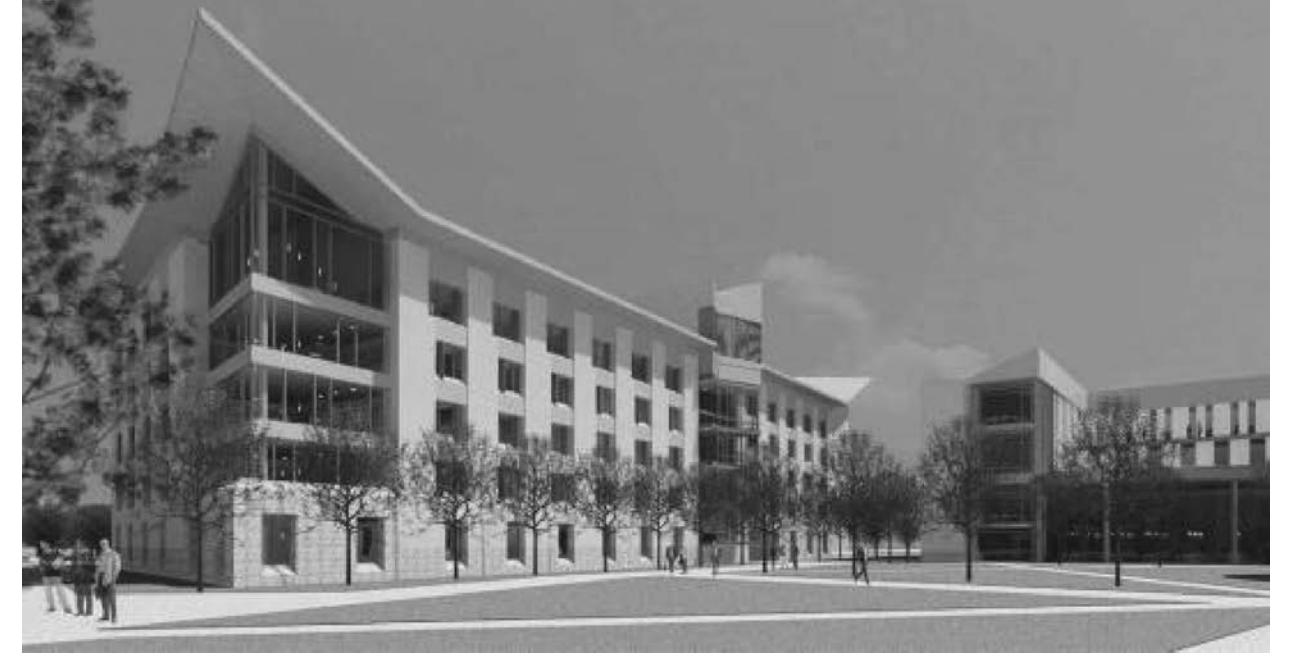
il 1. UCU Complex at Stryiska Str./ Ukrainian Catholic University [Electronic Resource]. – Mode of access: URL: http://ucu.edu.ua/ – Title from the screen

Educational doctrine of the above mentioned university influenced organization of its spiritual, educational and recreational spaces. Architecture of the building complex reflects the theological and civil educational grounding of the Ukrainian Catholic University (UCU). The university has two faculties: philosophical-theological and humanitarian. Therefore, stylistics of the complex facades is the mixture of spiritual, mainly conservative, and modern architectural motifs [7]. The main architectural dominant and the spiritual-ideological core of the building complex of the UCU humanitarian faculty at Stryiska Str. is, without any doubts, the temple (Pic. 3), which is currently on the stage of construction. Designed as a classical Ukrainian church of the Cossacks era, the university temple is a multifunctional facility. It is envisaged that besides liturgies