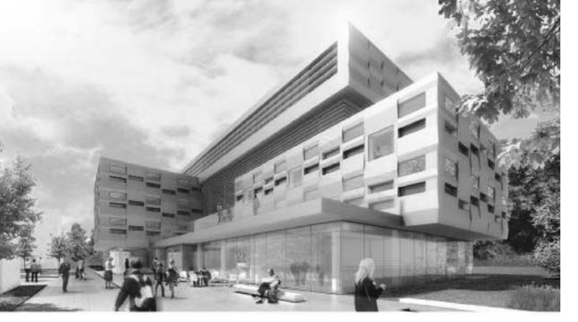
il. 5. Project of UCU academic building / Ukrainian Catholic University [Electronic Resource]. – Mode of access: URL: http://ucu.edu.ua/ – Title from the screen

tial buildings supports the doctrine of Church openness and orientation of eternal Christian values into the future (il. 5, pic. 6).