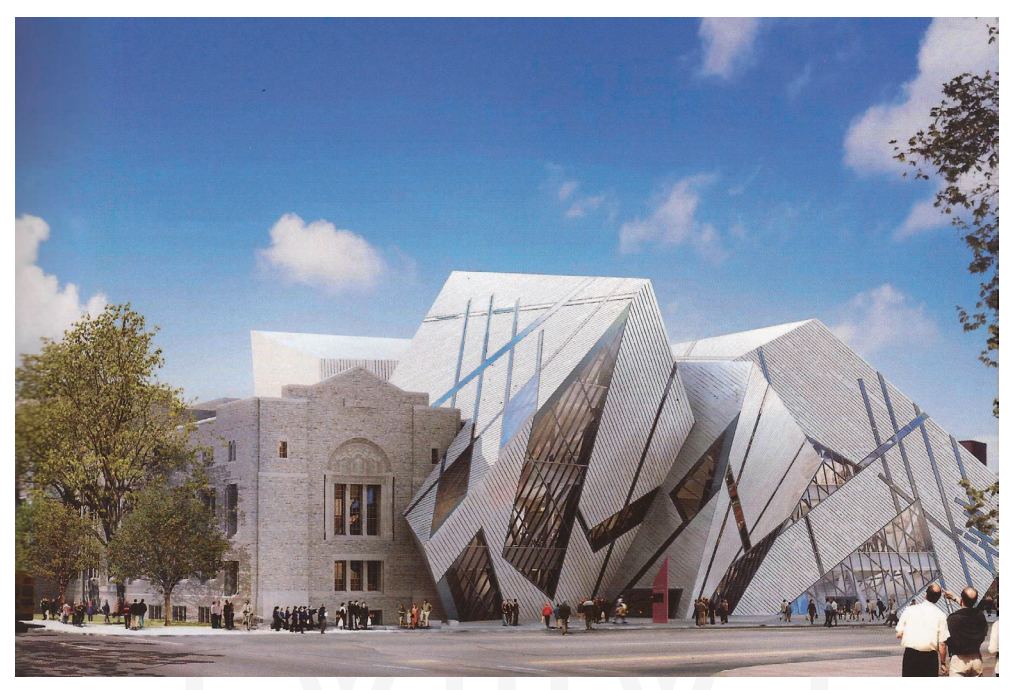
Ill. 10. Toronto Royal Ontario Museum (arch. D. Libeskind)