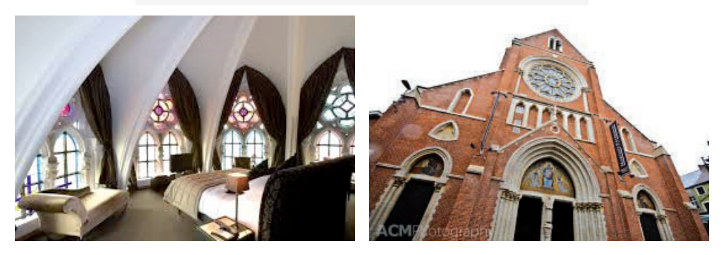
Ill. 5. Mechelen Hotel Martin's PatershofIl. 5. Mechelen, Hotel Martin's Patershof