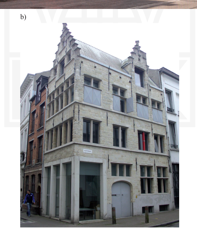
Ill. 3. a) Copenhagen converted power station; b) Antwerpen, HofstraatIl. 3. a) Kopenhaga, zaadoptowana elektrownia; b) Antwerpia, Hofstraat