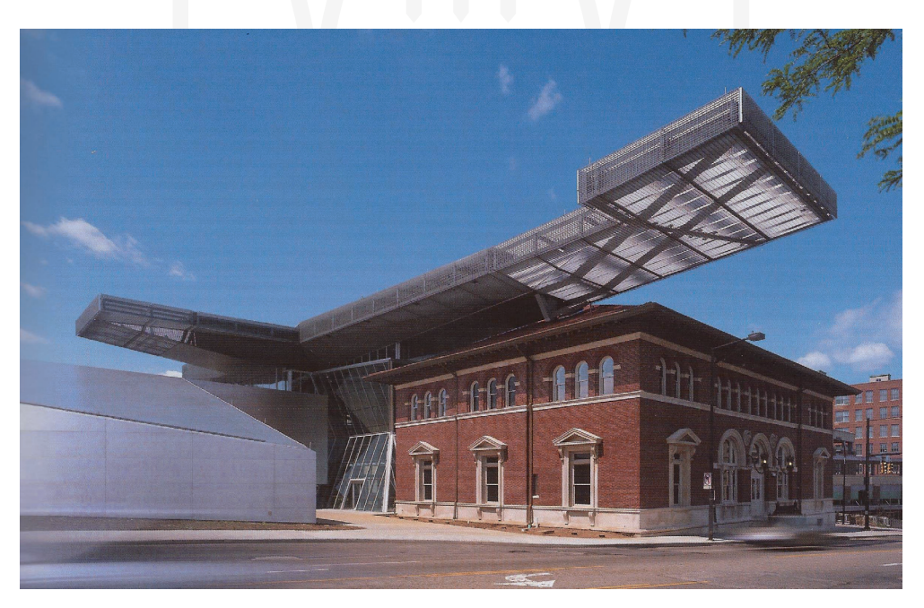
Ill. 7. Akron Ohio Art Museum Coop Himmelbau Il. 7. Akron, Ohio, Muzeum Sztuki Coop Himmelbau