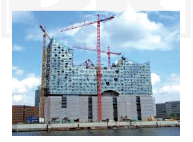
Ill. 9. Hamburg Elbphilharmonie (arch. Herzog & de Meuron)Il. 9. Hamburg, Filharmonia na Łabą (arch. Herzog & de Meuron)