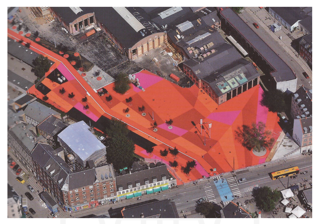
Ill. 4. Copenhagen Park Superkilen (Big Architects)Il. 4. Kopenhaga, Park Superkilen (Big Architects)