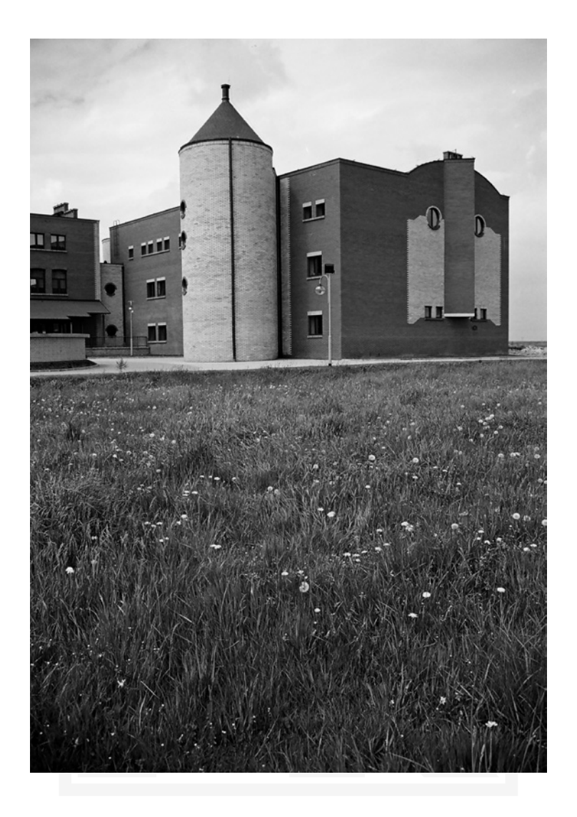
III. 2. Primary school, Pianówki, arch. B. and J. Włodarczyk, The elevation with the face

In the interwar period, the approach to architecture in Poland appeared to be a novelty. After almost three centuries of total mess in this game there were the first attempts to put order in the space – it was building Gdynia as well as the concept of Functional Warsaw, the architecture of health resorts and sport objects, yet, with total neglect of some parts, particularly those in the east. Well, there was relatively little time.