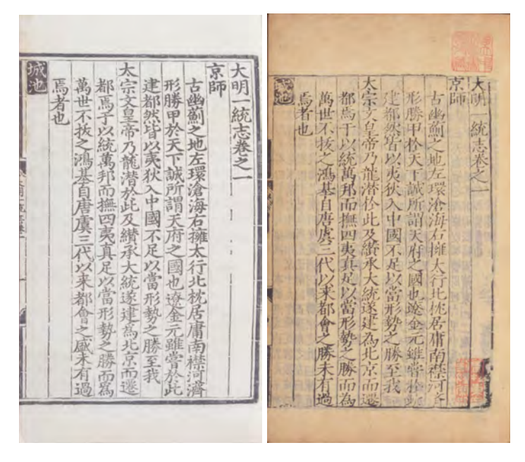
Figure 1: Da Ming yitong zhi 大明一統志. Examples of different calligraphic styles of script used in the early Ming printing (left. 1461. Published by the Directorate of Ceremonial [Sili jian 司禮監]. National Central Library [Taiwan]. Collection Nr. 03201) and the late Ming printing (right. 1559. Published by Guiren zhai 歸仁齋. National Central Library [Taiwan]. Collection Nr. 02309).

calligraphic style of some imprints of the Song dynasty, but with repeated application to woodblocks by ordinary craftsmen, it became more rigid and straight, and eventually transmogrified into the mechanical, nondescript calligraphy which came to be called "craftsmen style"( jiangti 匠體) (Fig. 1)<sup>16</sup>.