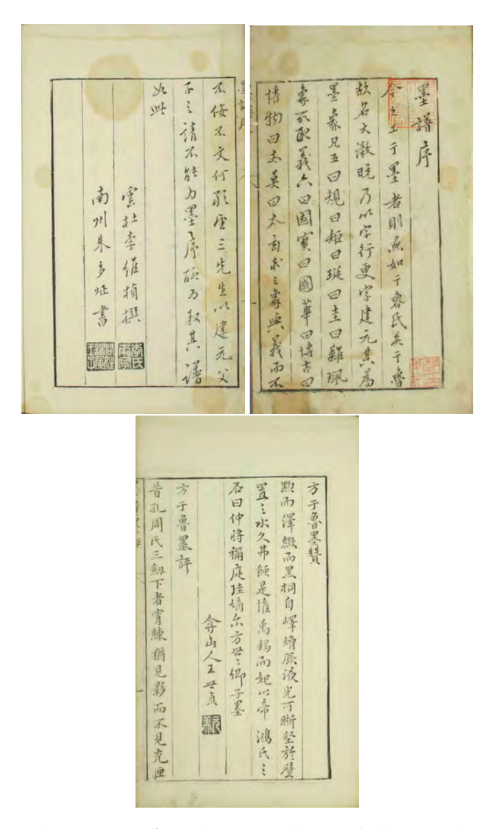
Figure 5: Fangshi mopu . Prefaces by Li Weizhen and Zhu Duozheng (top) and by Wang Zhizhen (bottom). 1589. Published by Fang Yulu. Kyoto University Library.