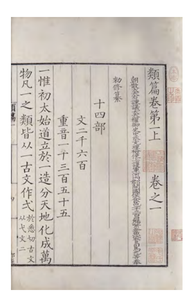
Figure 9: Leipian 類編. Yingsong chao. Early 17th cent. Produced by Mao Jin's 毛晉 (1599–1659) Jigu ge 汲古閣. National Palace Museum (Taiwan). Collection Nr. 014139

ation, uniformity, and standardisation<sup>43</sup>. Although some typefaces could be very beautiful, they could not transcend the mechanical dullness resulting from frequent repetition of identical forms. But for most readers, they did not feel any loss in the dulling of the aesthetic impact that typography inevitably induced. Since standardisation, routinisation, and tendencies toward dull uniformity were already present in the nature of most alphabetic scripts, so there was no notable wrench when handwritten pages were superseded by typography in Europe. In general, despite a brief initial phase of continuing influence, the links between calligraphy and the printed book in the West were rather easily broken when printing intervened.