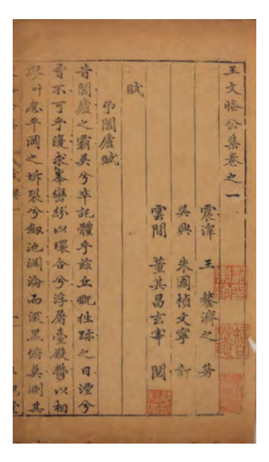
Figure 2: Wang Wenge gong ji. 1573–1617. Published by Sanhuai tang. National Central Library (Taiwan). Collection Nr. 11504.

ary anthology of Wang Ao 王鏊 (1450–1524). Cut on the basis of a late 1530s edition with the same content but a different title, this work was printed by Wang's great-great-grandsons sometime during the reign of Wanli (1573–1617) in the Sanhuai tang 三槐堂 of the Wang family, as recorded in the centre-page block²². Next to a preface written by Huo Tao 霍韜 (1487–1540) in 1536 for the earlier edition, the latter version of the anthology also bears two undated prefaces by Dong Qichang 董其昌 (1556–1637) and Zhu Guozhen 朱 國楨 (d. ca 1625), respectively. The work does not give any information about the actual calligrapher, yet through a comparison of the calligraphy in this work with that in Shen Zhou's literary anthology, Shen Shitian ji 沈石田集, whose calligraphy is identified, Wang Chongmin asserts that the beautiful