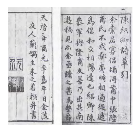
Figure 8: Nanyou gao . 1623. Authored by Chen Zhaoji. Photographic copy of the original kept in Naikaku Bunko. From: Mote and Chu 1989, 190, fig. 105.