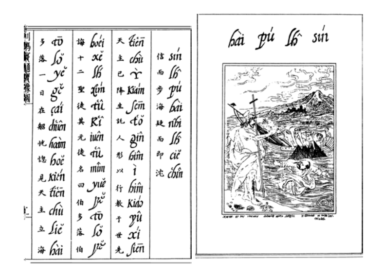
Figure 7: Chengshi moyuan . Illustration and script of Xin er bu hai by Matteo Ricci. From: Guarino 1997.