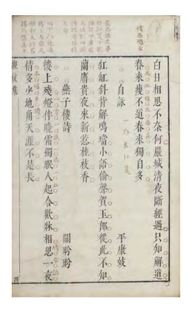
Figure 3: Tangshi yayi pin. 1621. Published by Min Qiji. National Library of China (Beijing). Collection Nr. 18666.

Mengfu. The calligraphy and pungent comments enhance a sense of realism, as if the book had been personally annotated by a scholar as he was reading it.