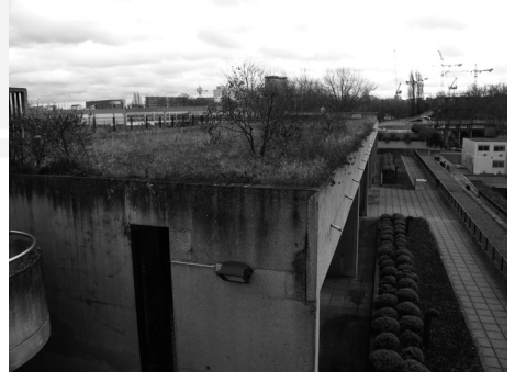
Ill. 7. The damages of parapet walls of flat roofs