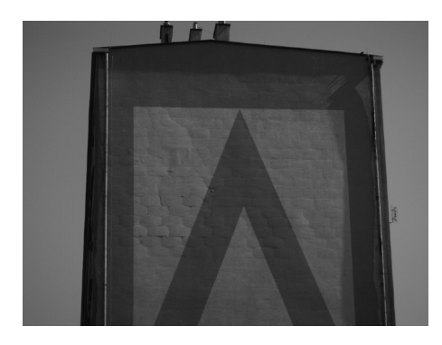
Ill. 2. The defects of technologies and execution