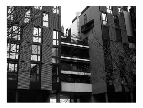
Ill. 3. The variety of building skin structures