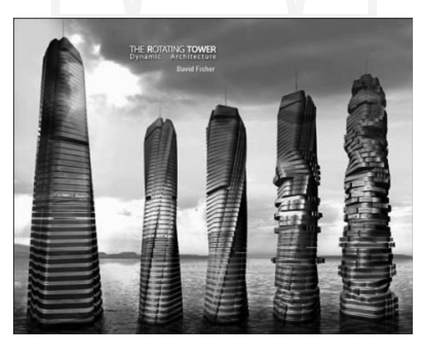
Ill. 4. David Fisher's Rotating Tower [4]

The so-called dynamic architecture belongs to the newest concepts of wind architecture. These are mostly tower blocks whose main goal is to obtain electric energy from wind and they are (for the most part) turbines themselves. Dynamic architecture introduces three leading innovations to the skyscraper of the traditional type, which are: variable shape, clean energy production and energy self-sufficiency. Buildings designed according to this trend are to 'follow' the sun taking advantage of its light as much as possible and move together with the wind converting its power into electricity. These assumptions are to cause modern architecture to be more efficient and environmentally friendly.