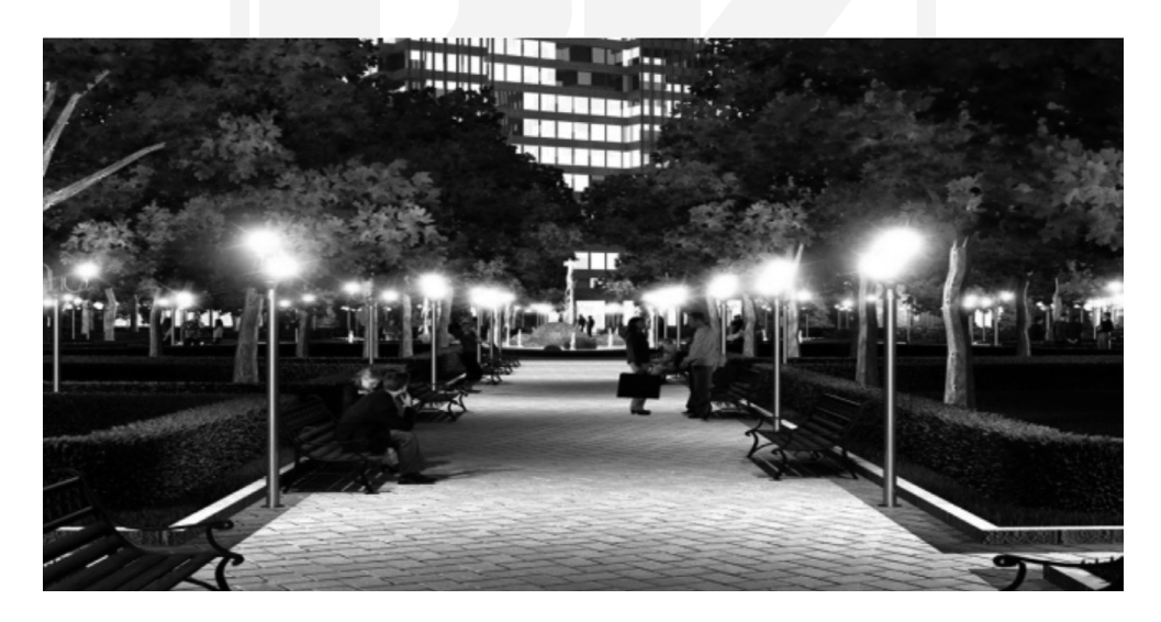
Ill. 4. "Hanging Gardens"

Emotional delight in the perception contributes to placing songs in the middle of a single integrated development of the city center. Impression is reinforced by the fact that the walls are almost devoid of any ornaments. The huge complex was conceived as an image of the real future, which heard the echoes of ancient wonders. These live trees, like the "hanging gardens" of ancient Babylon, are the only decoration of the walls.