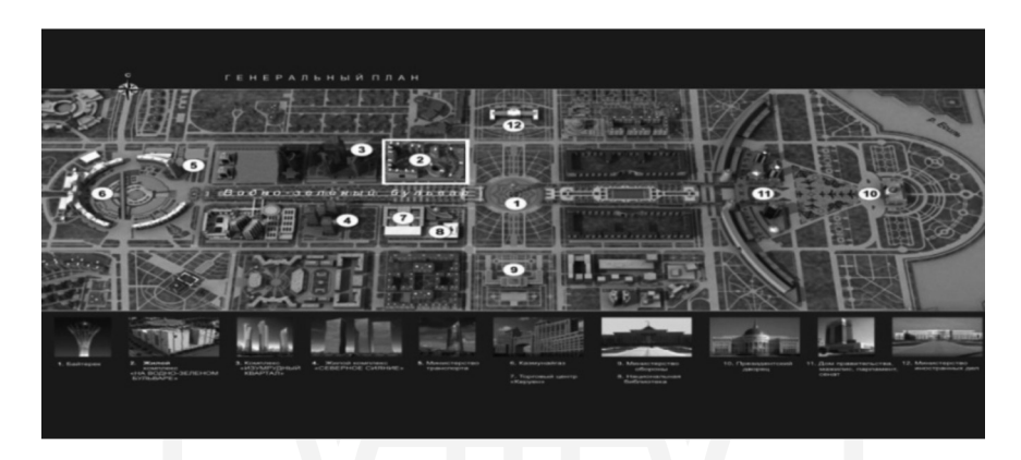
Ill. 1. Water – Green Boulevard (source: [1])

A new residential complex "On Water – Green Boulevard" is located in the prestigious district of the capital – on the left bank of Ishim river, near the Presidential Palace Square and circular "Baiterek". It fits in the overall landscape of the city center. In general, all these buildings create a unified architectural ensemble. Stylish and dynamic, the complex most fully expresses the idea of combining modern technological era buildings with the dream of humanity in a wonderful distant future. The integrated construction and infrastructure make it attractive and comfortable for living, and the proximity of parks and magnificent fountains only emphasize the advantages of the complex.