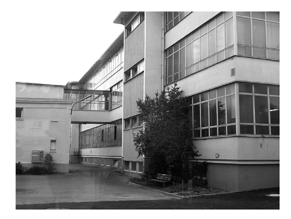
Ill. 2. Current state of the Steiff toy factory in Giengen, Germany