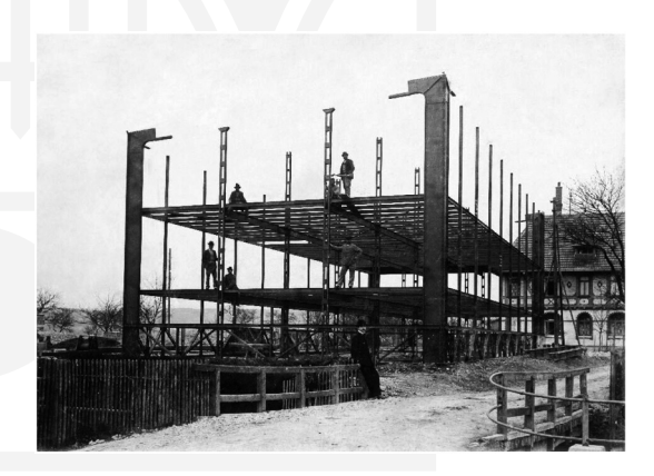
Ill. 1. The construction of factory buildings in Giengen, Germany, 1903 (source: [5])

In 1957, the first design solution that featured the flow of air between two sets of windows was patented in Scandinavia. The first office building to make use off a system of ventilated