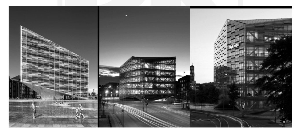
III. 5. External view of the Nykredit bank building facade, which is an integral part of its integrated heating and HVAC system, design: schmidt hammer lassen architects, Aarhus

This allows for the natural ventilation of offices, along with a far better acoustic insulation, improved cooling during the night with the use of natural air circulation that occurs inside the building due to the opennings in the facade and the return outlets at roof level. The building is also equipped with photovoltaic cells placed on the roof, which produce up to 80 000 kWh per year, a rainwater collection system which allows it to be used to flush toilets and the use of seawater as a component of the HVAC system. These are all parts of the energy efficiency improvement concept of the building, which brings its energy usage down to 70 kWh/m<sup>2</sup> per year. This is a very low figure [17], considering it is 25% lower than the current legal standard