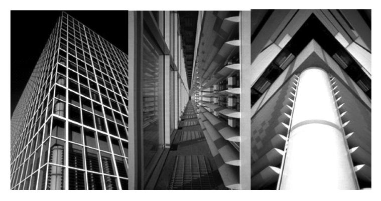
Ill. 3. View of the Occidental Chemical Center facade in Niagara Falls, NY, USA, 1980, design: Cannon Design Inc., Principal, Mark R. Mendel (source: [15])

an undivided space along the entire height of the structure with air supply inlets at ground level, fitted with mechanical dampers and air return outlets at roof level which allow the air to leave the buffer section of the facade.