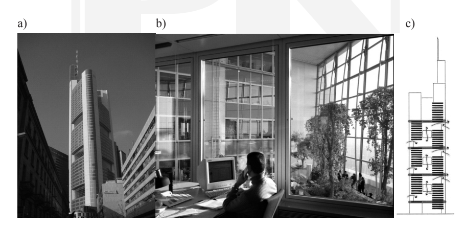
III. 4. Commerzbank Tower exterior facade, interior and ventilation scheme, Frankfurt am Main, Germany, 1997, design: Foster + Partners Ltd Riverside, 22 Hester Road London SW11 4AN

The Commerzbank Tower in Frankfurt am Main, Germany, is a good example of new developments in the field of facade construction, as well as a system of ventilation that is integrated with it. Each floor of the building has access to daylight and openable windows that allow it to be naturally venitlated throughout the year. The building was designed with energy conservation in mind. Its energy use is half of what can be expected from a building that is comparable in size and scale. Its design incorporates an original idea of locating office floors around internal gardens roughly four stories high. These gardens are linked with the external facade of the building and are home to a diverse range of plants, depending on the orientation of the garden in relation to the direction it is facing. This idea has allowed the