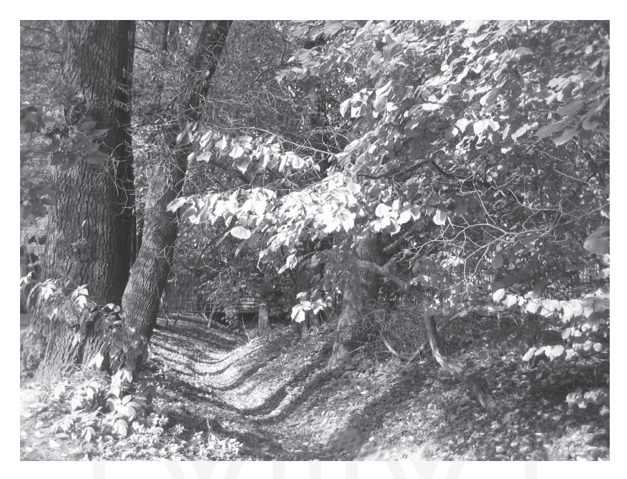
III. 4. Water-less Olszecka Leat bed between the Polsad Roundabout and Młyńska Boczna Street