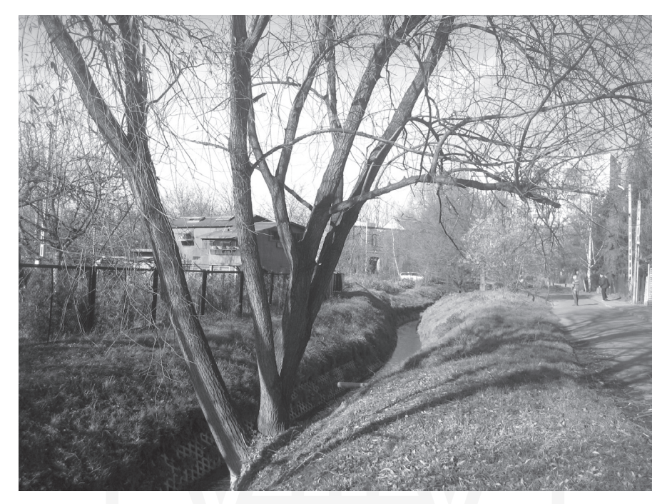
Ill. 3. The waters of the Sudół stream flowing along Olszecka Street, the building of the Dominican Mill visible in the background

type meaning is unclear and was to perform the function of a river park. The remaining part of the area adjacent to Lublańska street since 2008 has been gradually built up by a multifamily development complex called The Enchanted Mill . The development complex is being constructed in compliance with the land development conditions decision for the area obtained by the investor. The area which is being built up is exposed to flooding with the 'one-hundred years water' (Q1%) and is also disadvantageous from the point of view of acoustics<sup>18</sup>.