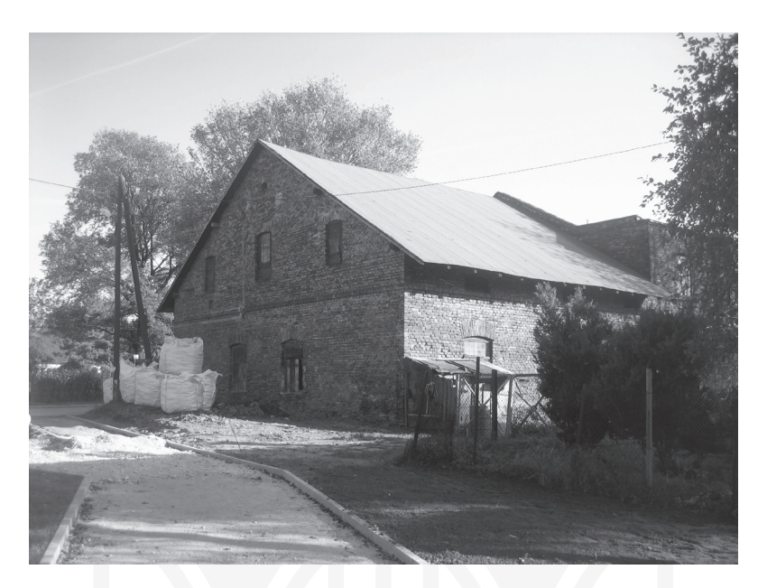
Ill. 1. The Dominican Mill (Frog Mill)

The boundaries of the present-day 3<sup>rd</sup> district of Kraków also encompass a part of the area that used to belong to the village of Rakowice. The first mention of this village, which until the end of the 1<sup>st</sup> Republic was a royal village, comes from 1244. In the 15<sup>th</sup> century, a farm, a royal manor and a mill called the Rakowicki Mill were established. The whole complex is still clearly discernible on a map from 1944. In the 19<sup>th</sup> century, the manufacture of chicory was founded in the area of the farm, which at that time was the property of Antoni Zazmanit<sup>10</sup>. In 1910, the area of the farm was bought by the Piarists<sup>11</sup>, who built a chapel and an Education Institution for boys. In 1912, an airport started to operate in the area of Rakowice which was gradually extended in the following years – it was the biggest and the most modern in Poland at that time<sup>12</sup>.