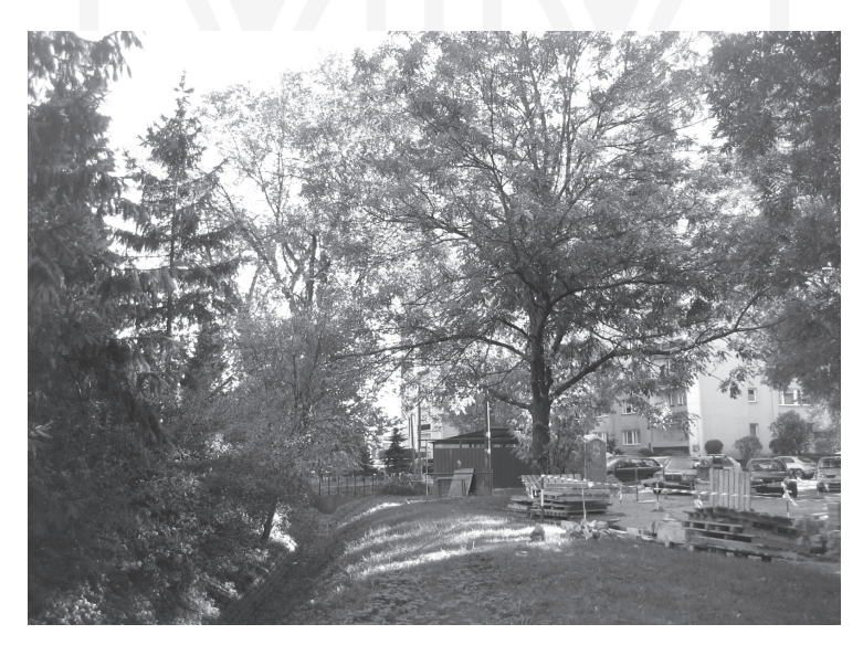
Ill. 5. The Rakowicki Mill used to stand in the place of the present car park and block of flats visible in the background until 1978. On the left, the water-less bed of the Olszecka Leat (photo by the author, 2012)

In the area of the village of Rakowice, there is the still discernible bed of the Olszańska leat. The Rakowicki Mill does not exist any longer. In the place of the mill's building, a housing tower was built at the end of the 70s, a car park and a green plaza have been put up (Ill. 5). The existence of a royal mill in this place is commemorated in the names of the streets: Młyńska (Mill street), Młyńska Boczna (Mill Side street), Żarnowa (Hand mill) or Sadzawki (Pool).