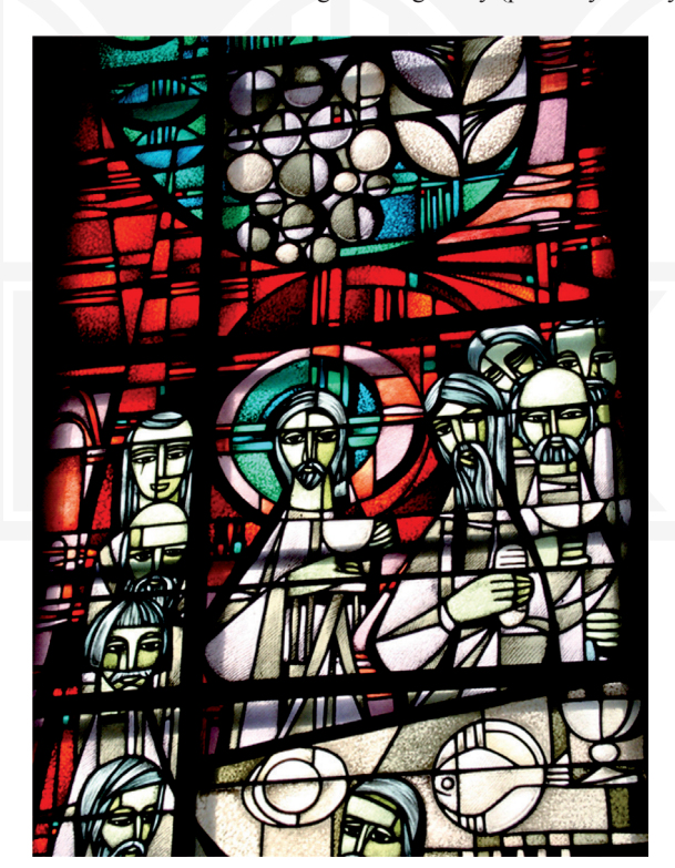
Ill. 9. The Lord's Supper , stained glass picture of the authorship of Wiktor Ostrzołek, the church of Christ the King in Przegorzały