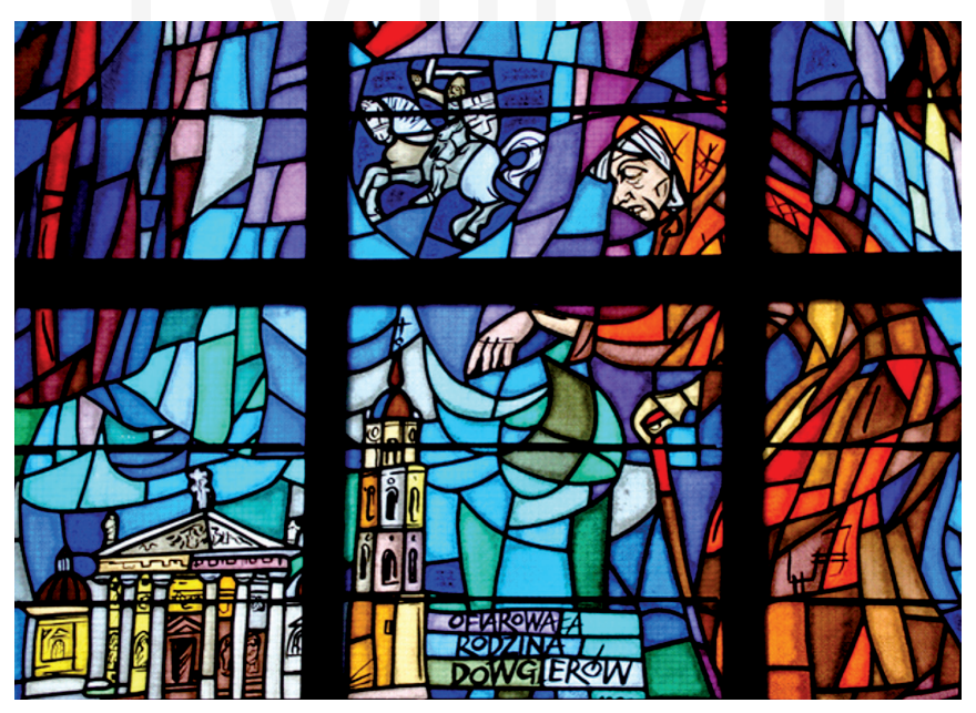
III. 3. Architectural motifs, stained glass picture of the authorship of M. Kauczyński, the church of St. Wojciech