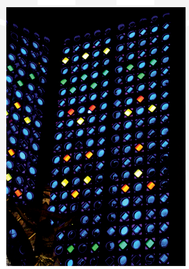
Ill. 7. Abstract stained glass pictures made by Wacław Taranczewski supplement the earlier modernist interior of the church of Our Lady of Victory

The colours of glasses refer to historically preserved symbolism and highly contrasted in the scope of colour scheme and temperature: red colour dominates, which builds intensive relations with the shades of yellow and azure colours. The interesting thing is the fact of small glazed pieces placed on the western side, which constitute modest, mostly abstractive compositions, disturbing at the same time the rule which is common in the Christian symbolism, ascribing the main significance to the right part of the church – they also make it possible to move to the next level of interpretation: turning the church towards the values of the Old Testament. Does a Synagogue play a more significant role than Ecclesia according to designers? The postmodernist architecture, which changes a viewer into an active recipient as a rule, obtains on such supplement an additional level, which can be subject to decoding; when stained glass pictures "speak" on various levels, by their hidden contents and enrich an architectural masterpiece with a spiritual aspect, then they not only open the world of beauty for their believers, but also incline them to reflection and take up a theological discourse, to whom the narration becomes to be subject to.