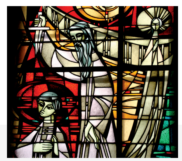
Ill. 8. The sacrifice of Isaac , stained glass picture of the authorship of Wiktor Ostrzołek, the church of Christ the King in Przegorzały