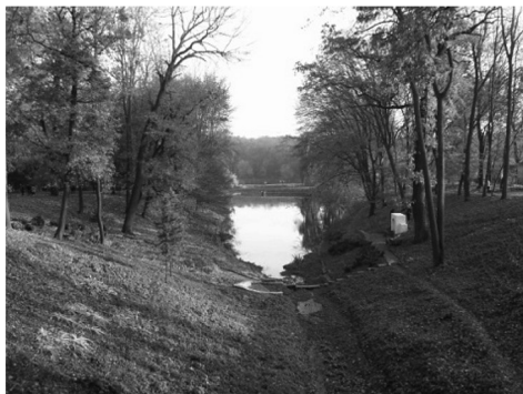
III. 2. "Alexandria" Dendropark, the spatial decisions in the park territory along the middle ravine