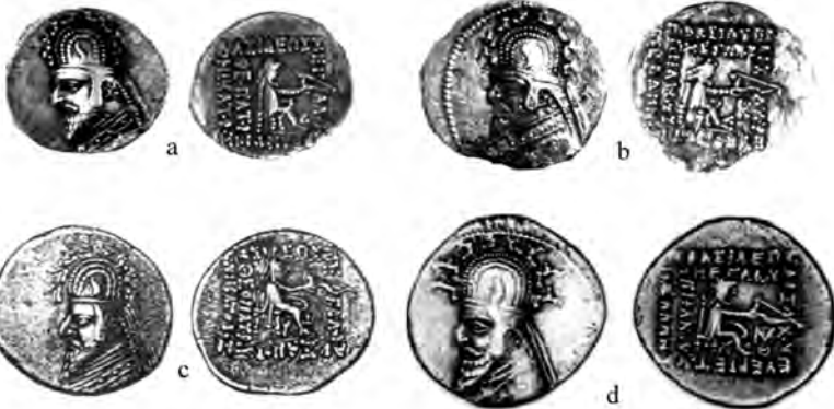
Fig. 30. Usually the coins of type 33 show a king with a somewhat longer beard than those of type 39, however, as shown here, this is far from being a general rule: a, c drachms of type 33 and b, d drachms of type 39, showing identity of portraits both of the short and long bearded varieties on coins of both types (a, d): author's coll.; (b): Sellwood coll.; (c): CNG