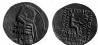
Fig. 10. Tetradrachm of type 37 (after Mørkholm)