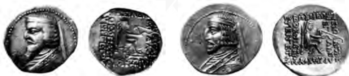
Fig. 24. Mule? 38/30 with EN ΠΑΓΑΙΣ compared with a regular issue 30 (both Sellwood coll.)