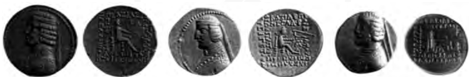
Fig. 9. Tetradrachm and drachms (with and without monogram) of type 36 (tetradrachm formerly Shore coll.; drachms author's coll.)