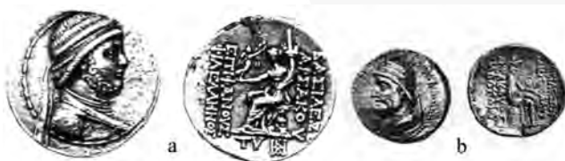
Fig. 1. A tetradrachm of type 23.2 and the drachm with ΦΙΛΑΔΕΛΦΟΥΥ possibly belonging to the same king (both author's coll.)