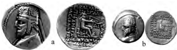
Fig. 4. Tetradrachm and drachm of type 31 (author's coll.)