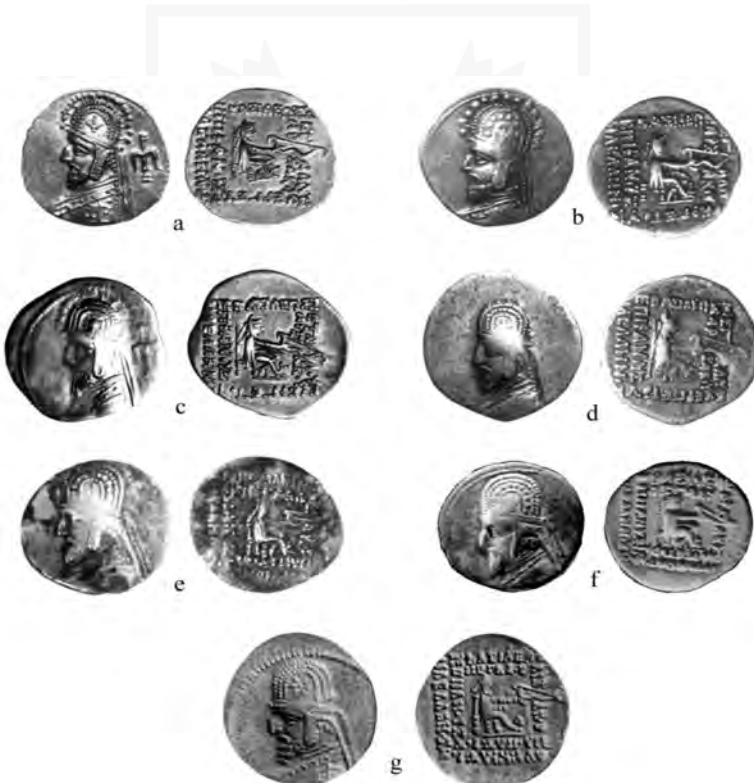
Fig. 14. A series of drachms showing the transition from type 34 to 31 (author's coll., except e) from Sellwood coll.)