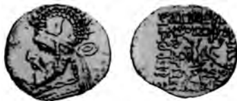
Fig. 17. Drachm of Gondophares I based (Nike instead of Tyke) on the types of the tetradrachm of type 39 (author’s coll.)