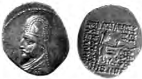
Fig. 28. Modified coin of type 31 but with horn on tiara (Sellwood coll.)