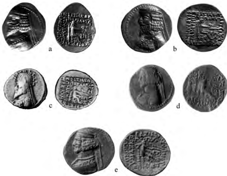
Fig. 15. The series of “dated drachms” of types 38–39–40: (a): ΒΠΣ author’s coll.; (b): ΓΠΣ author’s coll.; (c): ΓΠΣ author’s coll.; (d): ΕΠΣ author’s coll.; (f): ΣΠΣ Sellwood coll.; I have failed to get a picture of the coin marked ΔΠΣ.