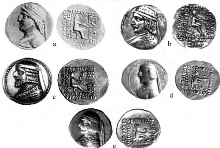
Fig. 3. Tetradrachms and drachms of type 30: (a) from Petrowicz, (b) Mørkholm, (c-d-e) author's coll.)