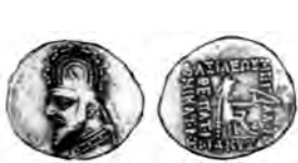
Fig. 6. Drachm of type 33 (author's coll.)