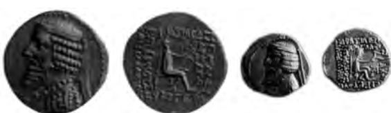
Fig. 11. Tetradrachm and drachm of type 38 (tetradrachm Petrowicz; drachm author's coll.)