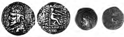
Fig. 7. Tetradrachm and drachm of type 34 (tetradrachm American Numismatic Soc.; drachm author's coll.)