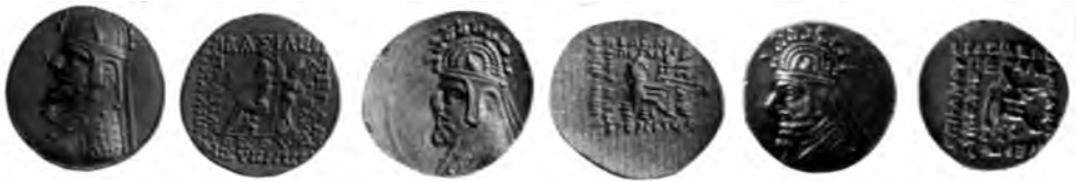
Fig. 12. Tetradrachm and drachms with and without monogram of type 39: (a) tetradrachm British Museum; drachm (b) author's coll.; (c) Sellwood coll.