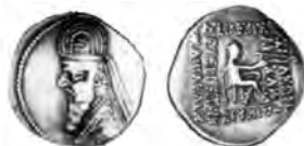
Fig. 2. Drachm of type 29 (author's coll.)