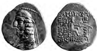
Fig. 25. Mule 30/33