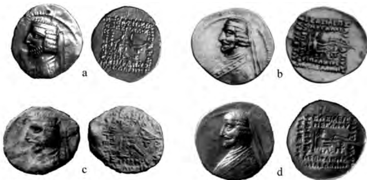
Fig. 23. Mules 30/36 (a, b: author's coll., c, d: Sellwood coll.)