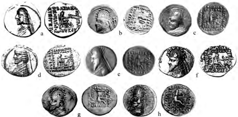
Fig. 31. Examples of the additions to the engraver's table: (a): type 30 eng. C (CNG); (b): 34 eng. J (author's coll.); (c): 31 eng. L (author's coll.); (d): 36 eng. G (Num. Fine Arts); (e): 33 eng. G (author's coll.); (f): 39 eng. G (Num. Fine Arts); (g): 39 eng. F (author's coll.); (h): 33 eng. H? (Hirsch)