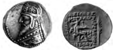
Fig. 5. Tetradrachm of type 32 (author's coll.)