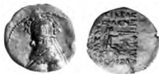
Fig. 27. Drachm of type 39 with title ΒΑΣΙΛΕΩΝ? (Sellwood coll.)