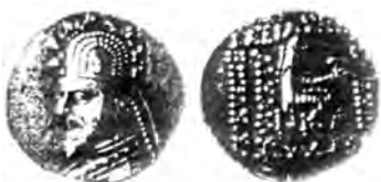
Fig. 21. A normal type 30 and the mule 30/34 apparently by the same engraver (both Sellwood coll.)