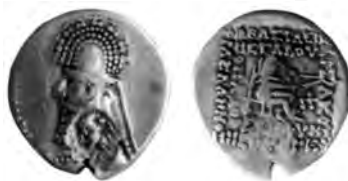
Fig. 16. Drachm of type 33–39 with ΘΕΟΠΑΤΟΡ ΦΙΛΕΛΛΗΝΟΣ (Sellwood coll.)