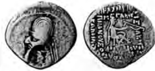
Fig. 18. Mule 28/31 counter-stamped by “Otanés” (formerly Shore coll.).