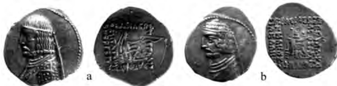
Fig. 20. A normal type 30 and the mule 30/34 apparently by the same engraver (both Sellwood coll.)