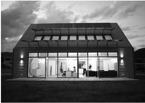
Fig. 4. Solar-Activhouse, Kraig, Austria