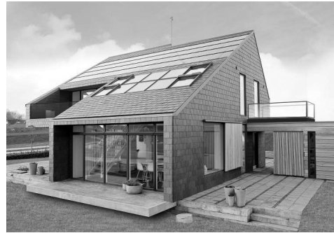
Fig. 5. Home for Life, Lystrup, Denmark

In those buildings, a hybrid ventilation was used, which means natural ventilation in summertime and mechanical ventilation (with heat recovery) during wintertime. In the transition seasons of spring and fall, the hybrid ventilation is switched on and off under the influence of outdoor temperature changes.