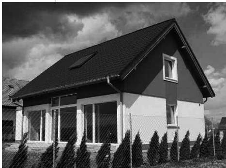
Fig. 1. Passive house in Solec near Wrocław

The first passive building in Poland – certified by the Institute of Passive Houses in Darmstadt – was built in 2006 in Solec, near Wrocław.