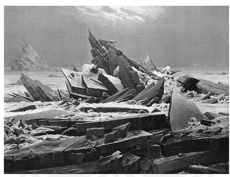
Ill. 7. Caspar David Friedrich, The Sea of Ice, 1823–1824, oil paint