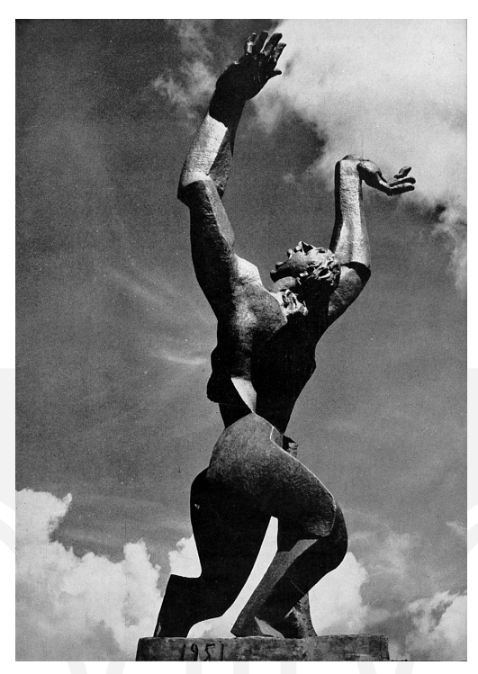
III. 1. Ossip Zadkine, The Torn City of Rotterdam, The Netherlands 1953 ( Rotterdam Der neubau einer Stadt , edited by C. Van Traa)