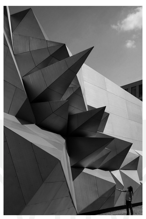
III. 5. Coop Himmelb(l)au, Pavilion 21 MINI Opera Space (Munich Opera Festival 2010, Munich, Germany, 2008–2010)