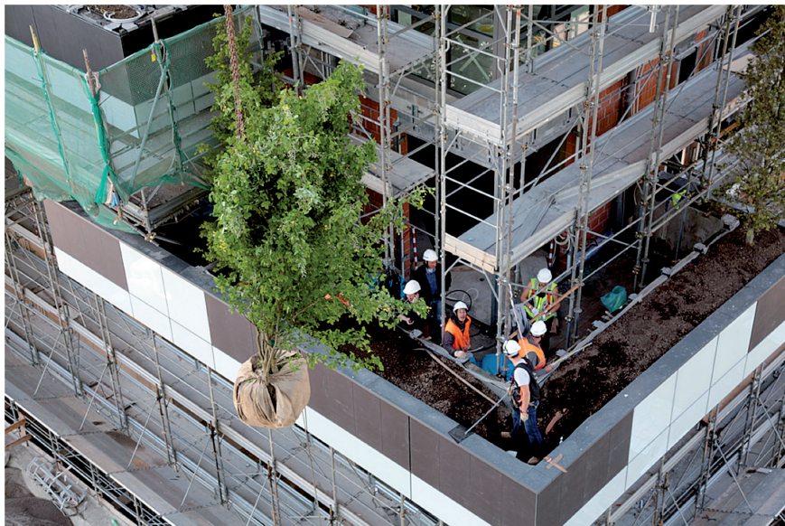
III. 9. Bosco Verticale, Vertical Forest. The steel-reinforced concrete balconies were designed to be 28 cm thick, with 1.30 metre parapets (Image: Boeri)