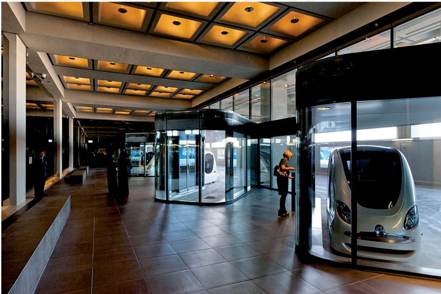
III. 4. Masdar personal rapid transit podcar, Masdar City, Abu Dhabi, United Arab Emirates