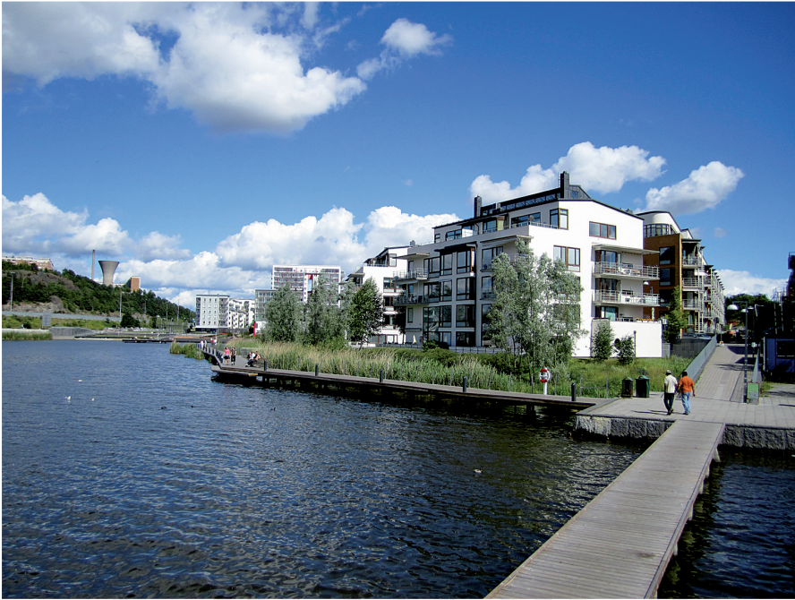
III. 3. The new district of Hammarby Waterfront, Stockholm, Sweden