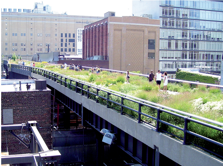
III. 7. The High Line at 20th Street, looking downtown, an aerial greenway. The vegetation was chosen to pay homage to the wild plants that had colonized the abandoned railway before it was repurposed