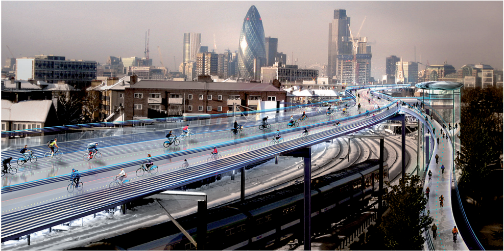
Ill. 5. Due to the high congestion in London, the architects have thought of elevated pathways instead of constructing new roads and tunnels (Image: Foster + Partners)