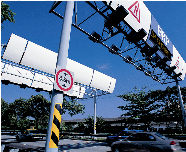
III. 8. The entry into the CBD (Central Business District) zone, Singapore