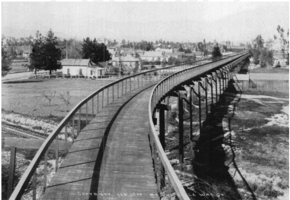
Ill. 6. A tolled elevated cycleway connecting Pasadena and South Pasadena in 1900