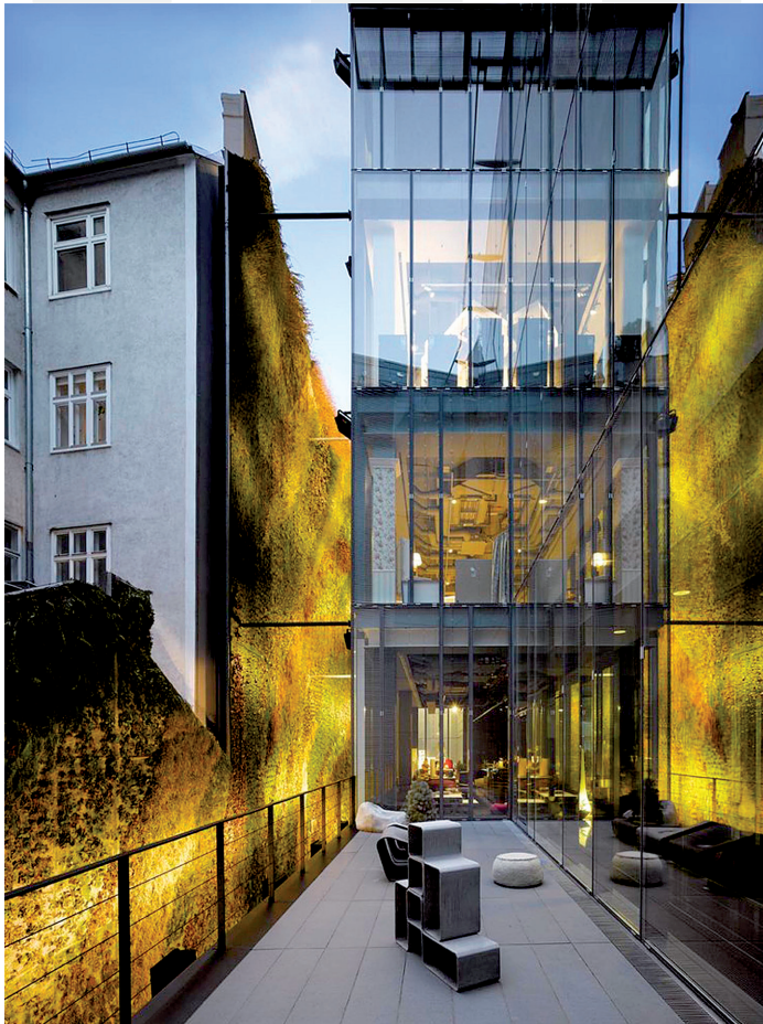
III. 2. Nouvel-Tower, Praterstasse 1, Vienne