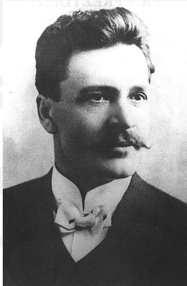
Fig. 2. Ignacy Mościcki, Freiburg 1907

Mościcki's activities in Switzerland were marked by successes but the work atmosphere did not always allowed freedom and the necessary effectiveness of research. This was due to crossing of scientific ambitions and financial interests of factories, a phenomenon typical for the field of technology. It happened many times that Mościcki, forced by circumstances, sold his ideas – they were not fully elaborated at the time – to different firms, receiving only small sums of money in return. The purchasers implemented a given idea and put appliances on the market after having given them various commercial names. This was the reason for the squandering of many valuable inventions of Mościcki. Today little is known beyond the fact that these inventions should be traced back to him.