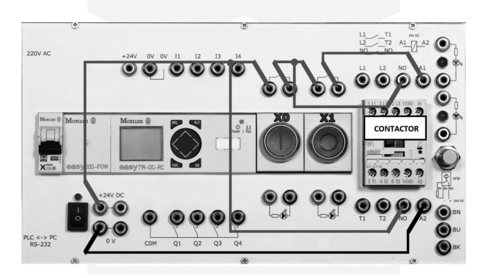
Fig. 5. The electrical connections of a latch circuit with STOP priority Rys. 5. Elektryczne podłączenie styku z podtrzymaniem z priorytetem STOP

The tasks ranging from very simple (connect one device to the PLC) to the tasks requiring usage of twenty wires are included in the prepared instructions.