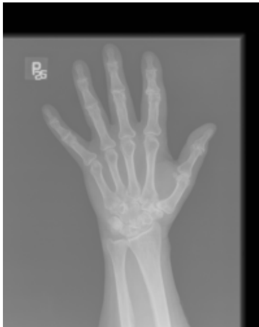
Fig. 1. An example of an original picture which is an input to the algorithm discussed herein. Observe a black overall background, grey photographic film background and a lighter hand on it. As seen especially in the fingers region, there is very small difference in luminance between the finger and the film background. Moreover, the finger area is darker than the wrist area. Both factors are among others causing the fact that X-ray image processing is an especially difficult task

The serious problem, which is the criticised design fault, regards the function (3). As a fact, \log_2 0 equals to -\infty , making the function (3) incomputable on arguments \{0, 1\} . It is a serious flaw, because the function (2) returns 1 when both examined pixels have identical luminance, which is a common situation.