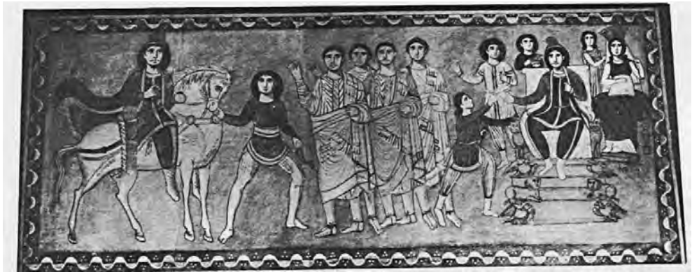
Purim panel, after Gutman 1992

More important is the following inscription (Geiger 1956: no. 44) which is placed on the panel scene associated with the story of Purim: