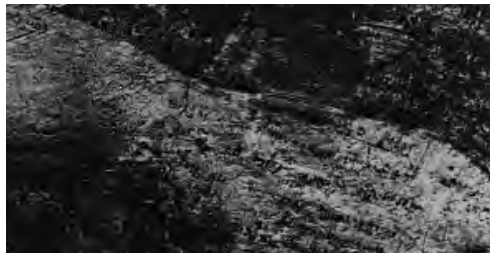
After Geiger 1956, pl. XLIV