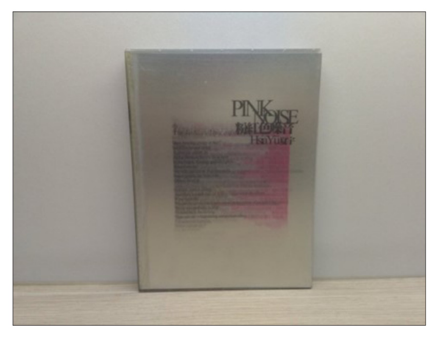
Figure 2. Hsia Yü Pink Noise (2008)

Pink Noise is a poetic volume generated using Sherlock software, a search engine for Mac OS X, fitted with a plug-in for machine translation (MT) (see Fig. 2). An accidental launching of the programme inspired the poet to carry out a series of translatorial "experiments" on poems by Shakespeare, E.A. Poe, and Pushkin, as well as fragments of texts from blogs and websites linked to spam messages that were coming into her mailbox. In order to increase the verbal noise, she subjected them to several mechanical translations, out of which she created textual collages. The result was a bilingual poetic volume of 33 poems printed on transparent sheets. Using a transparent surface draws our attention to the medium (the channel of communication), which may be interpreted as an ironic commentary on the translator's invisibility, that is removing him or her from sight, or even "killing them with the use of the machine" (Lee 2011). It was also machine translation, i.e the Google translator, which was applied to translate three poems from Pink Noise, published in issue 36 of eleWator, a literary-cultural magazine devoted to experimental literature (those interested will also find other examples of translation experiments there).